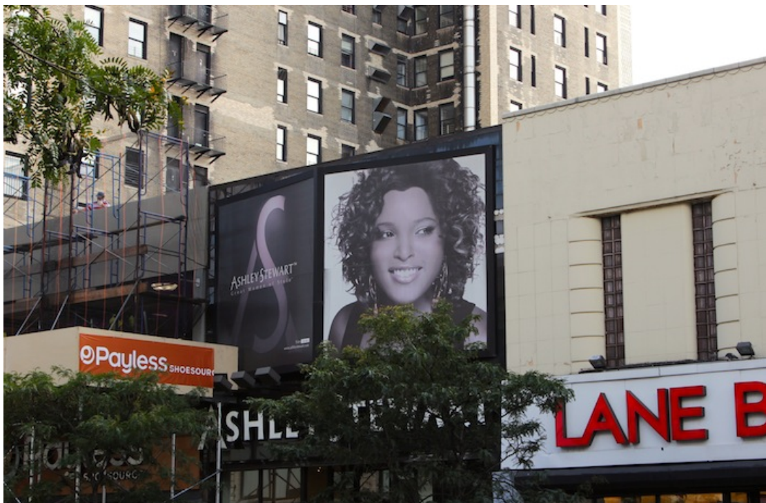
Fig. 16 – She's smiling.