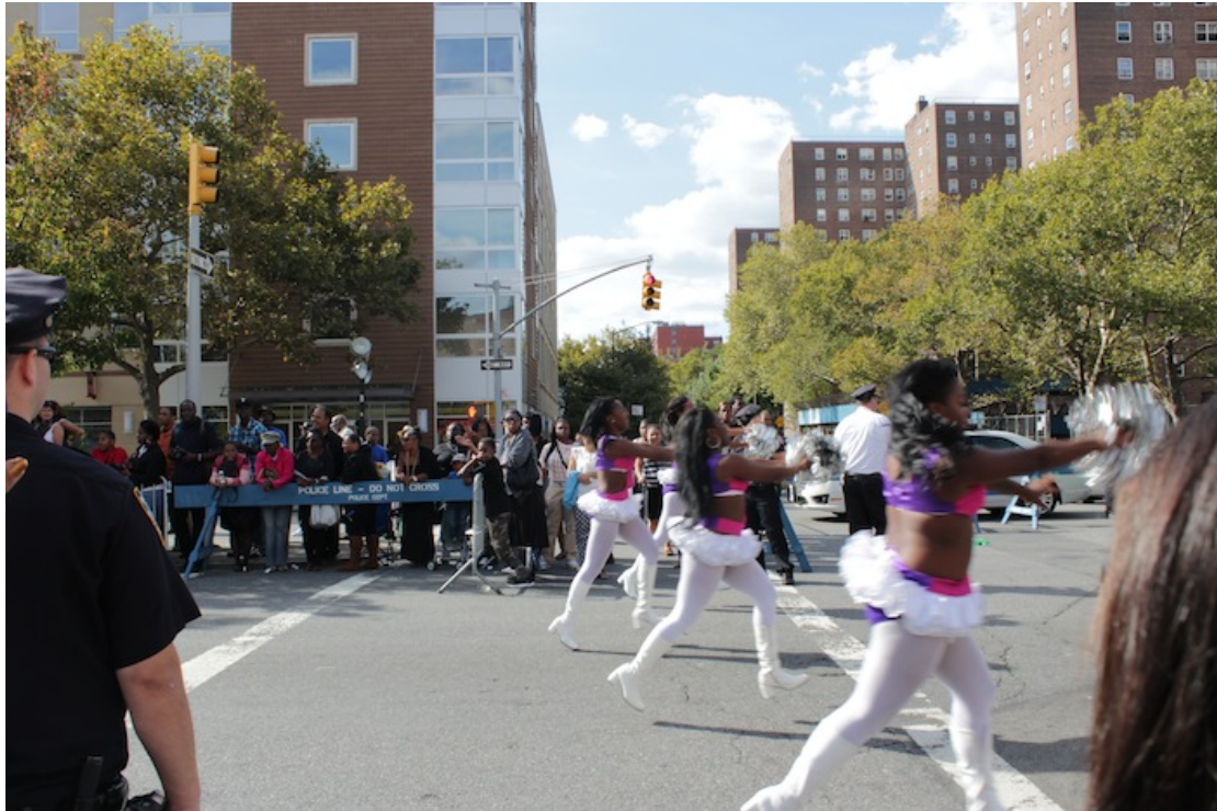
Fig. 17 – Main Street Parade along Adam Clayton Powell Jr Boulevard.