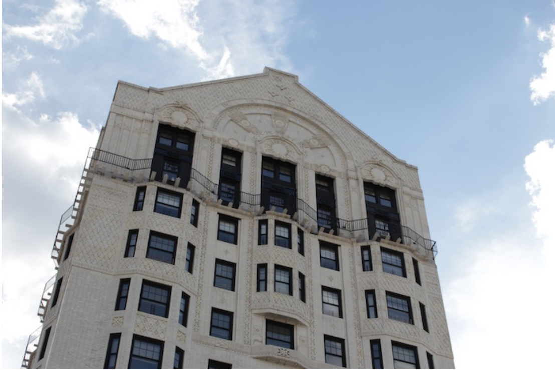
Fig. 19 – The former Hotel Theresa, now an office block. In its time, it was known as the “Waldorf-Astoria of Harlem.” Guests included Louis Armstrong, Jimi Hendrix, Ray Charles and even Fidel Castro.