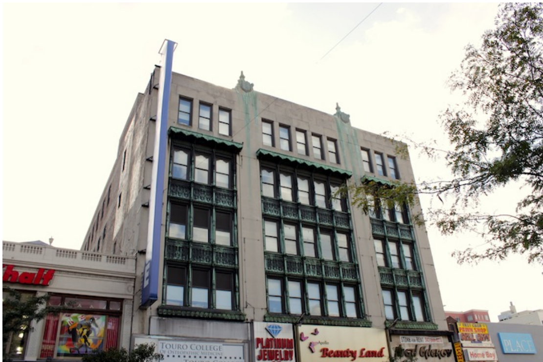
Fig. 18 - The Touro College of Osteopathic Medicine Building. This was formerly the Blumstein Department Store, where Martin Luther King Jr was stabbed in 1958 by a deranged black woman while signing copies of his book Stride Toward Freedom .