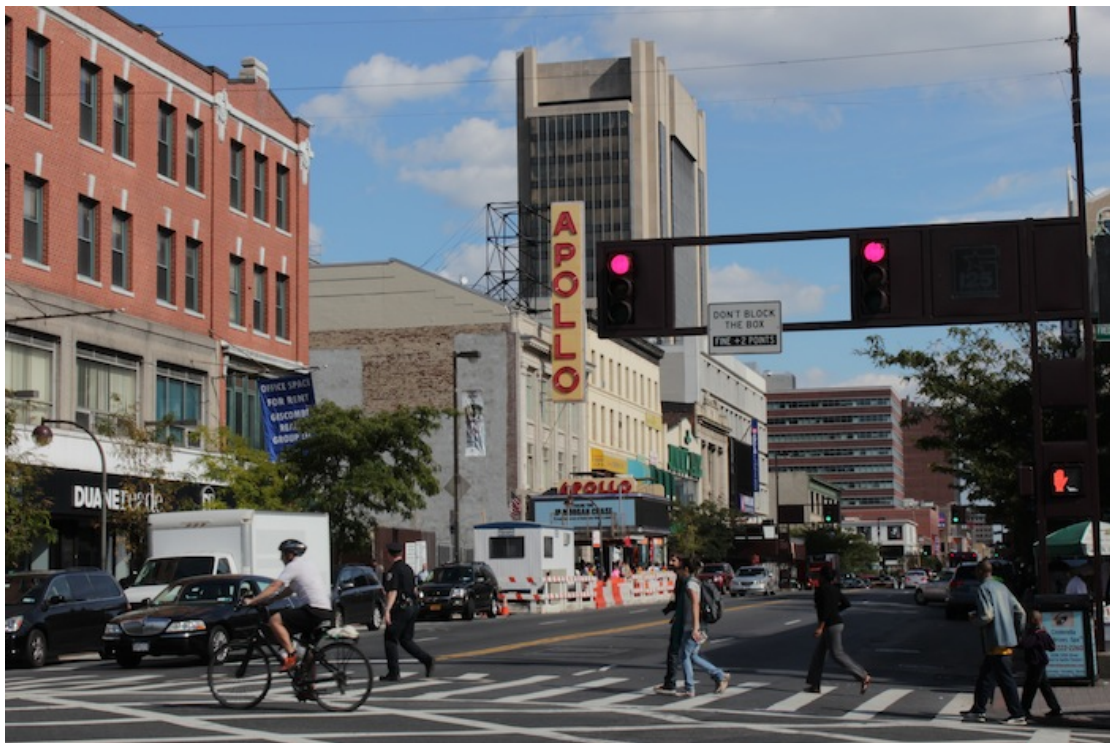
Fig. 13 – The Apollo Theater, the beating heart of Harlem.