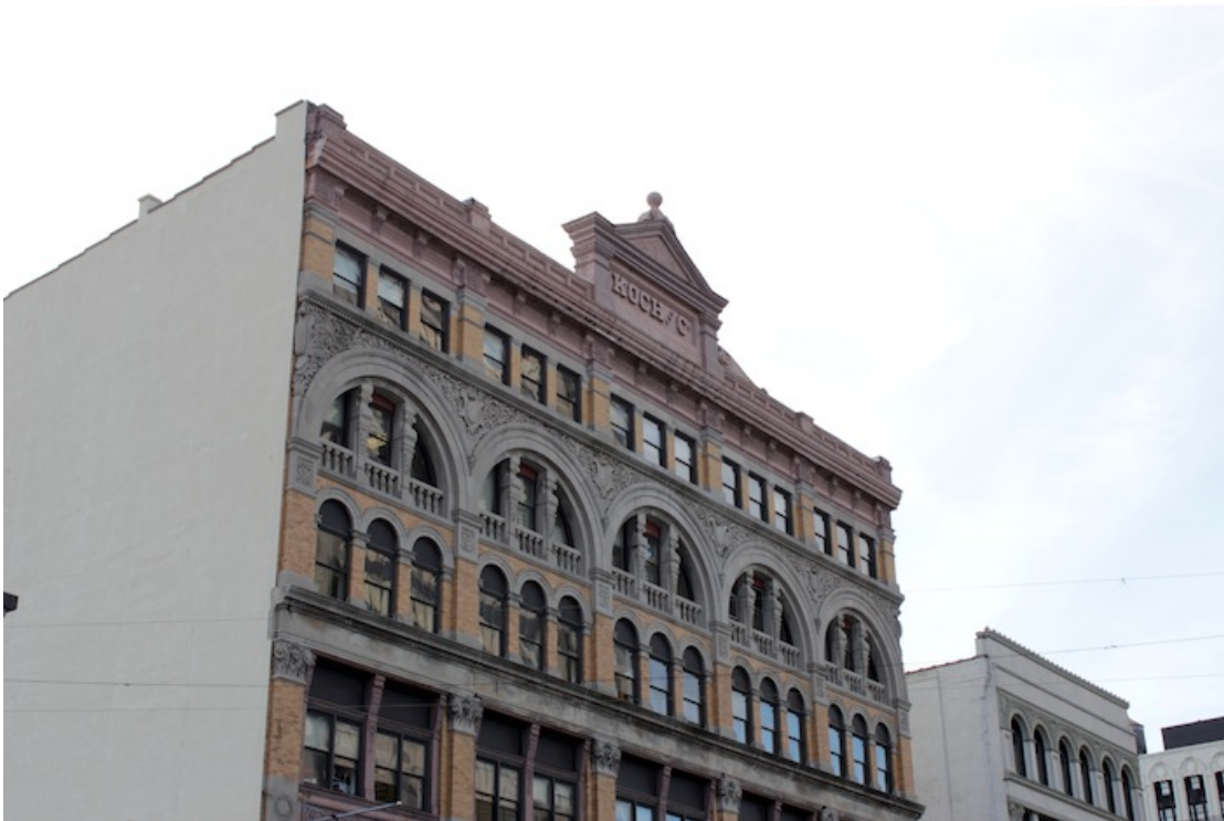
Fig. 20 – The Koch & Co. Department Store building, now an office block.