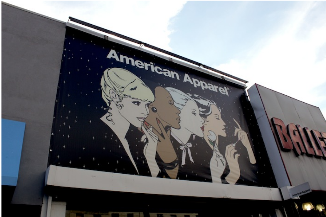
Fig. 15 – American Apparel