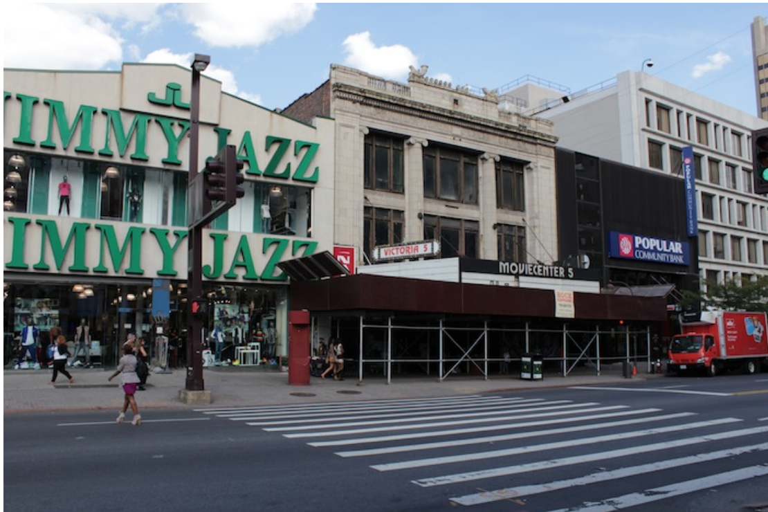
Fig. 14 – Jimmy Jazz.