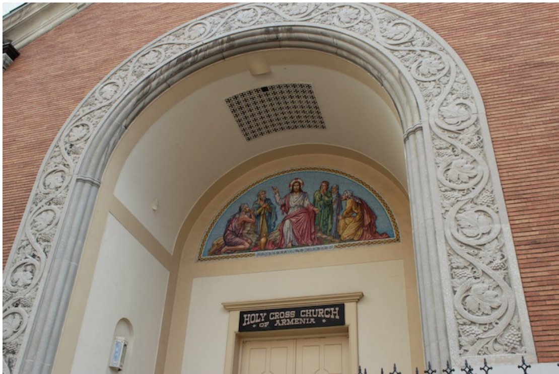
Fig. 6 – Holy Cross Church of Armenia.