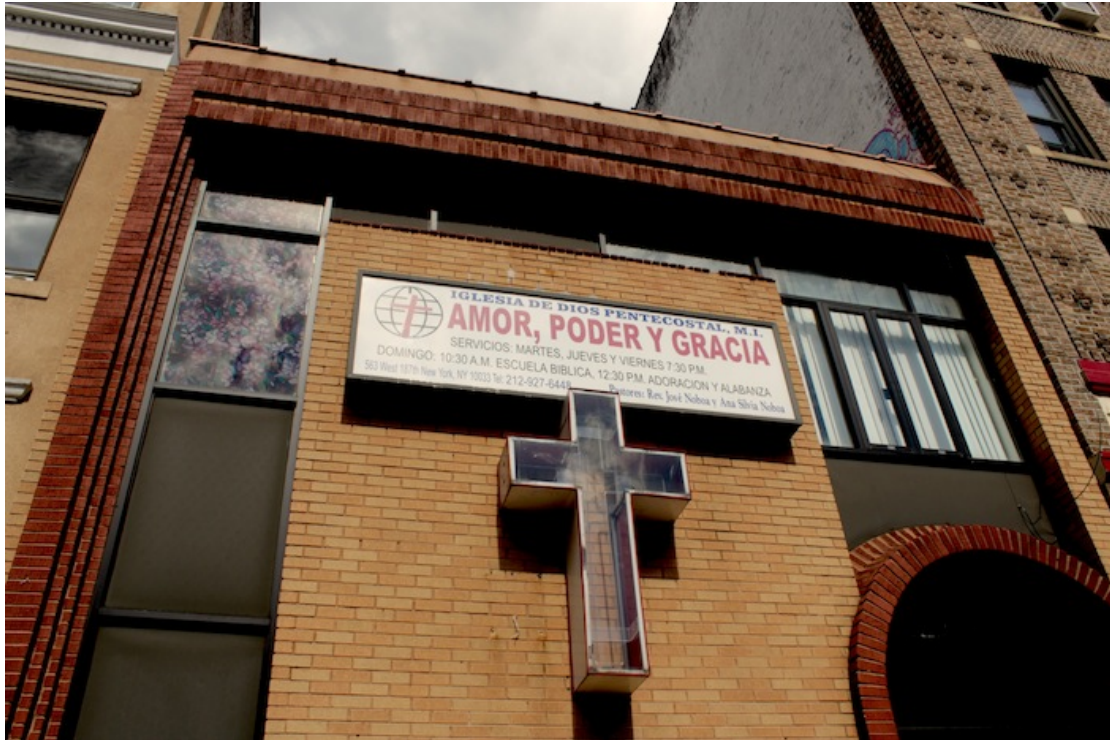
Fig. 7 – Iglesia de Dios Pentecostal, also across from Holy Cross Church.