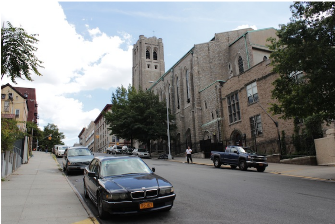
Fig. 10 – St Elizabeth's Church , looking like a mediaeval Crusader Fortress in the Holy Land.