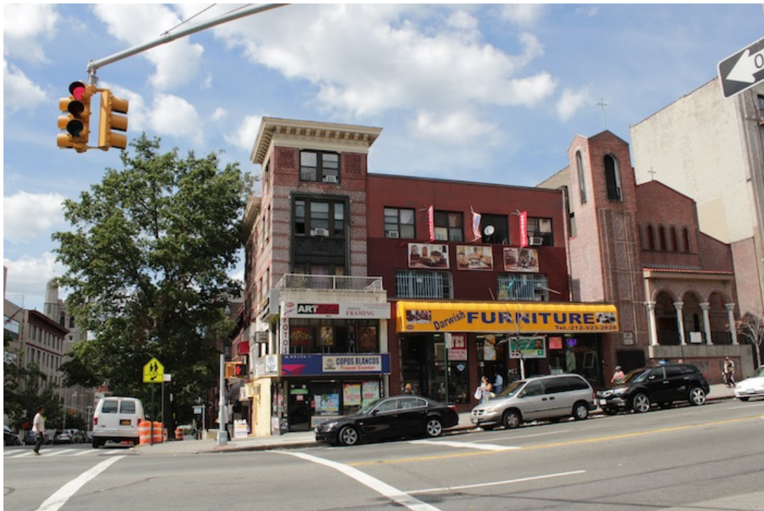
Fig. 8 – Junction of St Nicholas Ave, with the Greek Orthodox Church of St Anargyri.