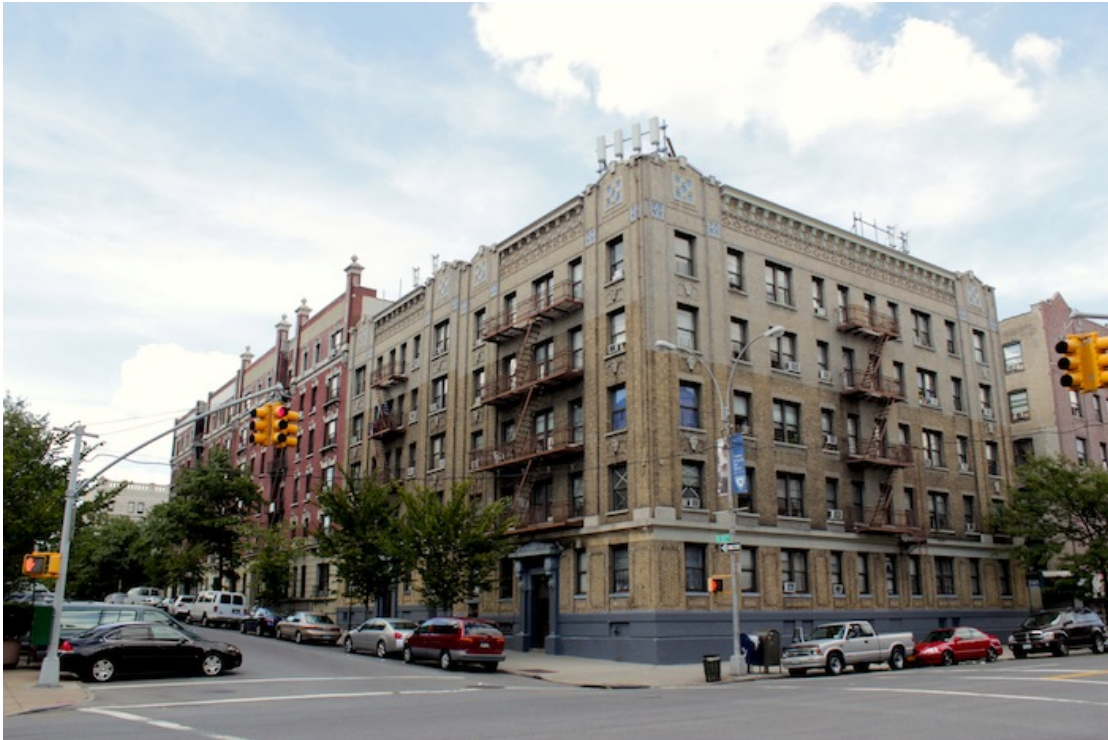
Fig. 3 – Historic apartment buildings across from Yeshiva University