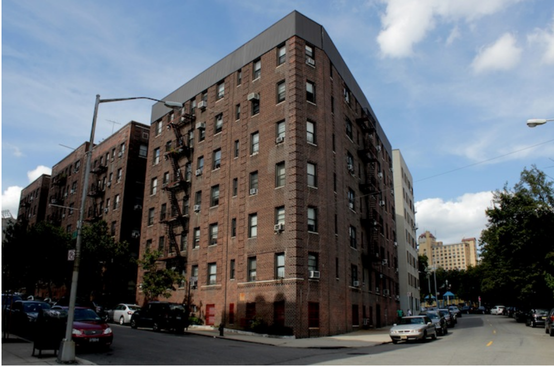
Fig. 1 – Apartments on Laurel Hill Terrace.