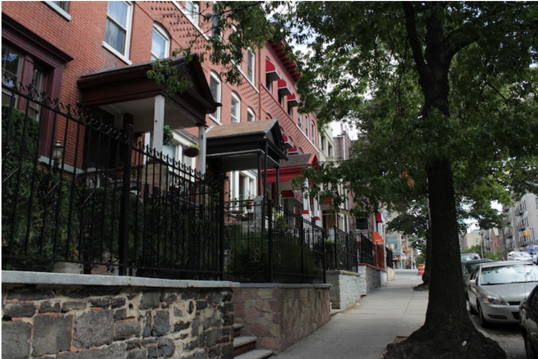
Fig. 9 – Terraced houses, just before Wadsworth Ave.