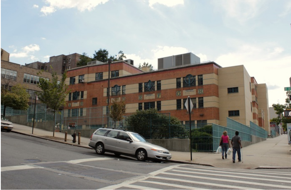
Fig. 11 – Schoolyard at the foot of the hill on Broadway.