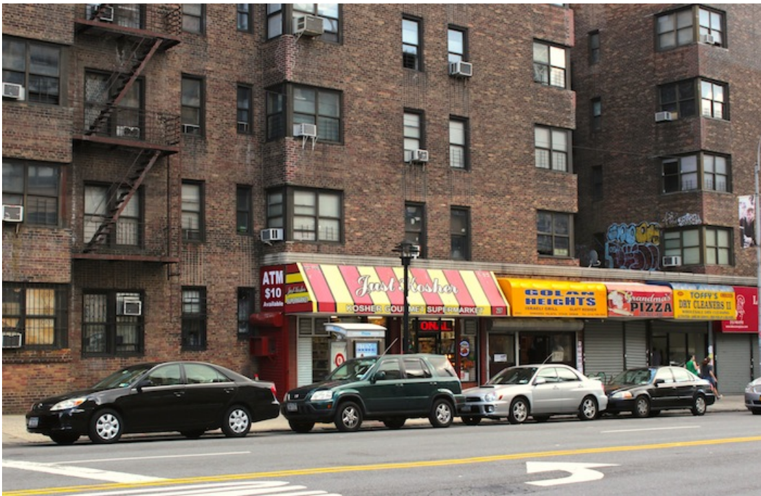
Fig. 2 - The Golan Heights, on Amsterdam Ave.