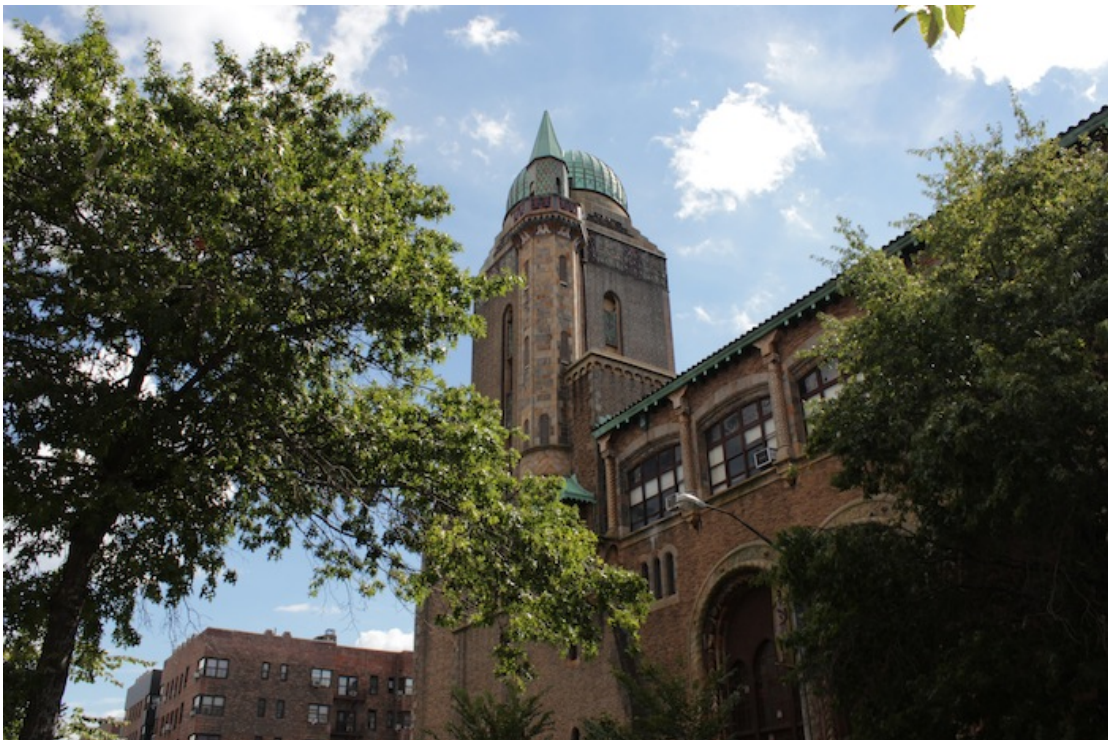
Fig. 4 – Yeshiva University, Wilf Campus . Built in a Moorish Revival Style, and looking like a castle in mediaeval Andalusia.