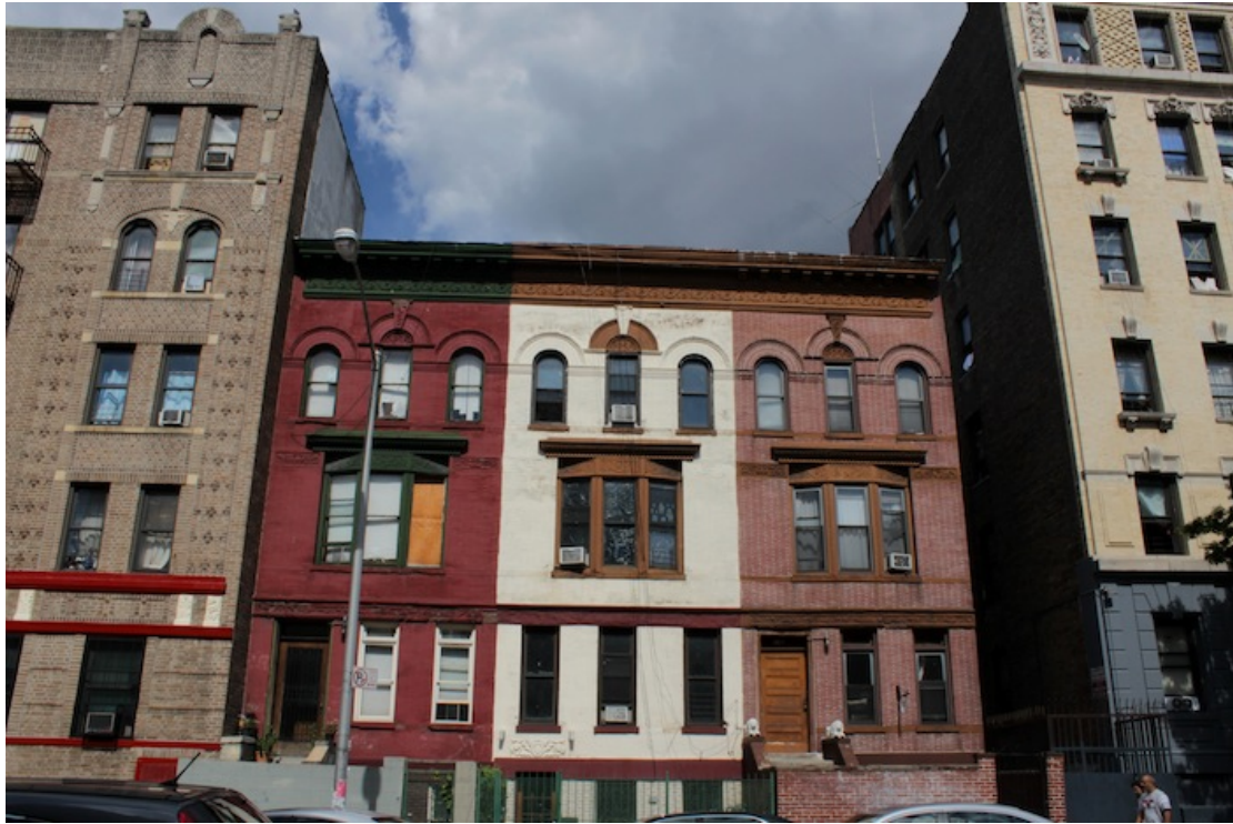
Fig. 5– Tenements across from Holy Cross Church, just before Audubon Ave.