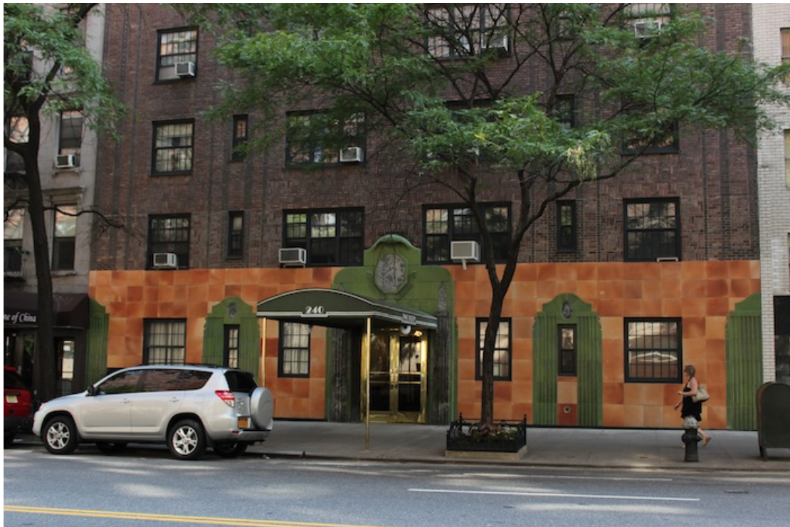
43 – Upscale restaurant.