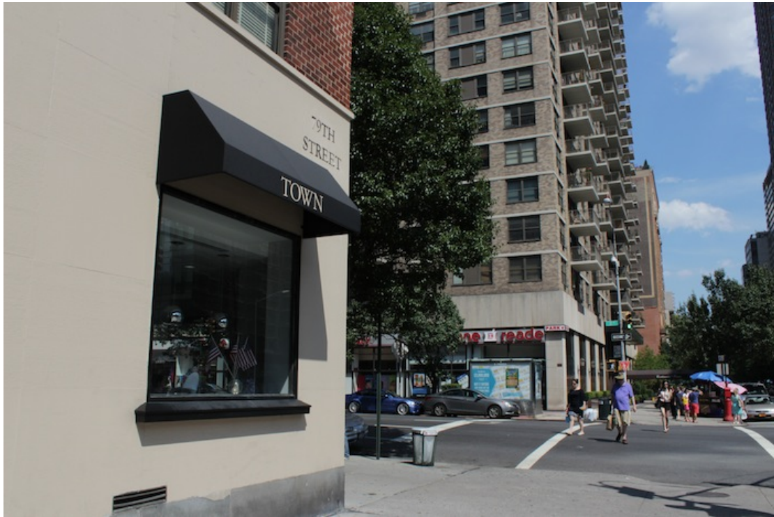
44 – Real Estate Agent.