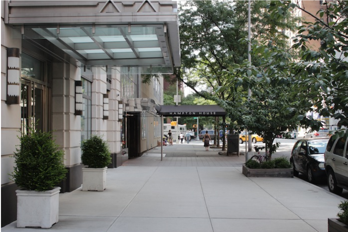
47 – Uber modern, uber-chic apartments.