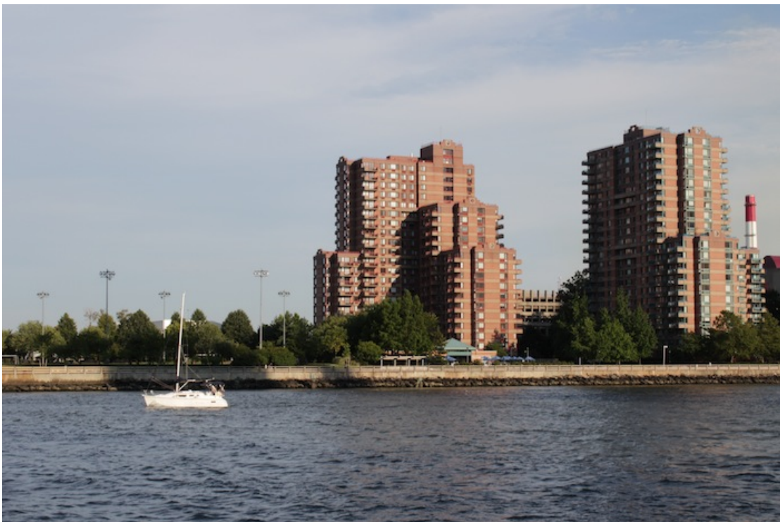
50 – Sailboat on the water.