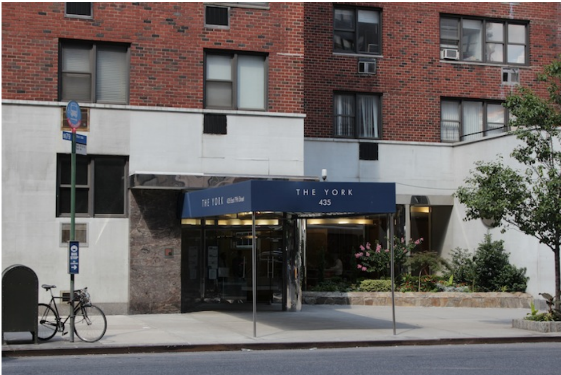
48 – Another luxury apartment complex.