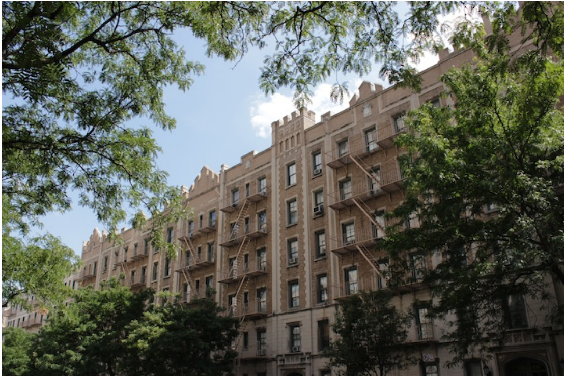
49 – Conserved historical buildings near the waterfront.