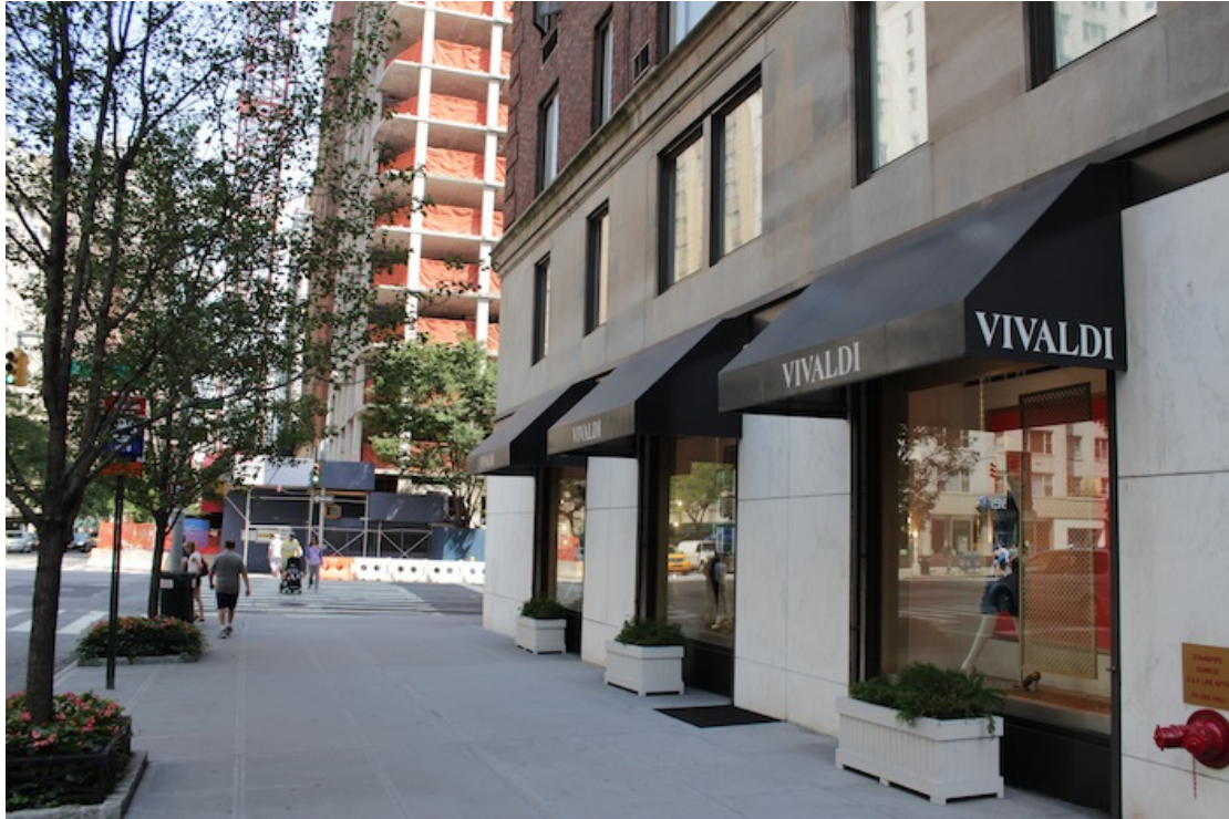
42 – Upscale boutique.