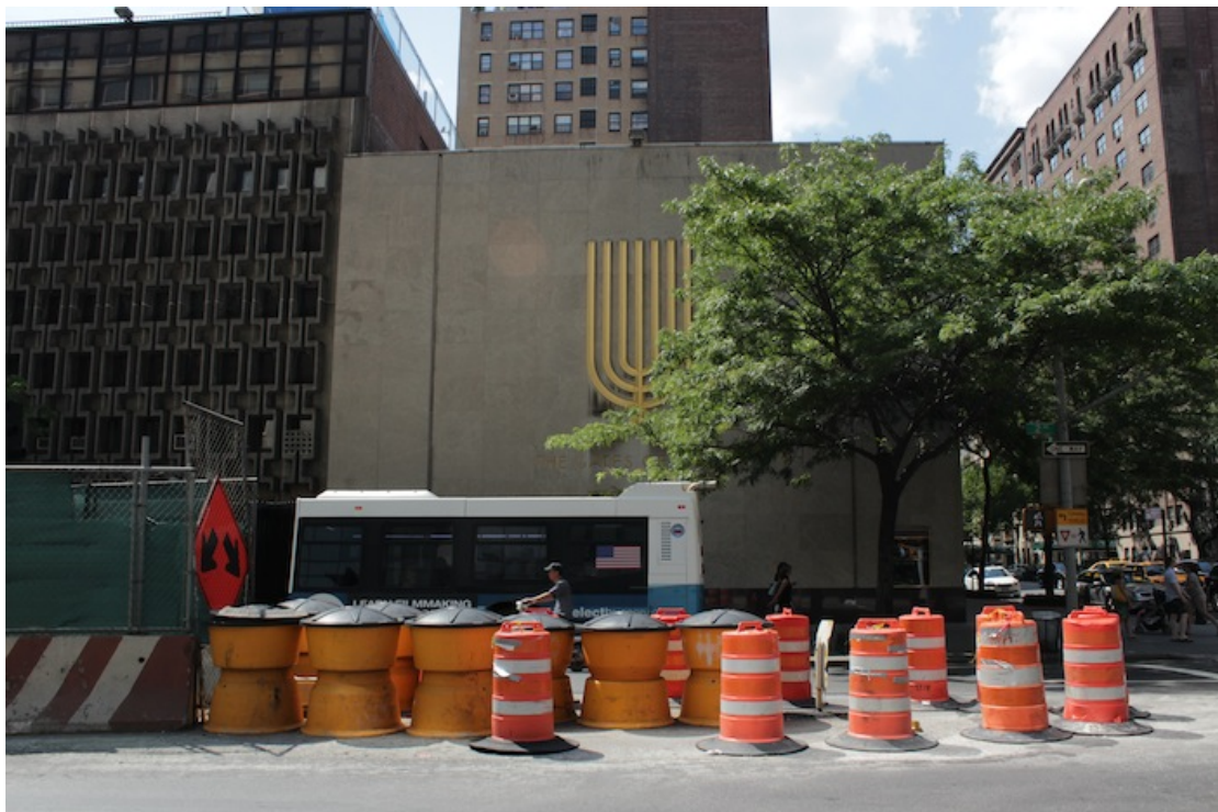
45 – Synagogue.