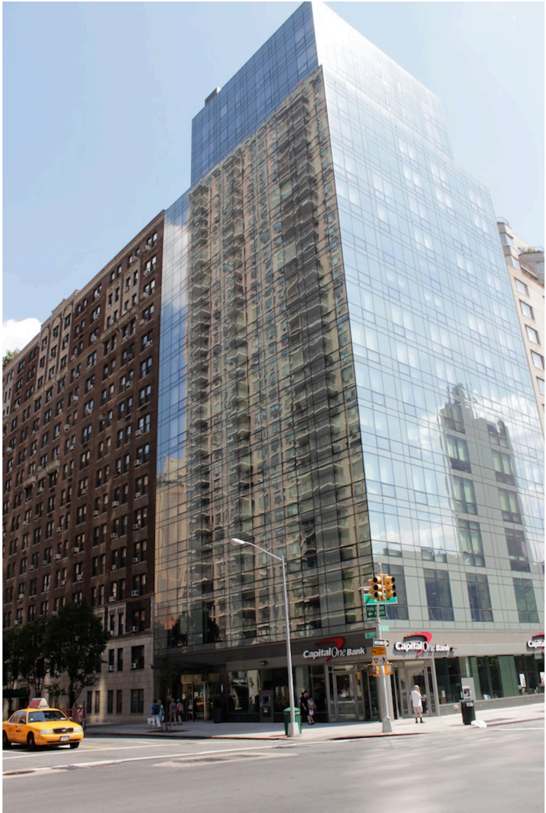
46 – Shimmering glass high-rise.