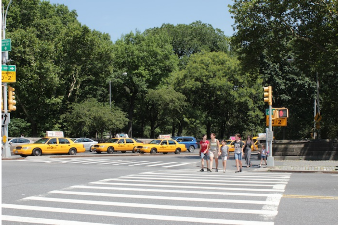
21 – Alpine intersection.