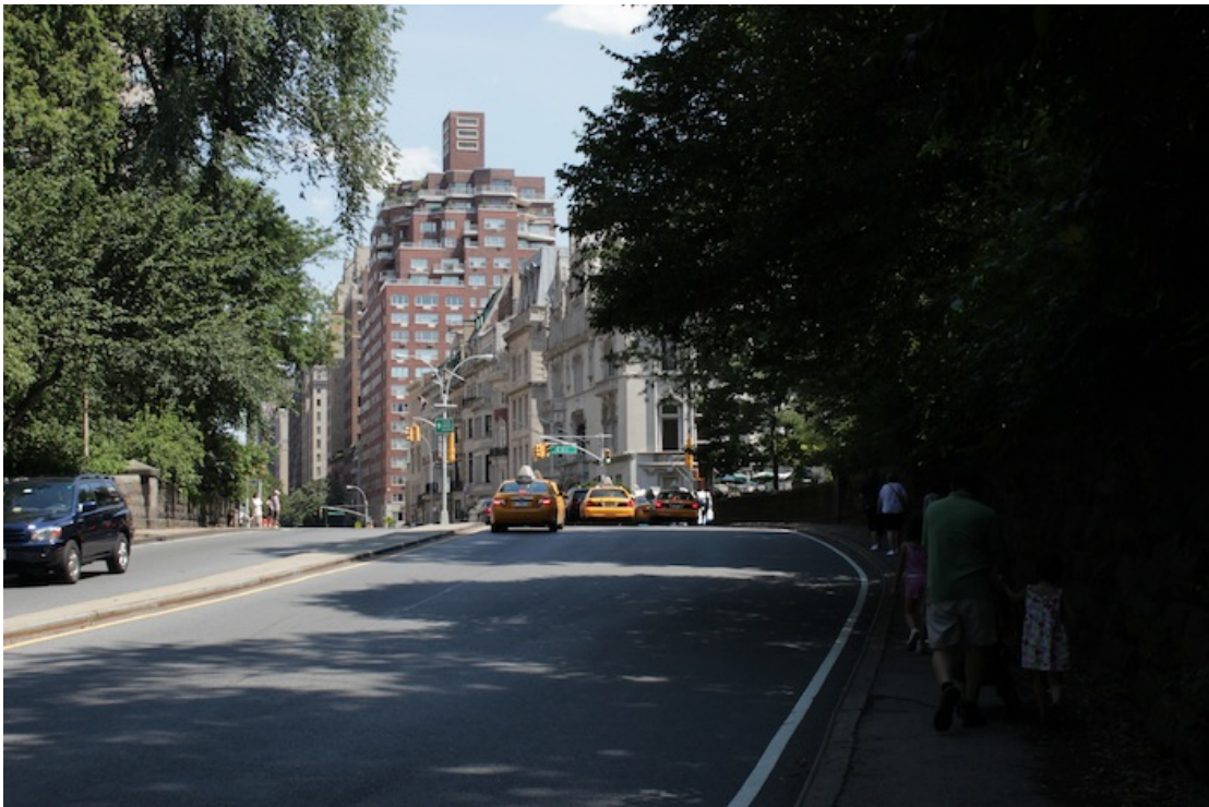
26 – Re-emerging from the forest.