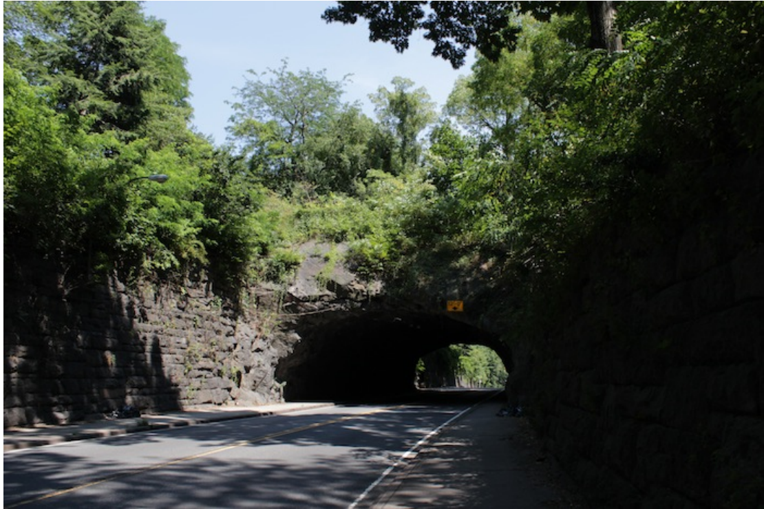
23 – Winding road tunneling though craggy rock-faces.