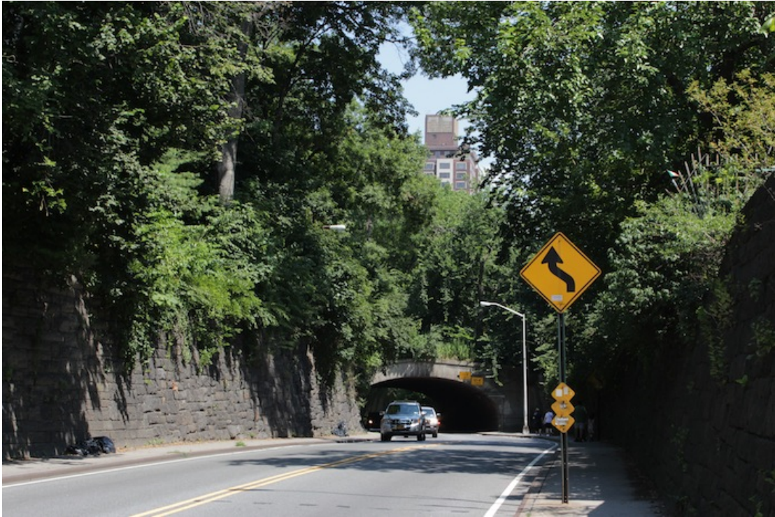
25 – Civilisation beckons.