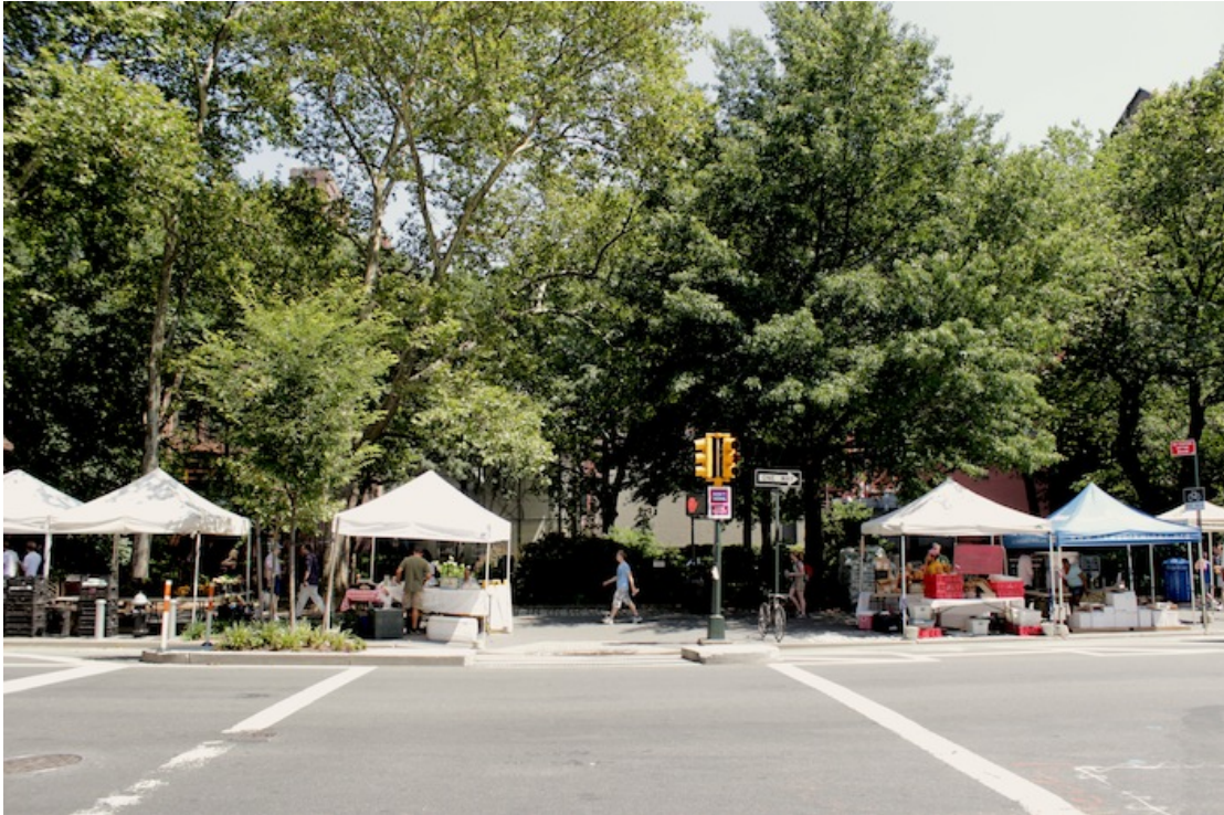
19 – Market town on the fringes of the Alps.