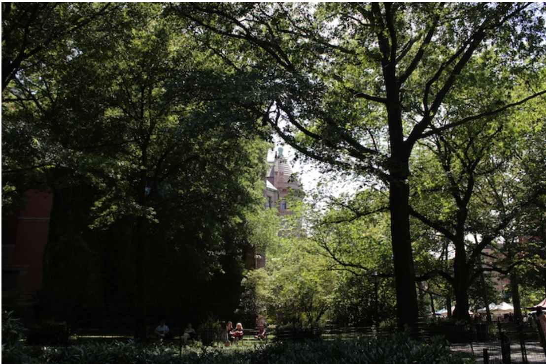
20 – Castle peeking through a break in the forest cover.