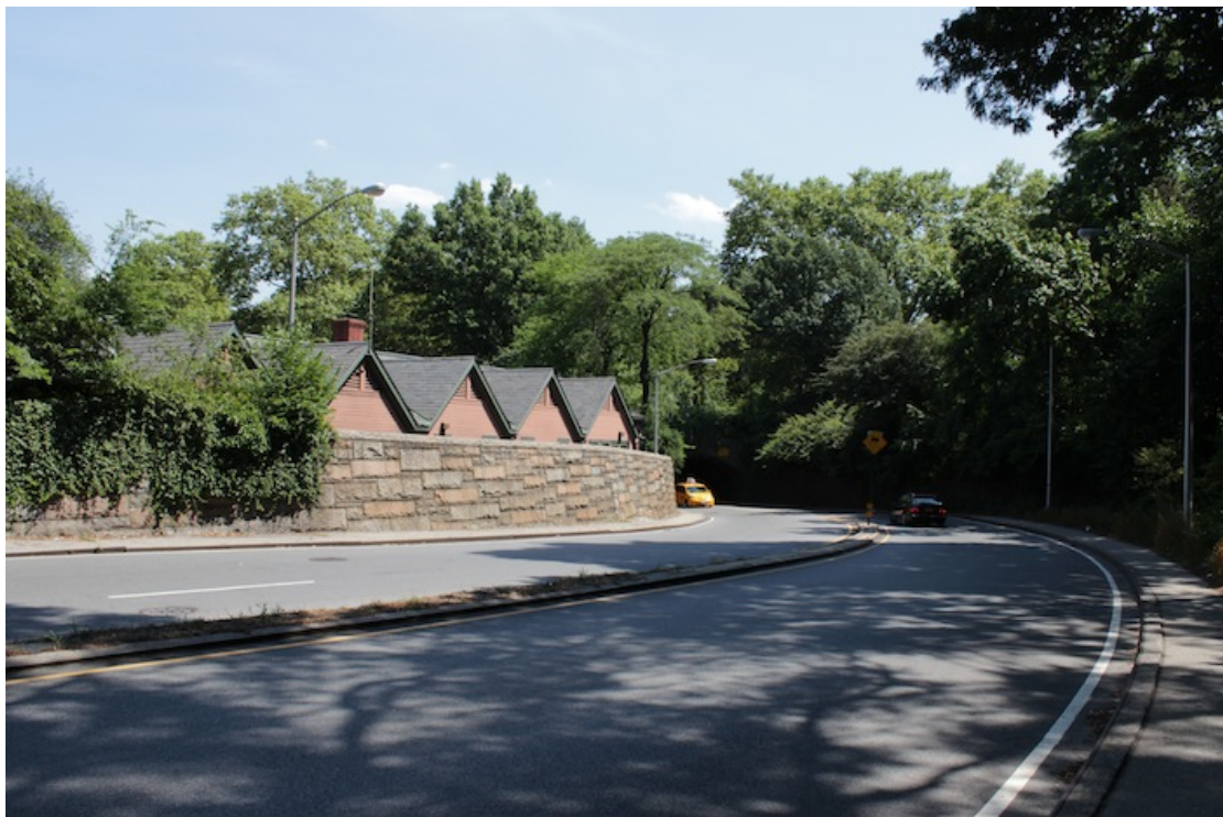
22 – Cottages in the forest.