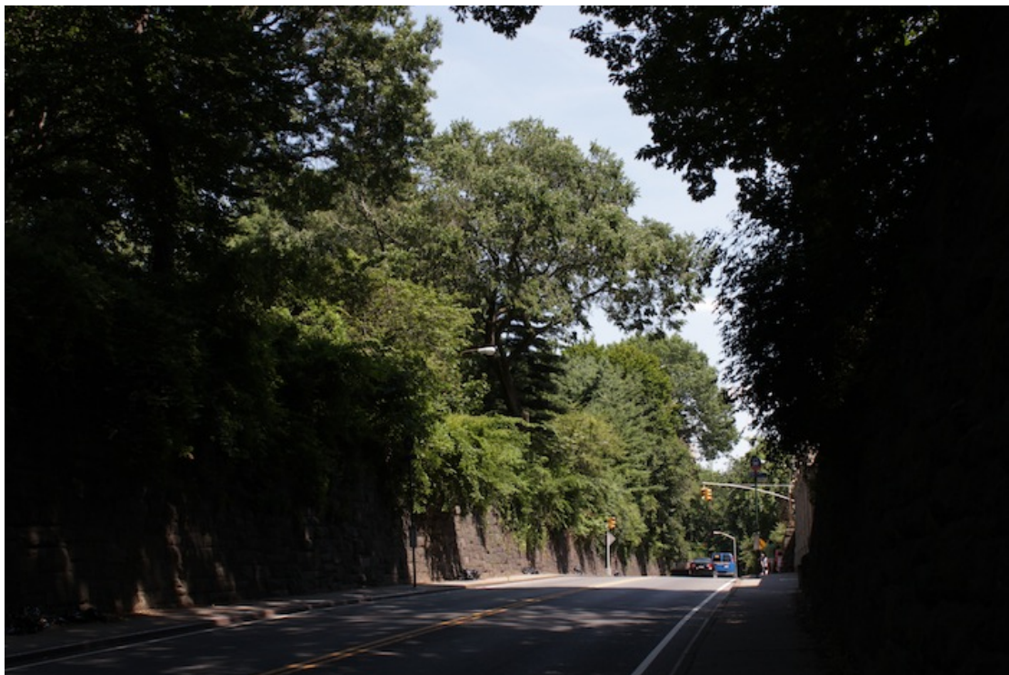
24 – Majestic evergreens.