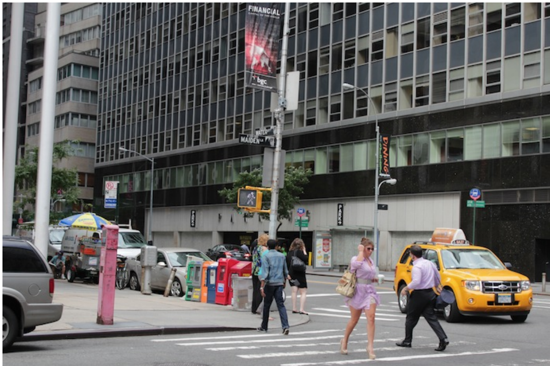
5 – A maiden slinks across the street at the junction of Maiden Lane and Water Street. Behind her is 8-Pine Street (1961), designed by Emery Roth & Sons.