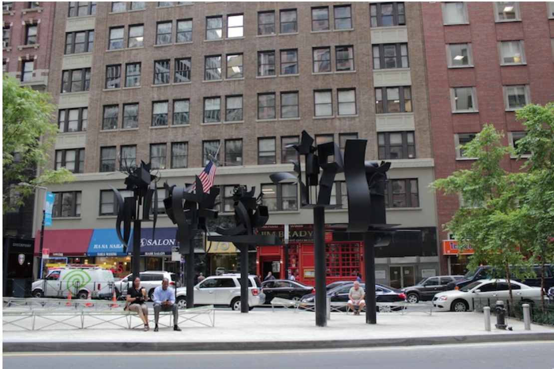
8 – A maiden sits with her gentleman friend at Nevelson Plaza, adorned with Shadows by Flags , by artist Louise Nevelson.