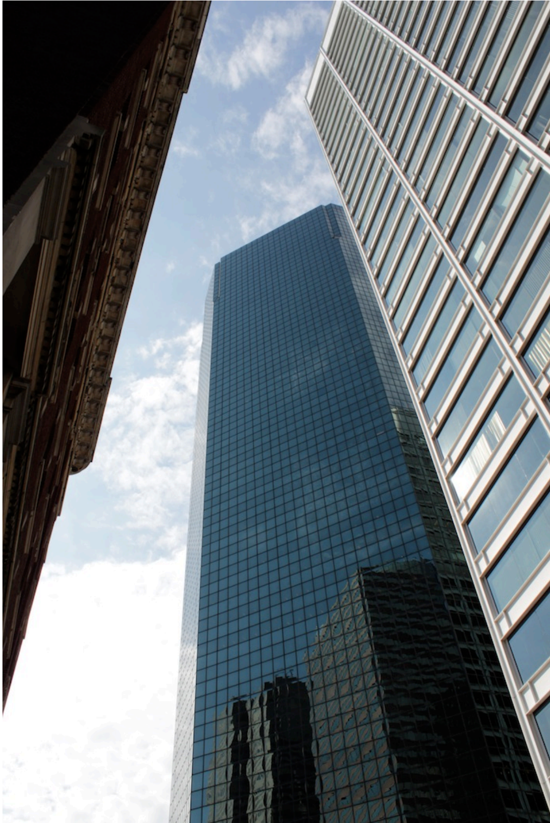
4 – Continental Center (1982) in the middle, Wall Street Plaza (1973), by I. M. Pei to the right, contrasted against a building from the 1930s, to the left.