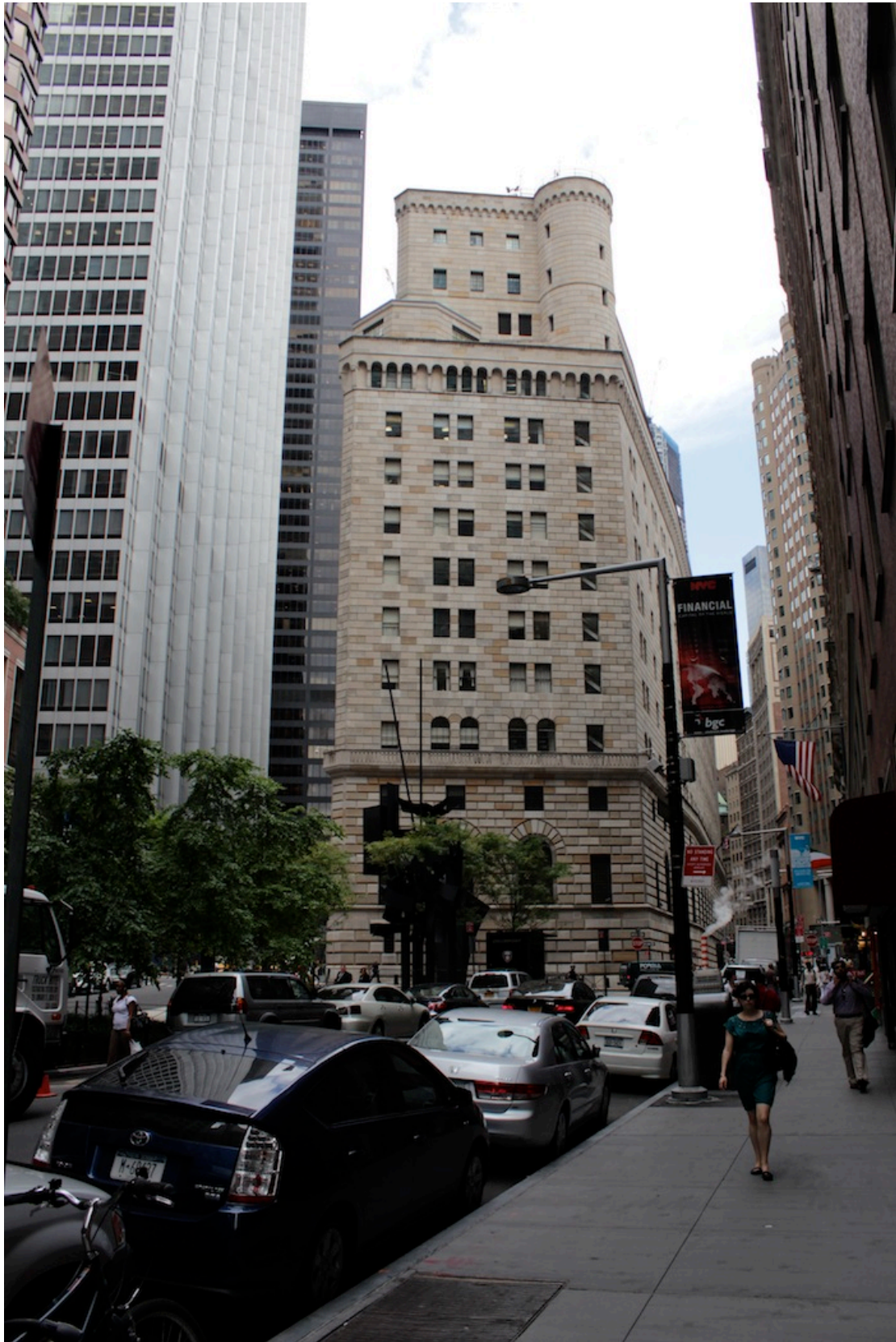
7 – A maiden slinks down Maiden Lane. Behind her is the headquarters of the Federal Reserve Bank of New York (1919 – 35), designed by York & Sawyer in the style of a Renaissance fortress.