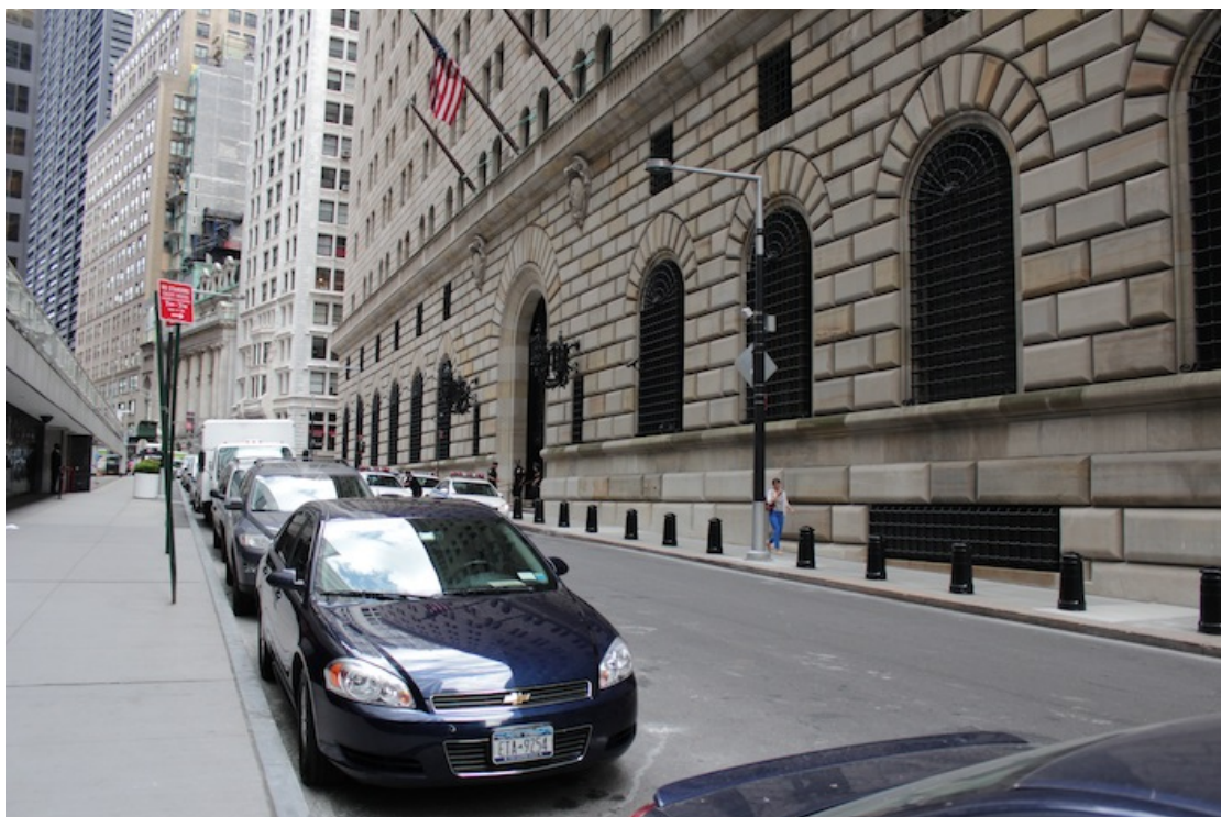
9 – A maiden slinks by the Renaissance Fortress that is the New York Fed. This building holds the largest stock of gold in the world, in its basement vaults.