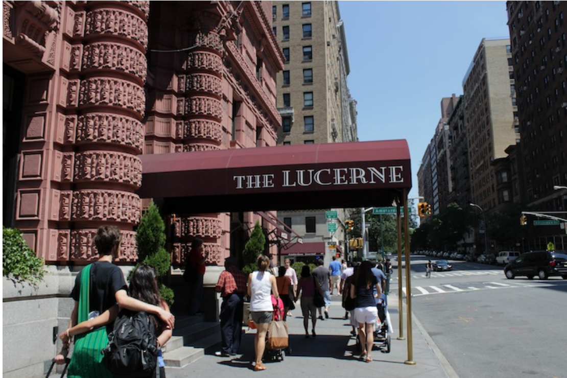
9 – The Lucerne Hotel.