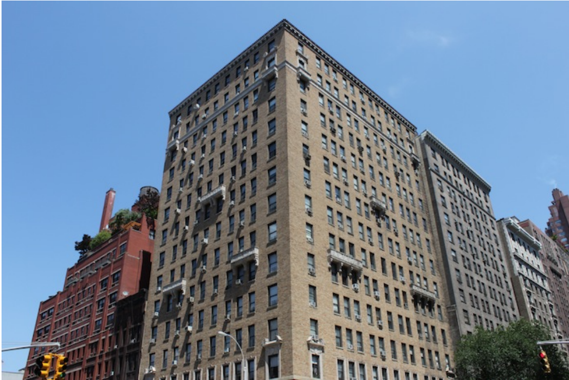
11 – Another high-rise apartment, with Italianate flourishes.