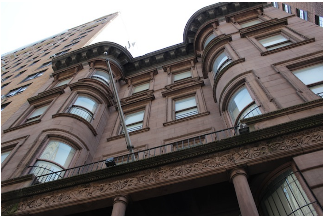
12 – School and Community House.