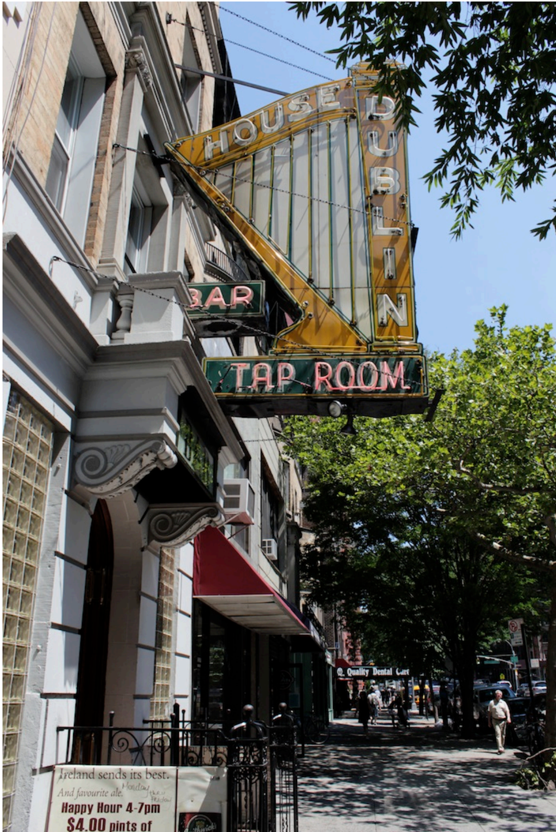
8 – Irish Pub, a ubiquitous sight in cosmopolitan cities these days.