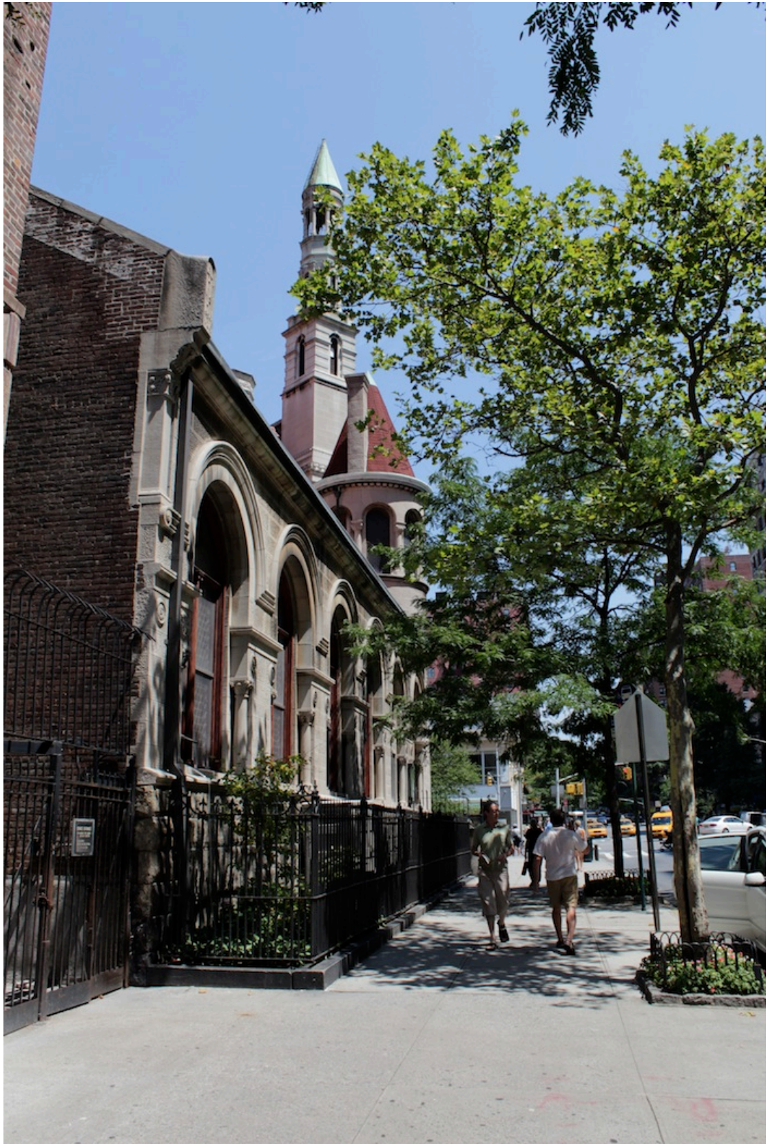
7 – Gothic Cathedral.