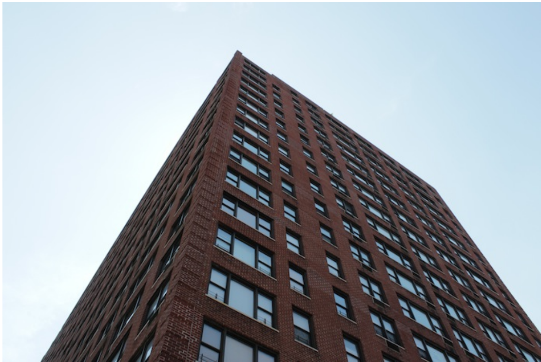
10 – Generic high-rise apartment.