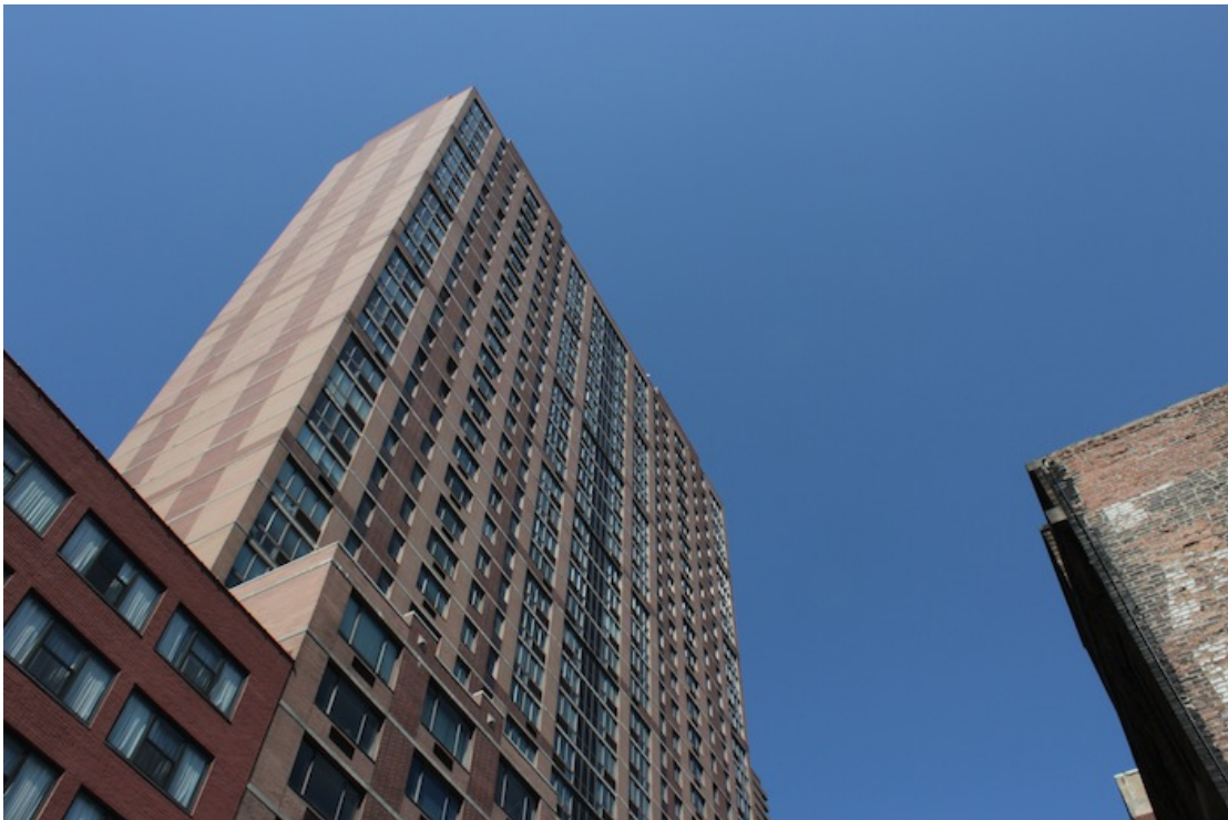
43 – No. 520: New Gotham Apartments (1998), one of the earlier luxury condominiums in the area.