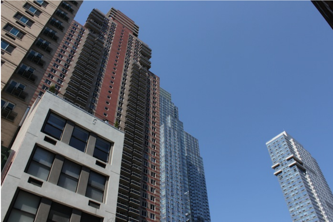
45 – The red building in the middle is No. 560: Riverbank West.