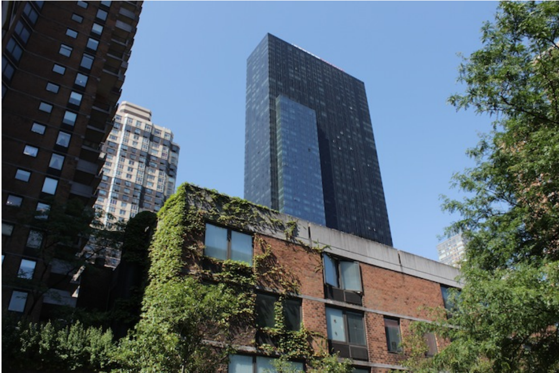
42 – View upon Yotel (2010) – a hotel building designed by Arquitectonica.