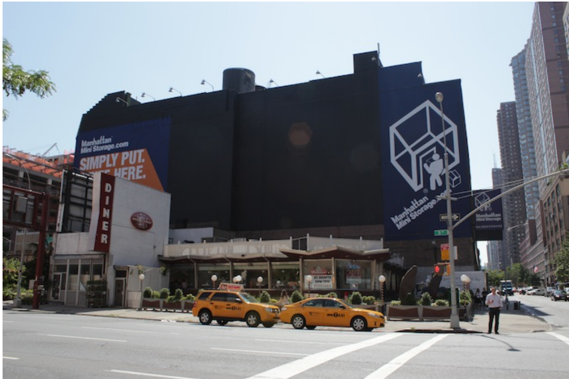
47 – Manhattan Mini Storage and Market Diner, a classic diner dating back to the '60s.