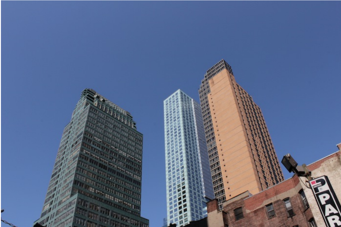
40 – View of the former McGraw-Hill building on 42 nd St (1923), designed by Raymond Hood. To the right is the Orion in blue, and the Ivy Tower in salmon, condominium complexes.