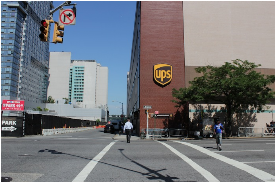
48 – UPS Parcel Post. The building in the distance is the Chinese Consulate, which occupies the former Sheraton Hotel.