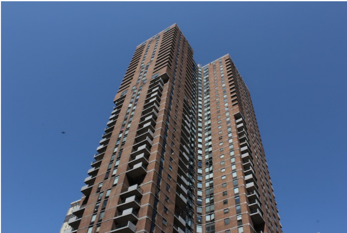
41 – Manhattan Plaza, built in the 70s to house actors and performing artists. It still does today.