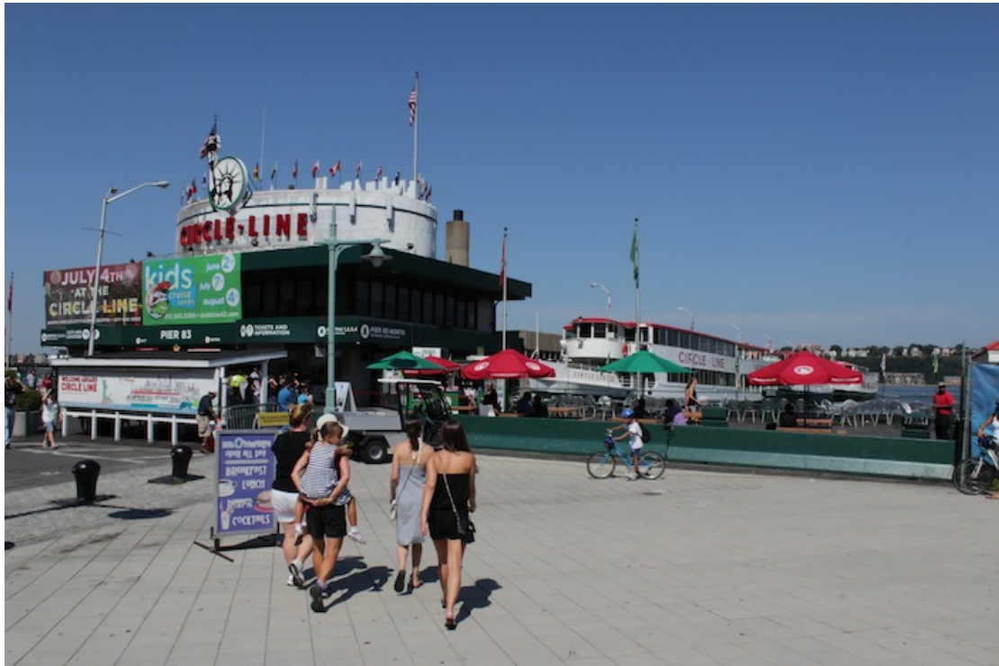
49 – Pier 84, where the Circle Line Tours take tourists and families around the island of Manhattan.