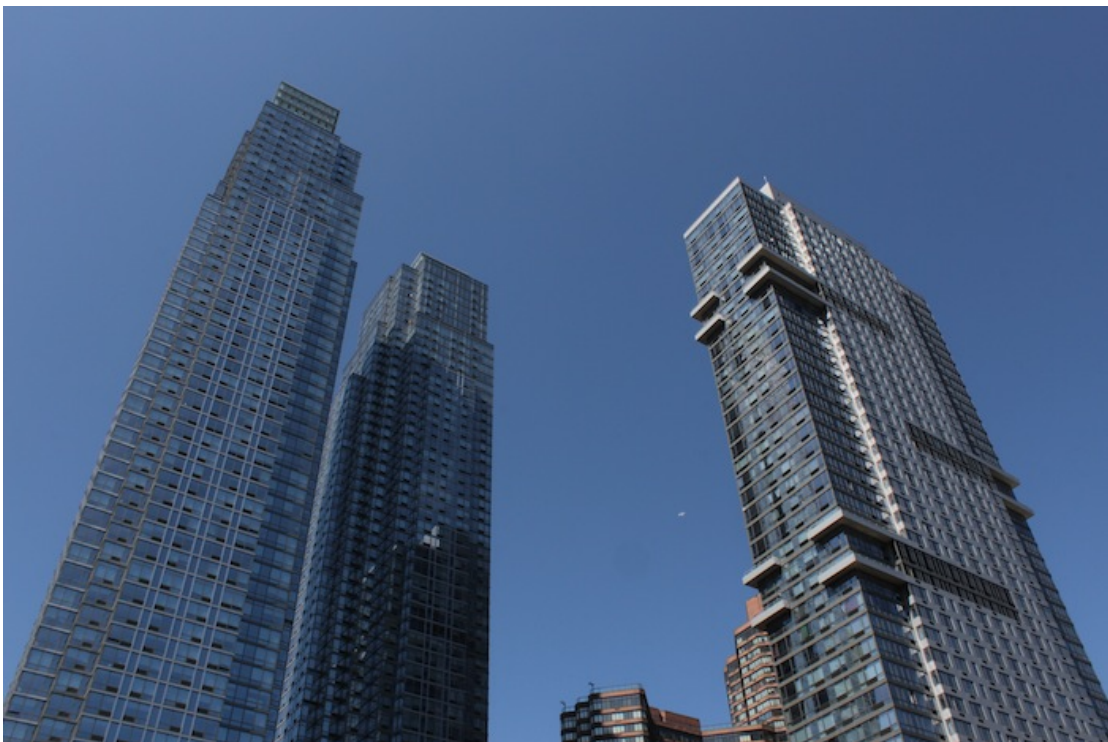
46 – At the 11 th Ave intersection are two condominium complexes designed by Costas Kondylis: to the left is Silver Towers at River Place, to the right is Atelier (2006).