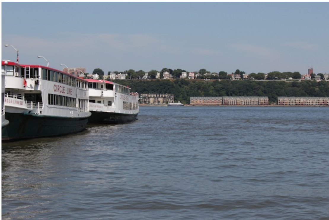
50 – The quaint storybook facades of waterfront properties in New Jersey.