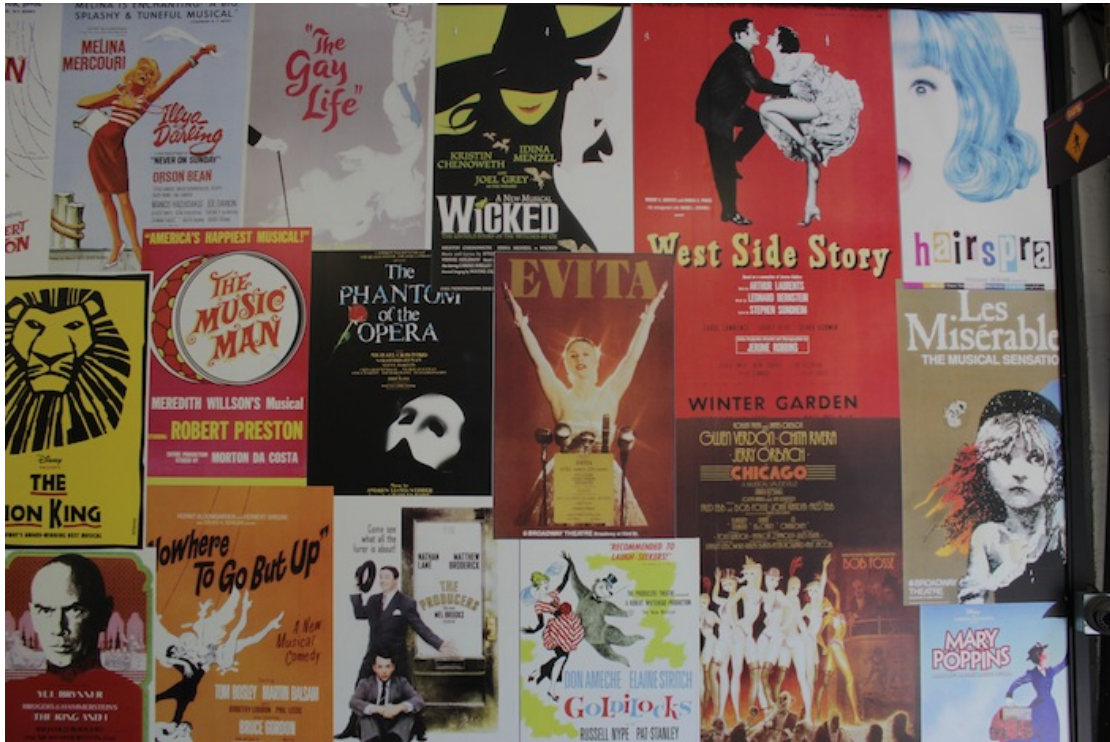
38 – Broadway Posters on the wall of a parking garage.