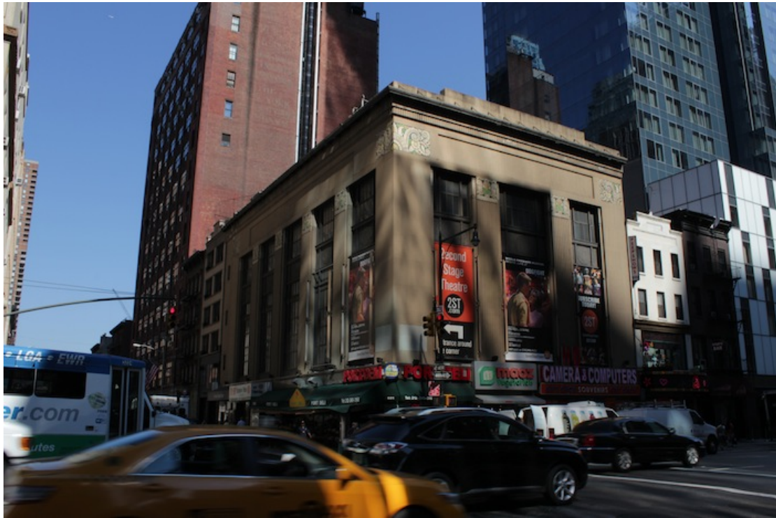
36 – No. 307: Second Stage Theatre, presenting overlooked plays. It is housed in a 1927 building.