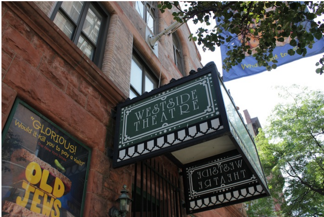
39 – No. 407: Westside Theatre