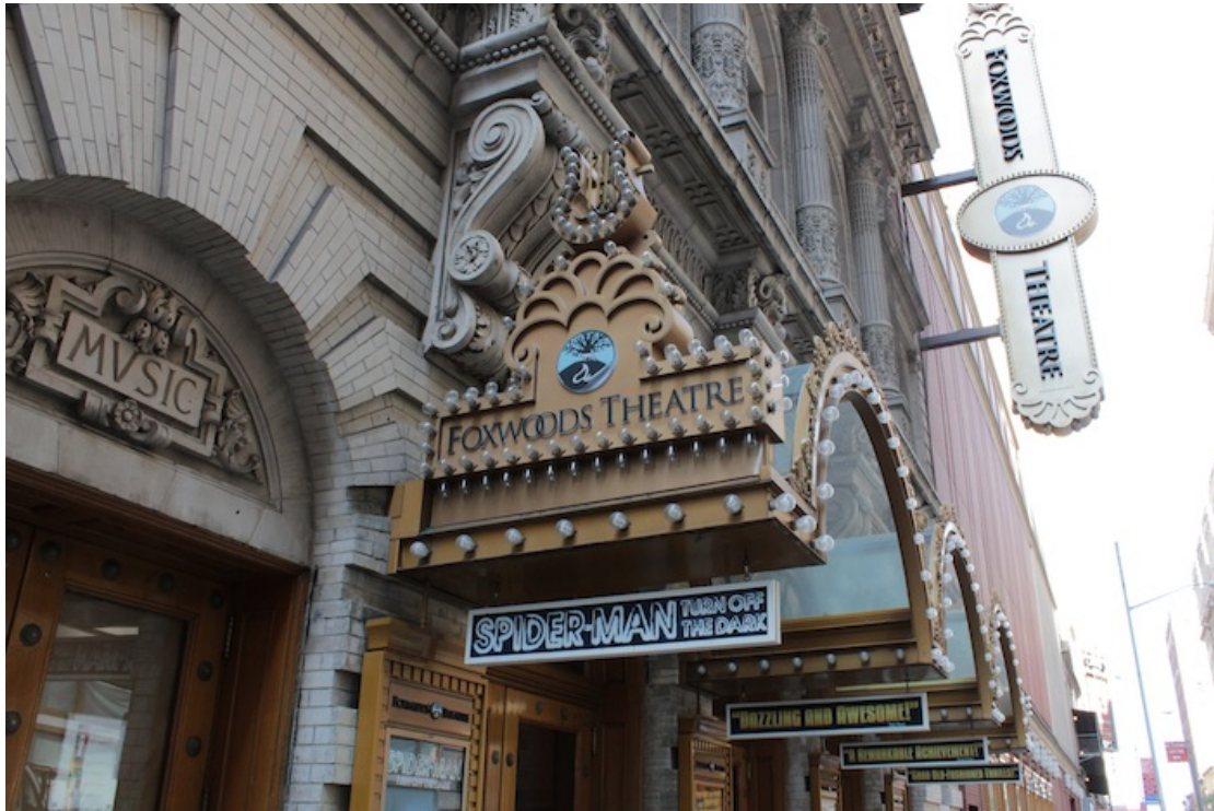
34 – Foxwoods Theatre, home to the highly critically-panned and controversy-plagued Spider-Man: Turn Off The Dark musical.