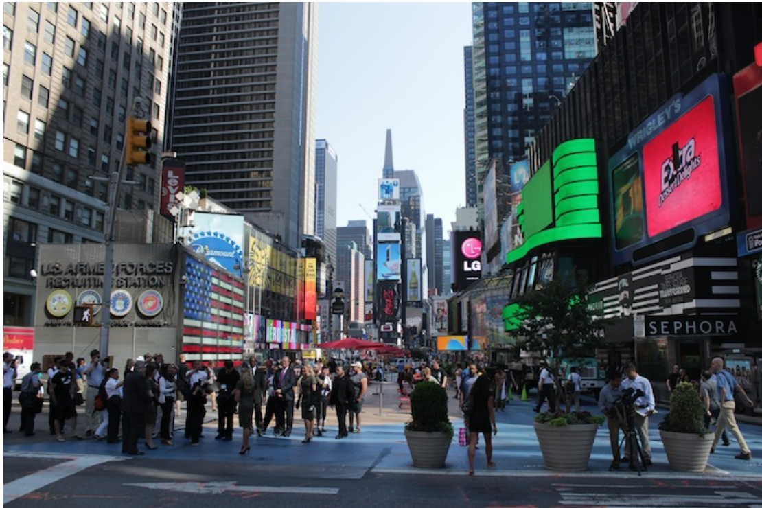
32 – The US Armed Forces Recruitment Station, recruiting here since 1946.