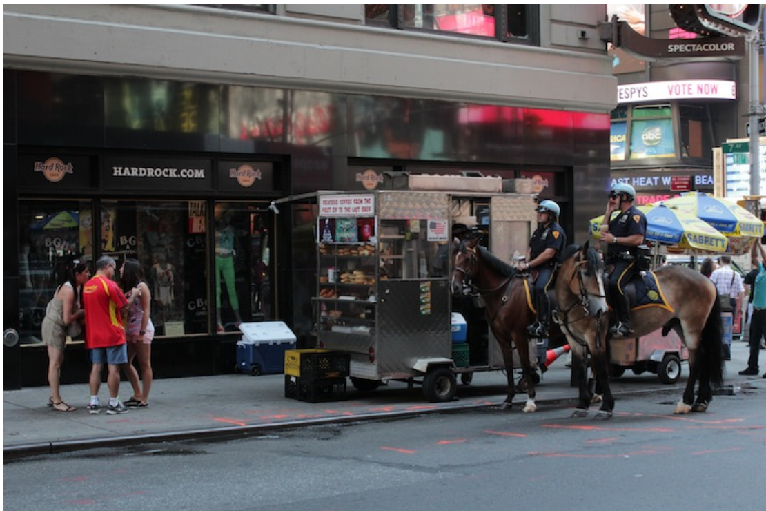
33 – Police officers on horseback, and tourists checking a shot they just took.