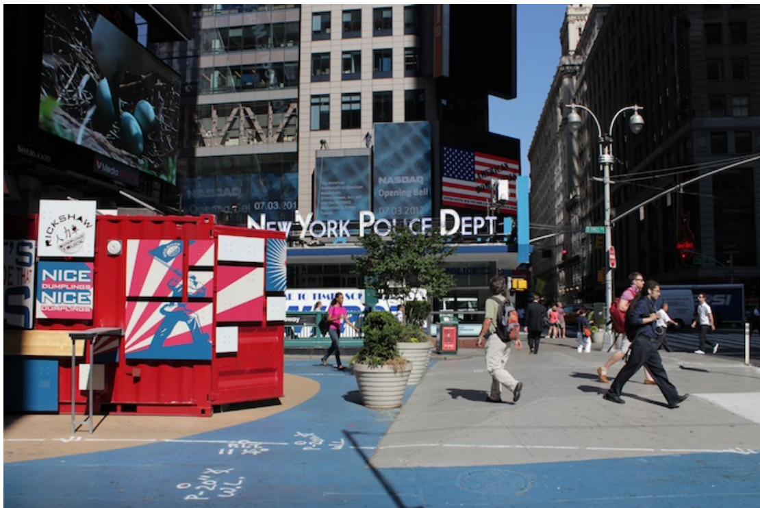
31 – To the left is One Times Square, which housed The New York Times from 1904 - 1913. Times Square is named after The New York Times, and it was the Times that started the tradition of New Year’s Eve on the Square in 1908. Just beyond is 3 Times Square – the Reuters Building.