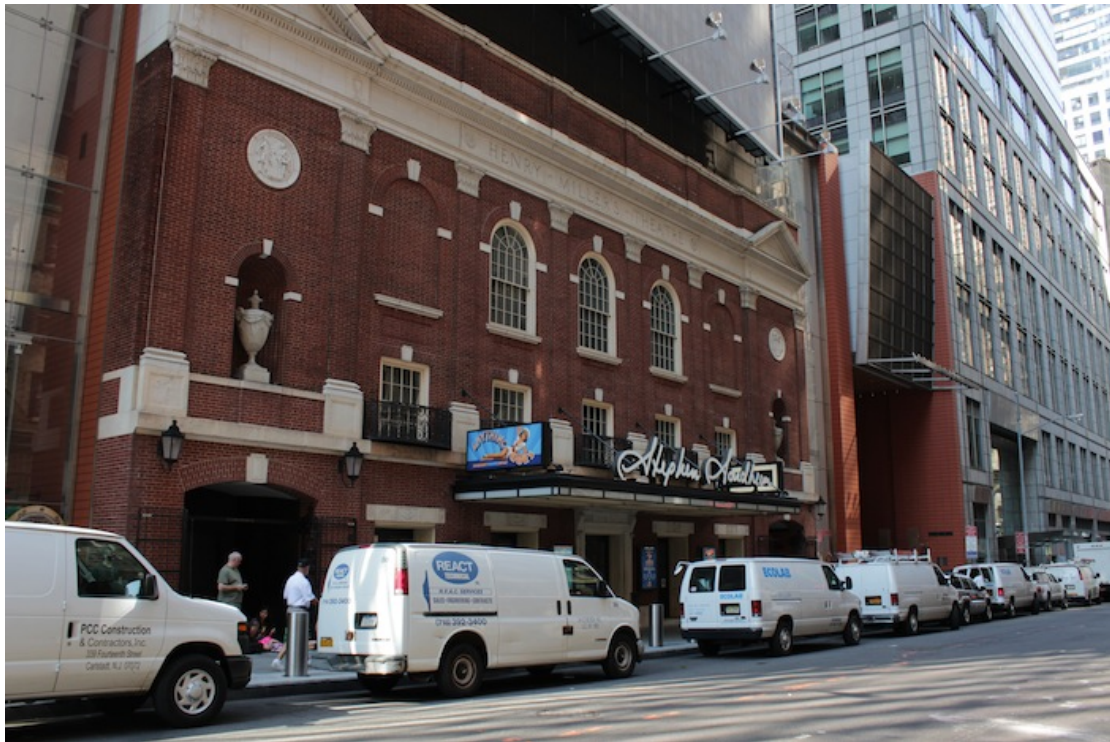
30 – No. 124: Henry Miller’s Theater (1918), now renamed the Stephen Sondheim theater. It was a porno cinema in the ‘80s.