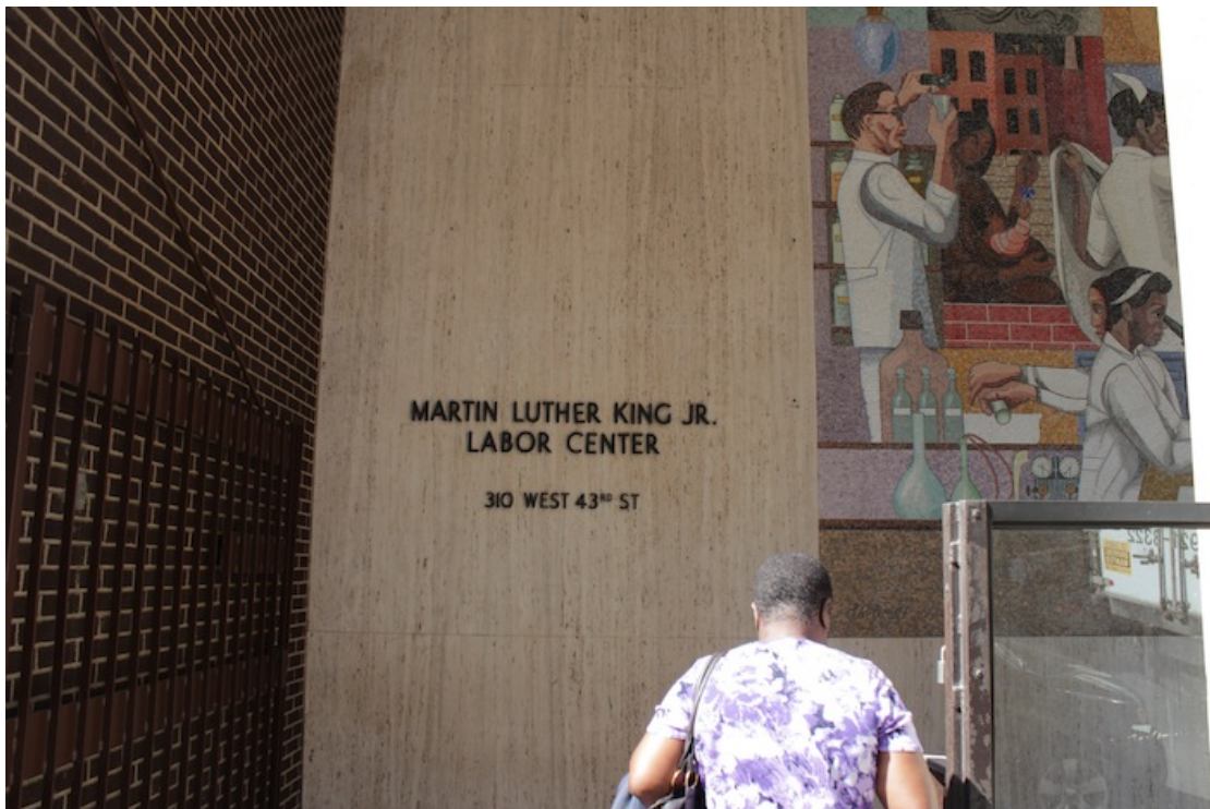
37 – No. 310 – Martin Luther King Jr. Labor Center, with a mural depicting