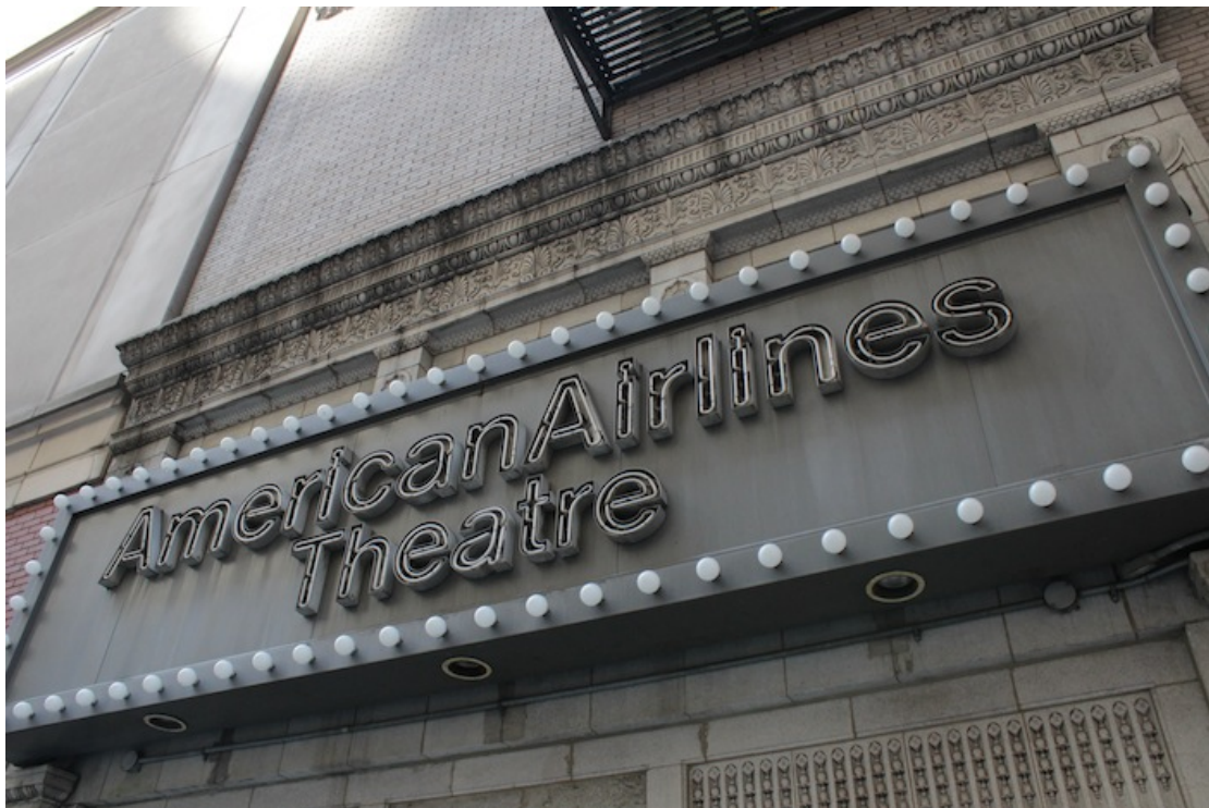
35 – Originally the Selwyn Theatre (1918), now renamed the American Airlines Theatre and housing the Roundabout Theatre Company.