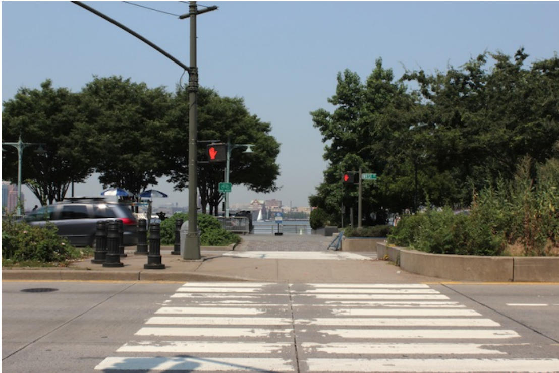
59 – West Street, across which sits the West Bank ( Hudson River Greenway ).