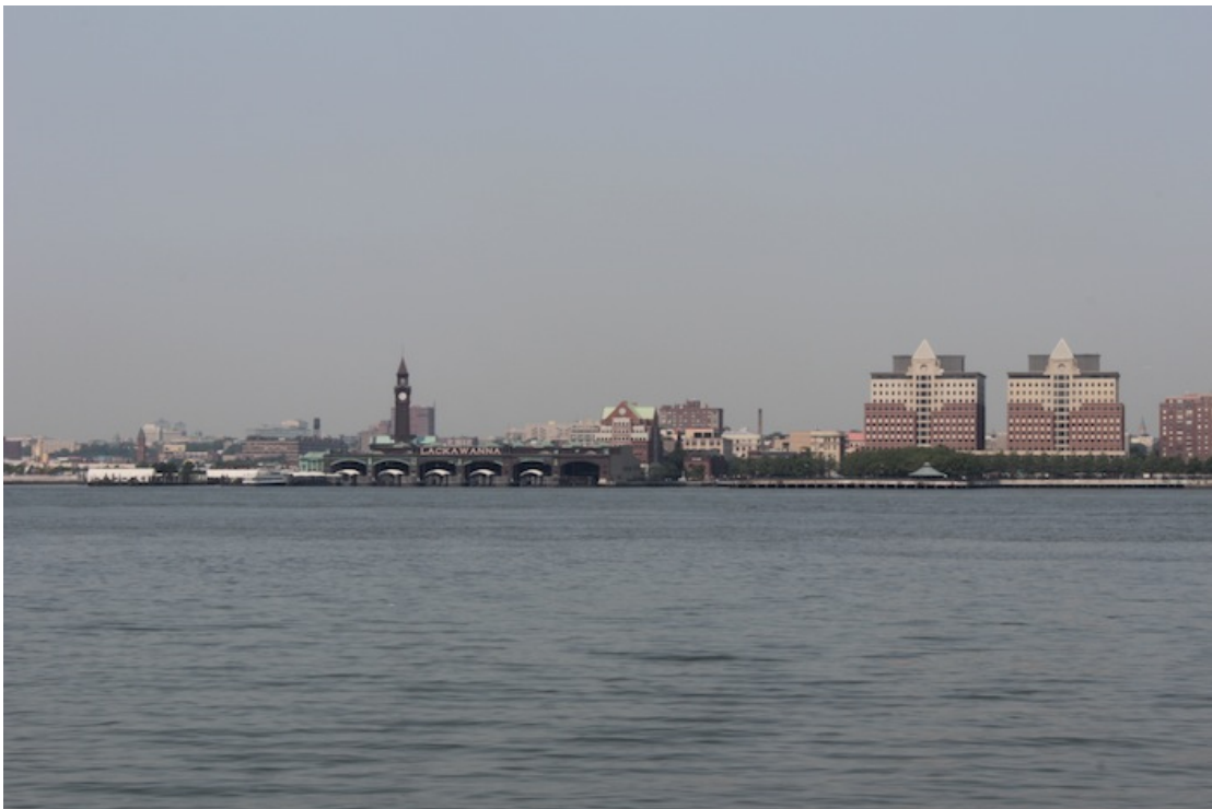
60 – Paradise (New Jersey) sits un-ironically across the water.