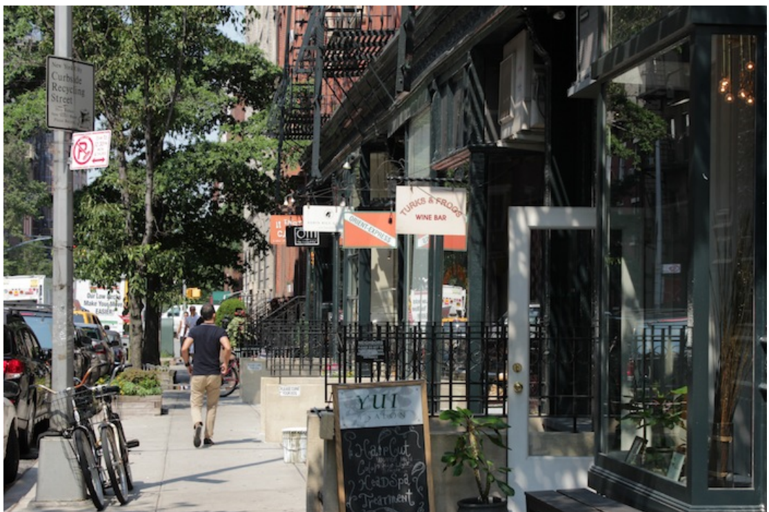
56 – Turks & Frogs and Orient Express , delightful duo of wine bars cum French/Turkish restaurants.