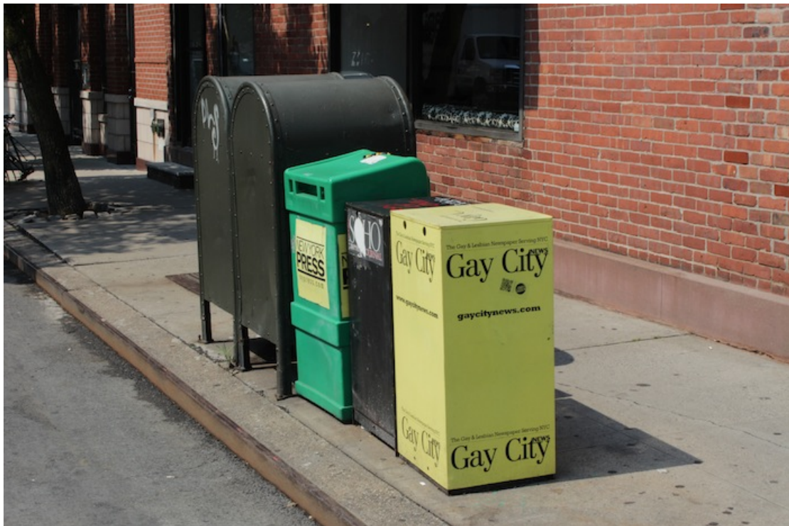
54 – Gay City – a news journal for the city's gay community.