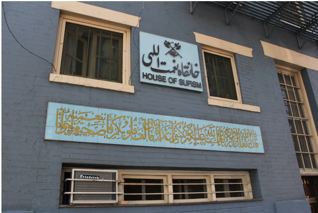
53 – House of Sufism, a khaniqah belonging to the Nimatullahi Sufi Order.