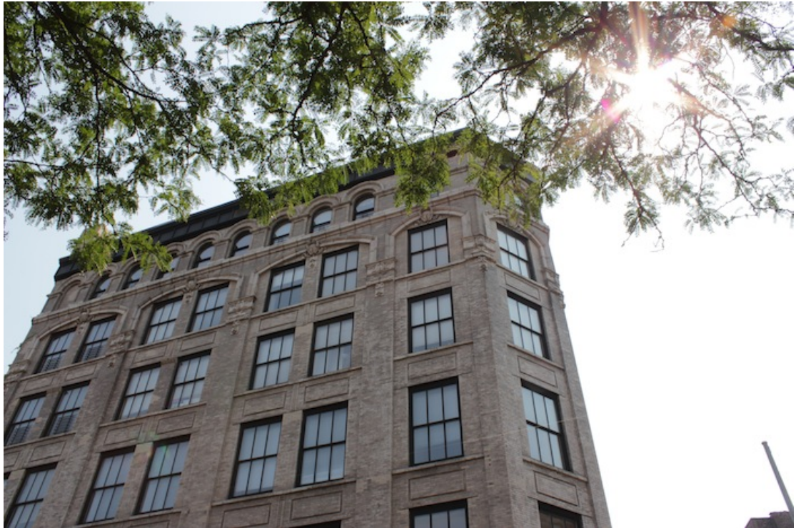
55 – An apartment tower on Washington Street.