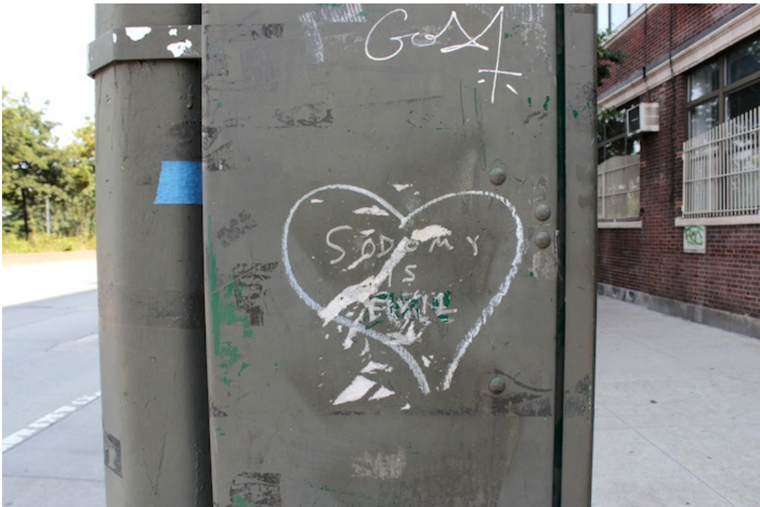
58 – YGA's warning, issued to Lot: Sodomy is Evil .