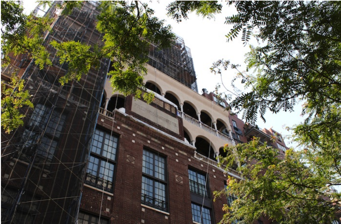
57 – Palazzo Chupi , controversially built by the artist Julian Schnabel on the site of a former stable.