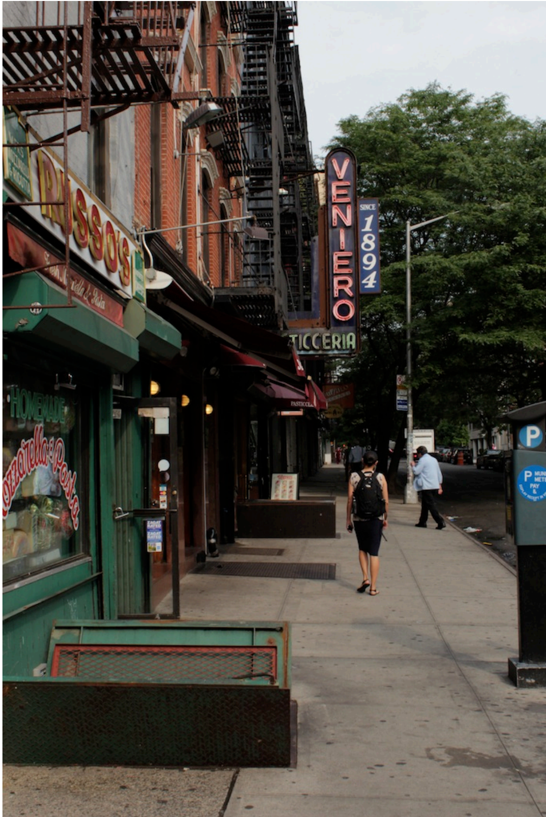
15 – Veniero (1894), once a pool-hall, now a famous pastry house. Beside it is Russo's, a pasta store.