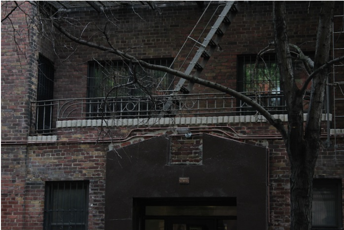
16 – The ghostly façade of No. 305, residential apartments.