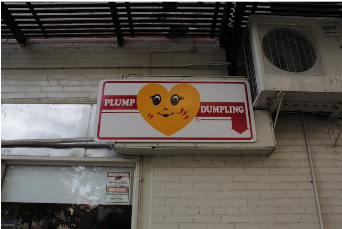
17 – Plump Dumpling , at the north-eastern corner of 2 nd Ave.