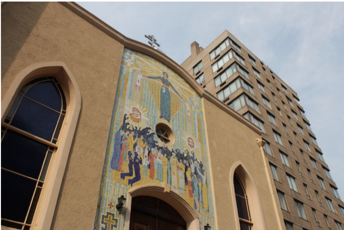
20 – All Saints Ukrainian Orthodox Church , with its beautiful mosaic of Christ Resurrected.