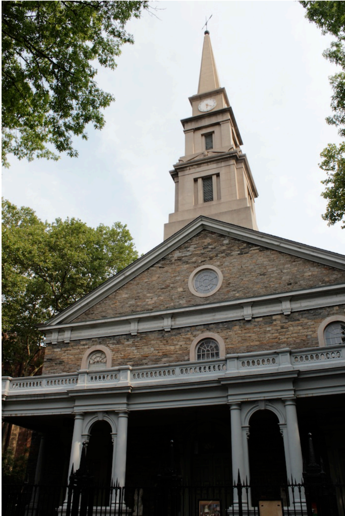
18 – The Church of St. Marks of the Bowery , first erected in 1795, and completed in its present form in 1854. The church is progressive, having supported immigrant rights, labor movements and civil rights for African- and gay Americans in its time.