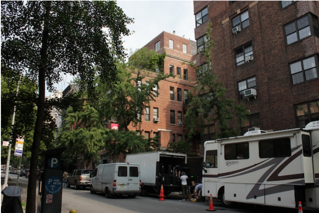
19 – The Third Street Music School Settlement , the nation’s oldest community music school, channeling Nebuchadnezzar’s Hanging Gardens of Babylon.