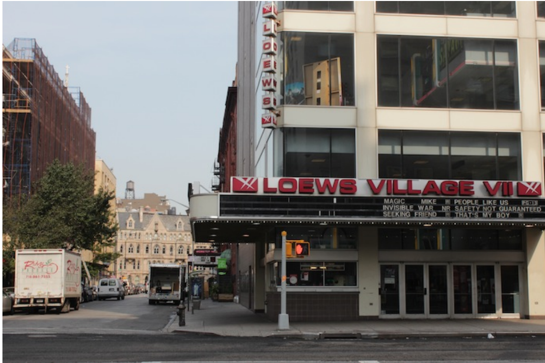
21 – AMC Loews Village VII Cinemas.