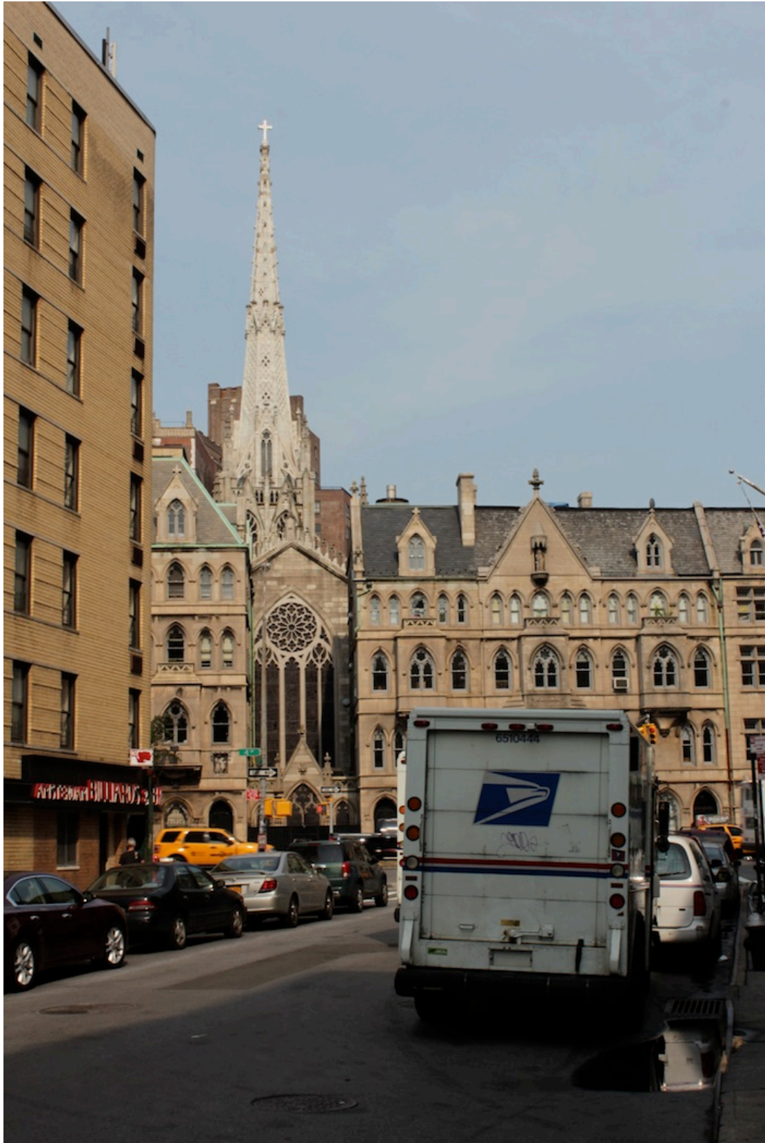
23 – The imposing edifice of Grace Church and Grace Memorial Hall on 4 th Avenue, cutting off 11 th Street from itself.