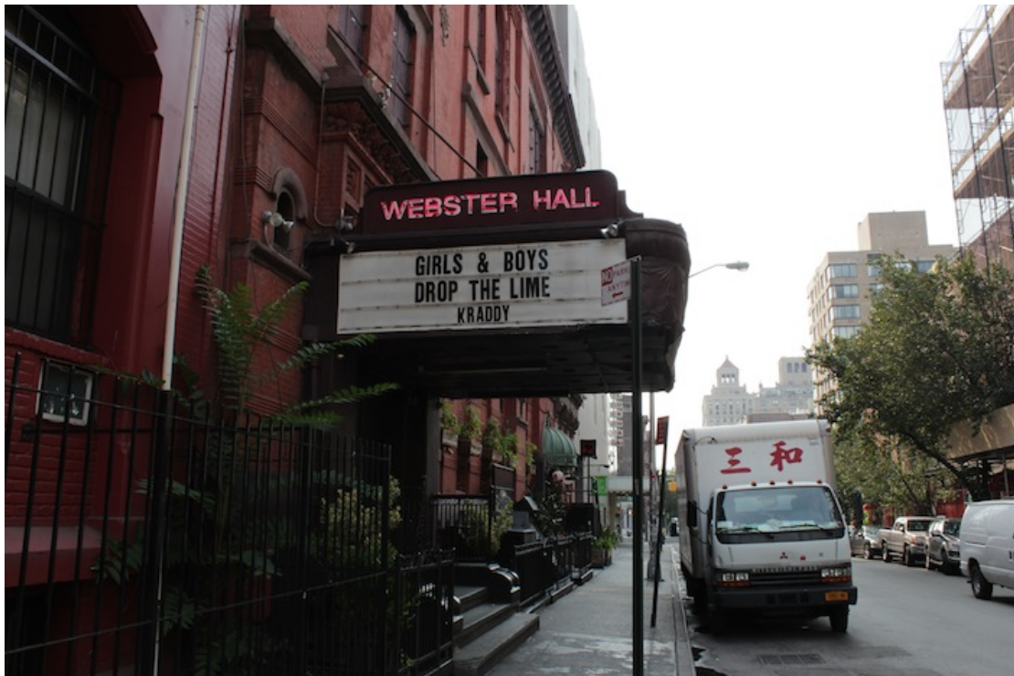
22 – Webster Hall (1863), also known as “The Devil’s Playground” in the early 1900s, due to its being a venue for wild bohemian parties with nudity and free love. Continuing in that satirical vein, it’s now a nightclub.