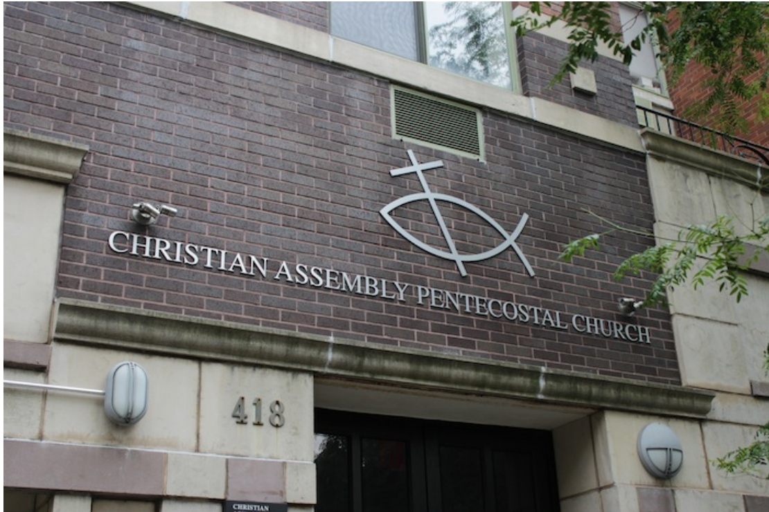
11 – No. 418: Christian Assembly Pentecostal Church.