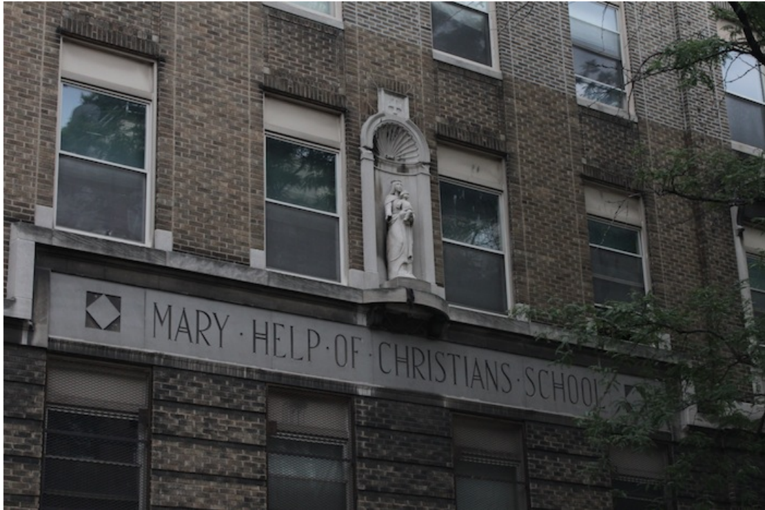
9 – Mary, Help of Christians, the official Patron Saint of New York. The Building, a Catholic School, was built in 1925.