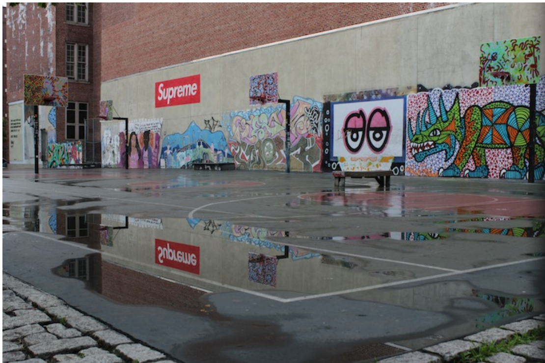
12 – The basketball Court of the Eastside Community Junior High School.