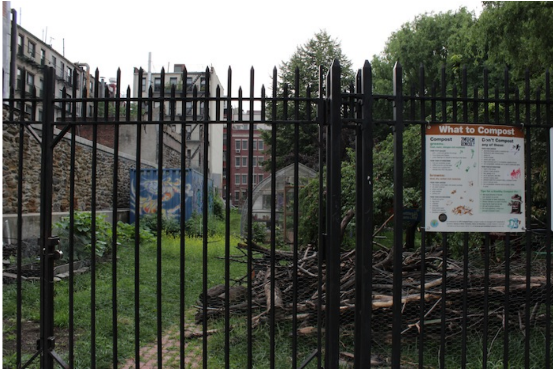
13 – LES Park - A former bus depot transformed into a community garden by the East Side Community JHS 60 alumni; the third garden.