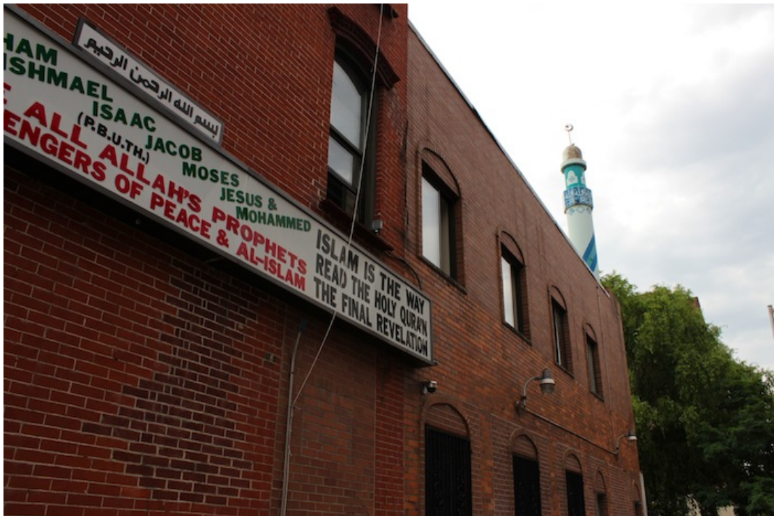
14 – The Lower Manhattan Mosque , founded in 1976. Also houses the Islamic Council of America. It has adorned with a single minaret in the Persian style.