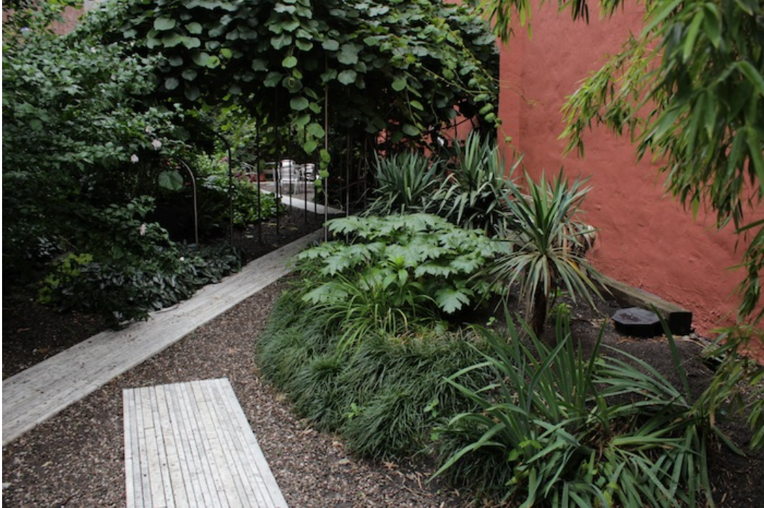
6 – East 11 th Street Garden , the first of the three gardens.