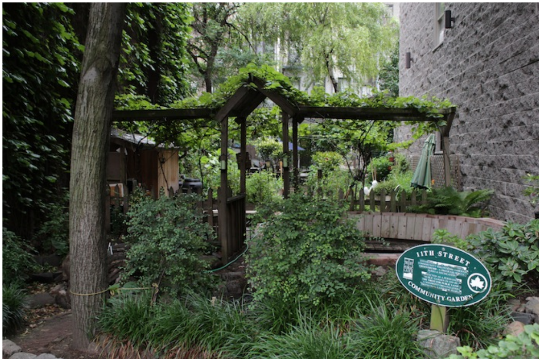
10 – 11 th Street Community Garden, the second of the three gardens.