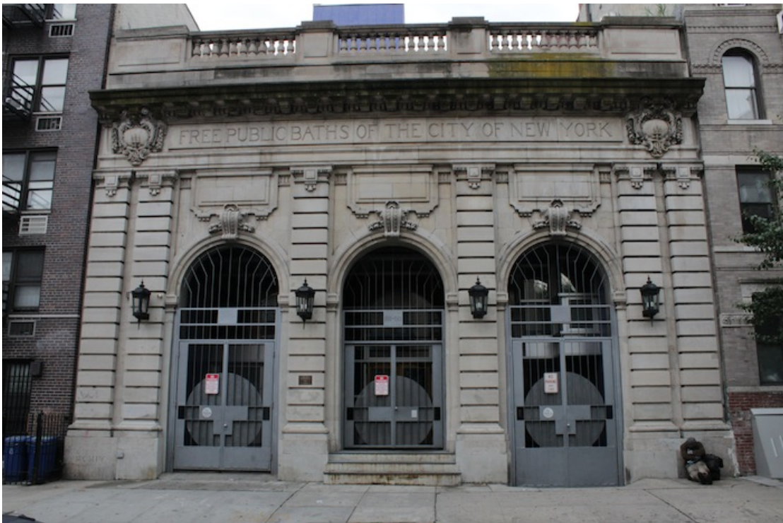
7 – The Free Public Baths of New York City : once a literal oasis, now apparently a photography studio.