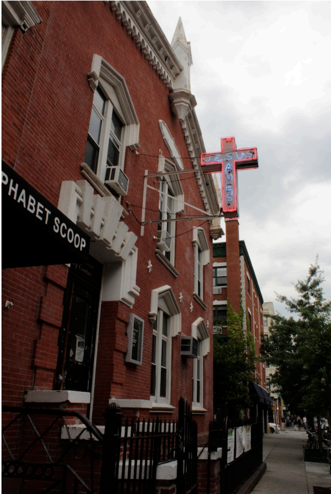
8 - Father's Heart Ministry Center (1868), once Russian Baptist, but now Evangelical.