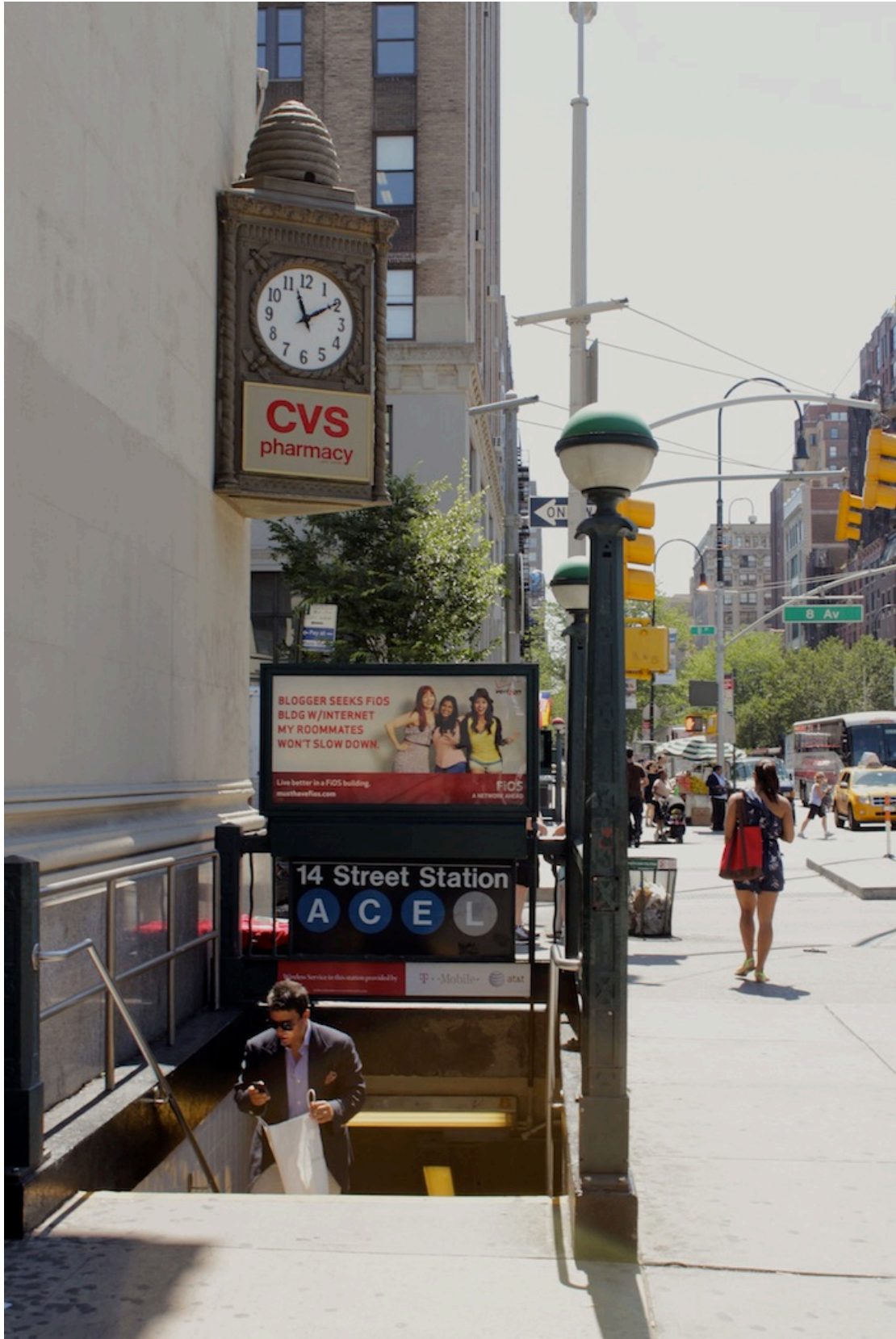
38 – 8 th Ave L Train Station, by the New York Savings Bank Building (1896), now housing CVS Pharmacy. This marks the start of central Chelsea.