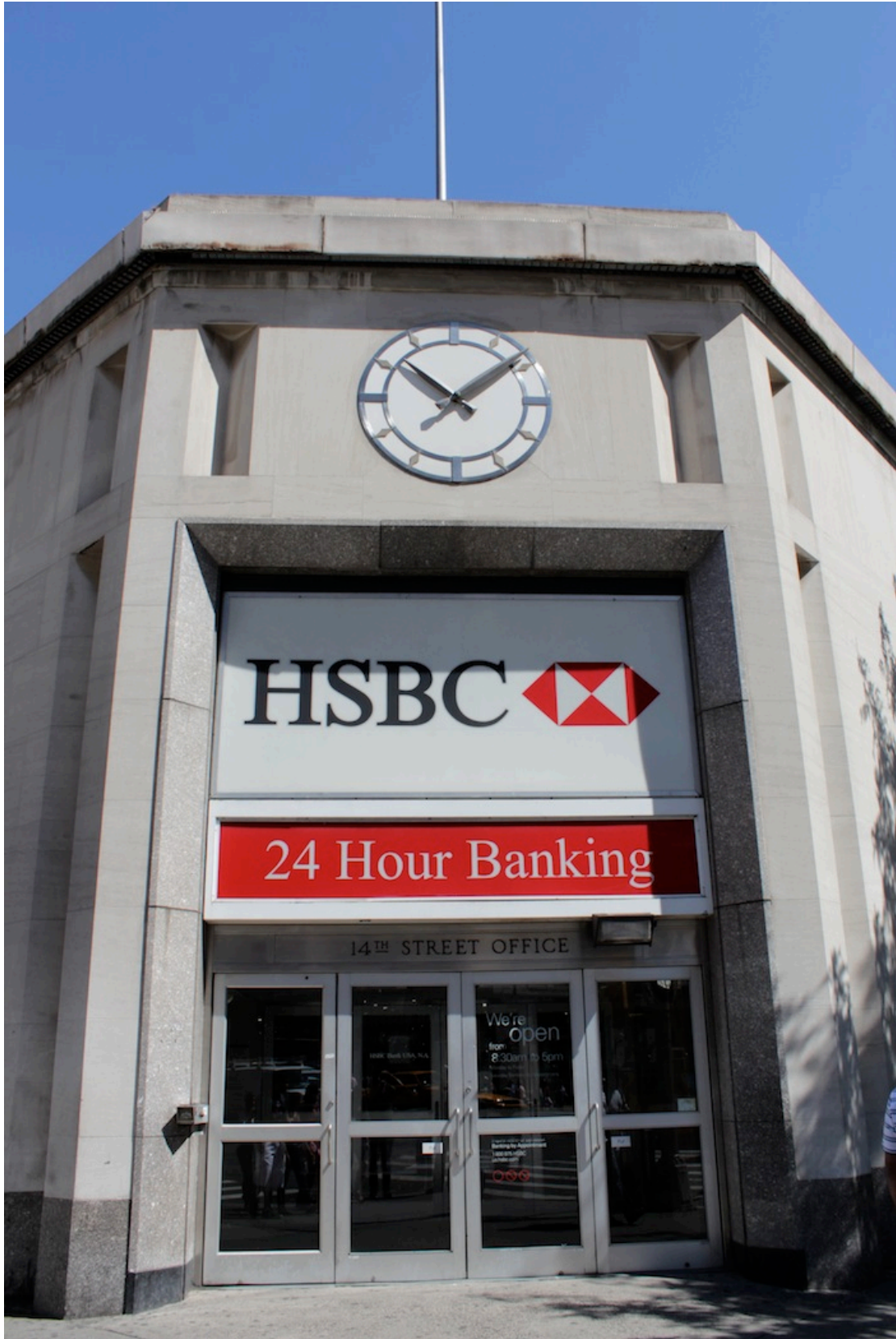
33 – The Art Deco façade of the HSBC 14 th Street Office, on the junction of 6 th Ave, marking the start of outer Chelsea.