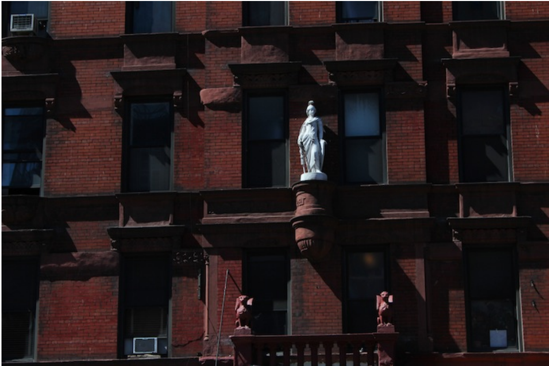
36 – A statue of Joan of Arc, presiding over a building named after her - the Jeanne d'Arc apartments (1888).