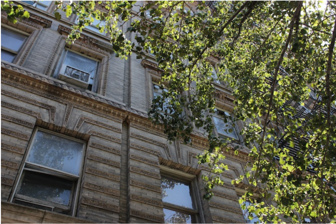
41 – No. 335/337 – Neo-Grecian apartments (circa 1900).