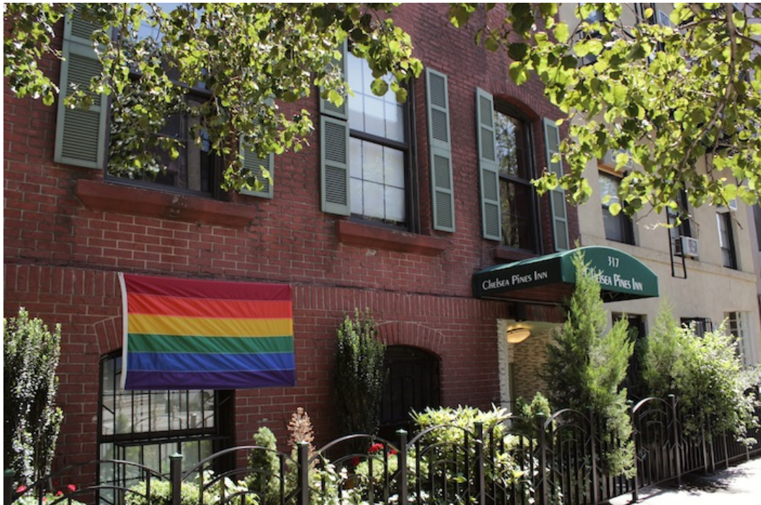
40 – No. 317: Chelsea Pines Inn, named after the notorious Fire Island resort for gay men.