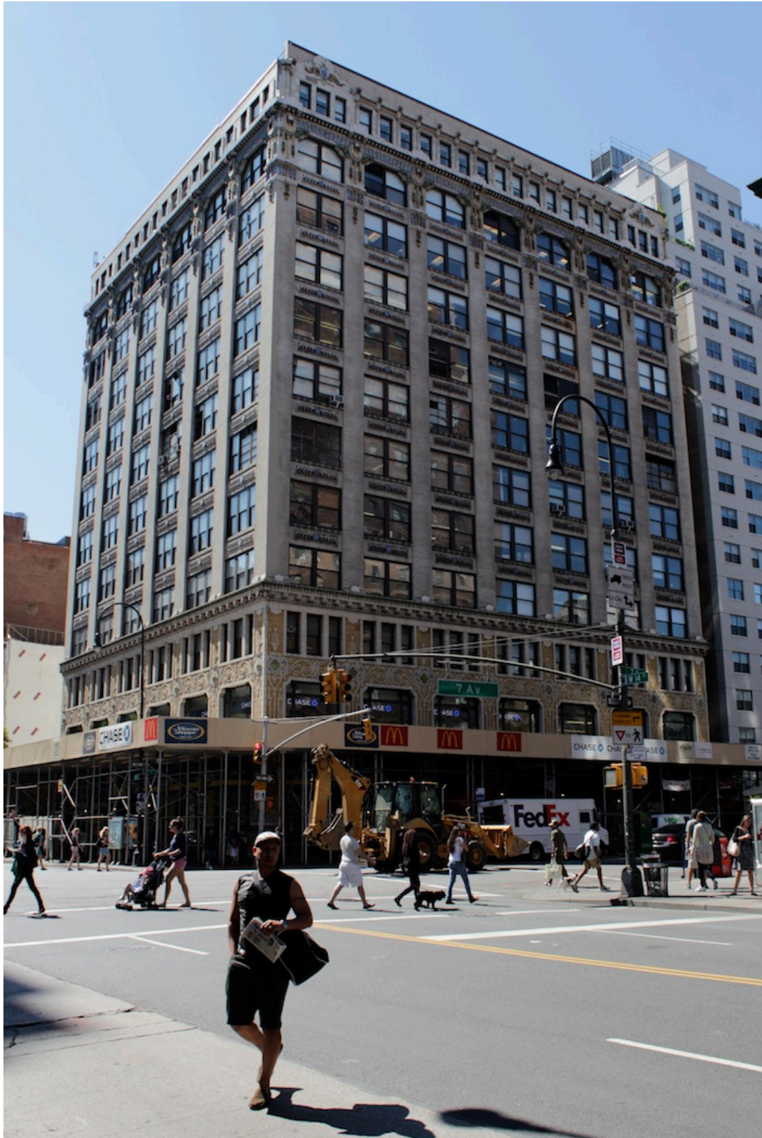
35 – 7 th Ave Intersection: 1912 loft building by Herman Lee Meader, with exquisite terracotta detailing, framing a fashionable, gym-toned silhouette.