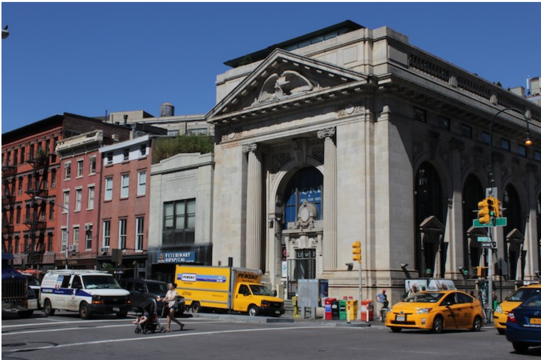
37 – 8 th Ave Intersection: 1907 Neo-classical building constructed for the New York County National Bank. Now houses the Nickel Spa for Men.