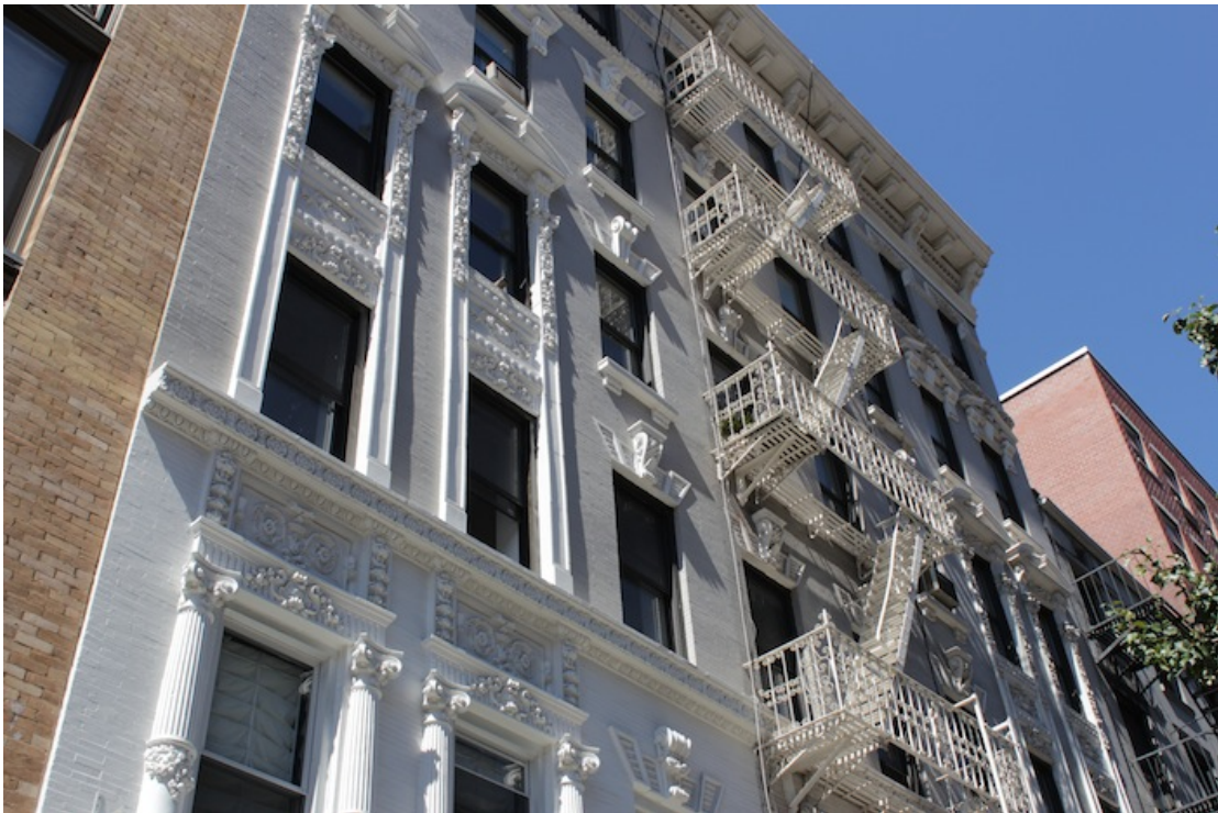
42 – No. 344 / 346: Elegant tenements with Grecian Details (circa 1910).