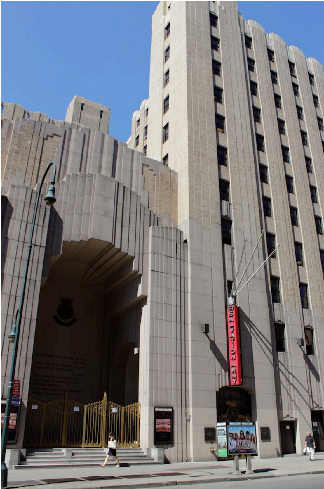
34 – No. 120: The Centennial Memorial Temple, built for the Salvation Army in 1930 as their national headquarters. Yet another beautiful Art Deco building, given over to benevolent and charitable purposes.