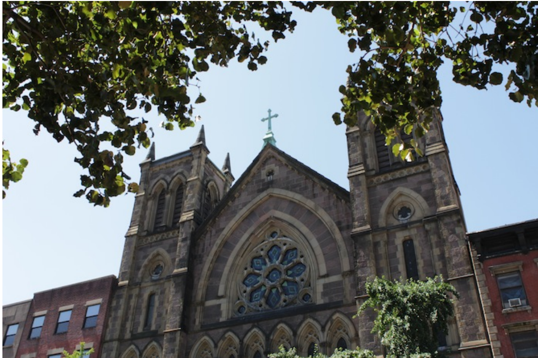
39 – No. 330: Our Lady of Guadalupe at St. Bernard's (1875).