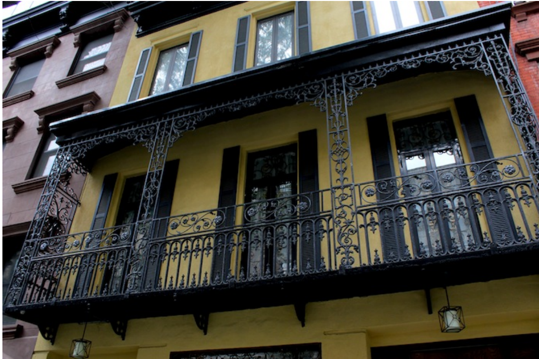
41 – No. 138: Stunning French-New Orleans flourishes.