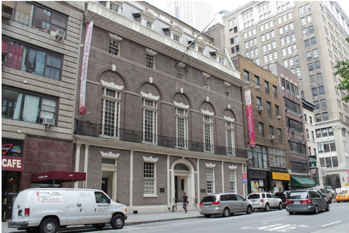
33 – The American Academy of Dramatic Arts , housed in the original Colony Club building (1904) designed by architect Stanford White. The Colony Club was a private social club for wealthy women.