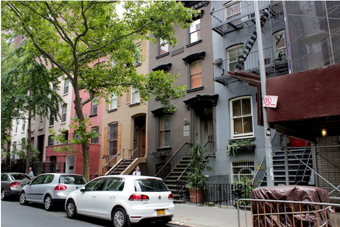
43 – Nos. 210 – 198: a further row of residential townhouses. No. 208 is the Polish Institute of Arts and Sciences .