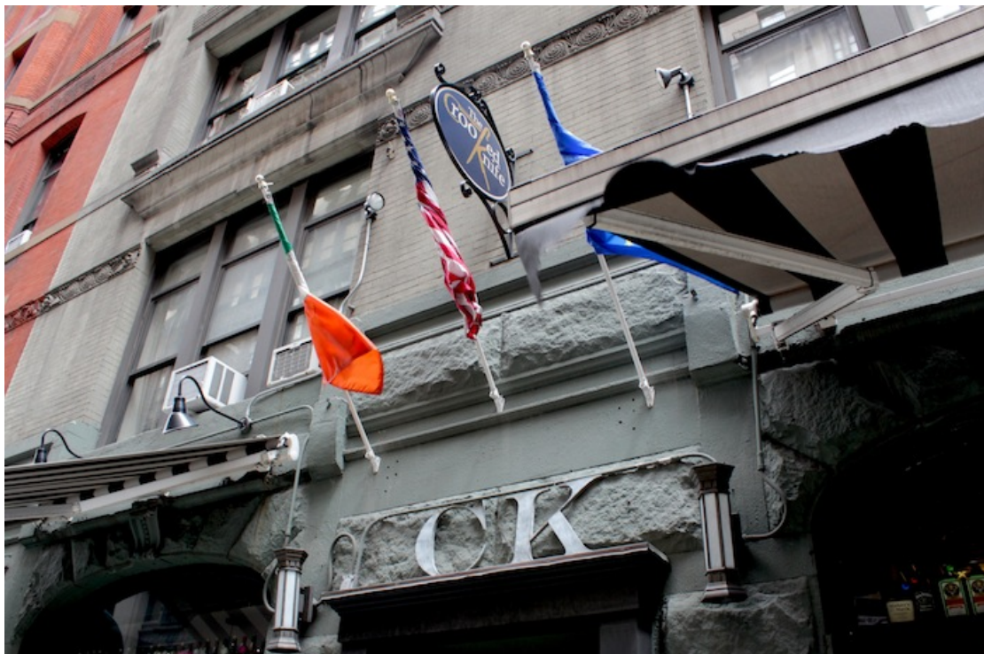
34 – The Crooked Knife : an English-style Pub and Tavern serving Italian food.