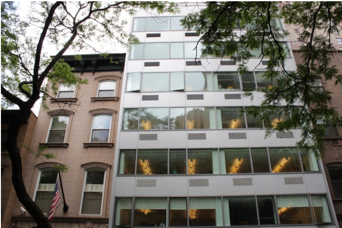
36 – No. 112: The modern, steel and glass façade of the Jewish Braille institute of America .