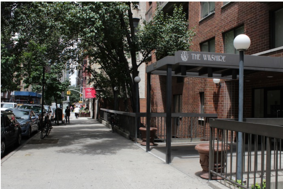
44 – No. 207: The Wilshire Apartments .