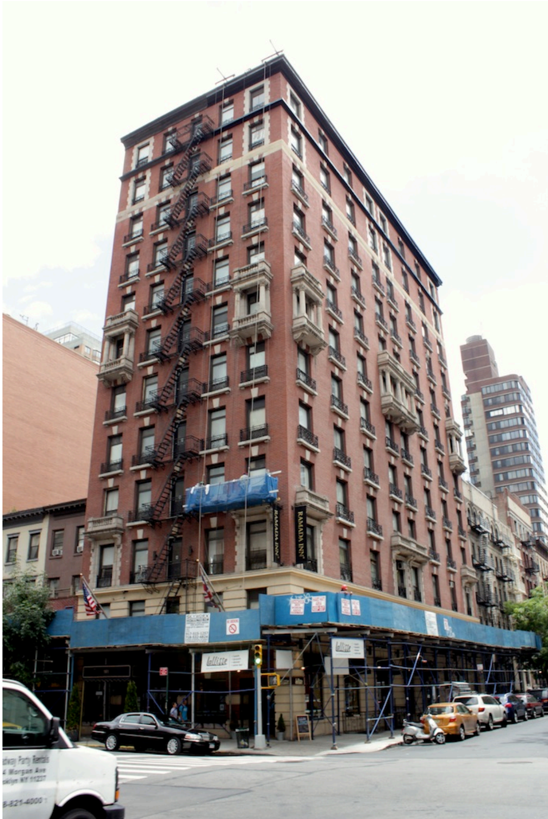
40 – Ramada Inn , originally the Rutledge Hotel (1924). The building has Italianate flourishes, and channels similar tenement buildings in Boston.