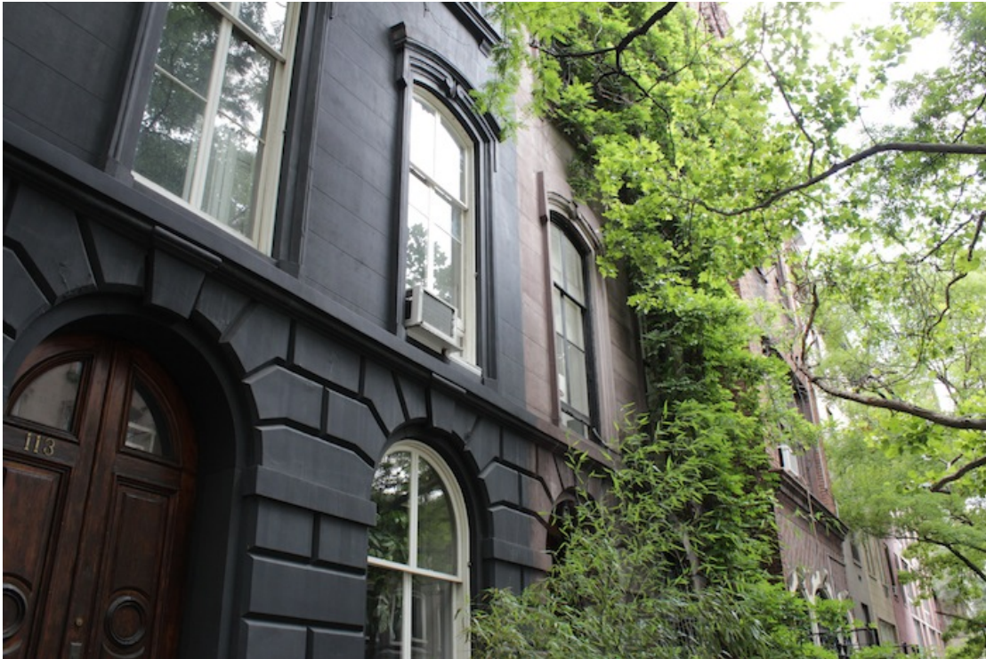
35 – No. 113: a stately black townhouse in the colonial style.