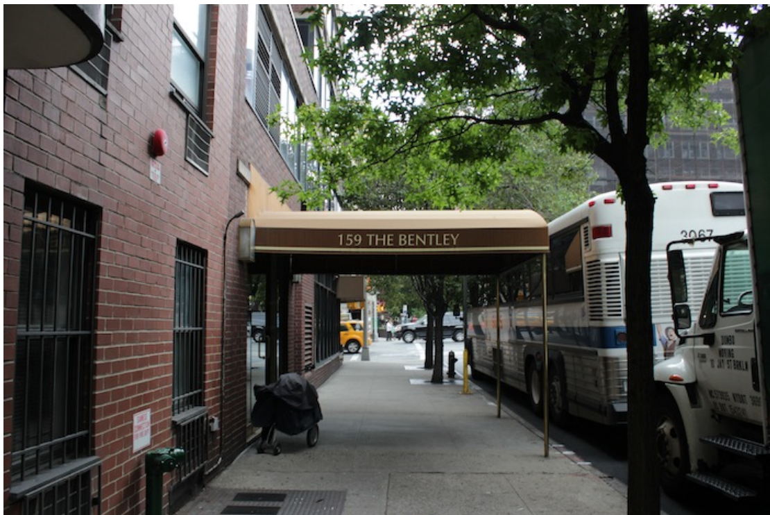
42 – No. 159: The Bentley Apartments.