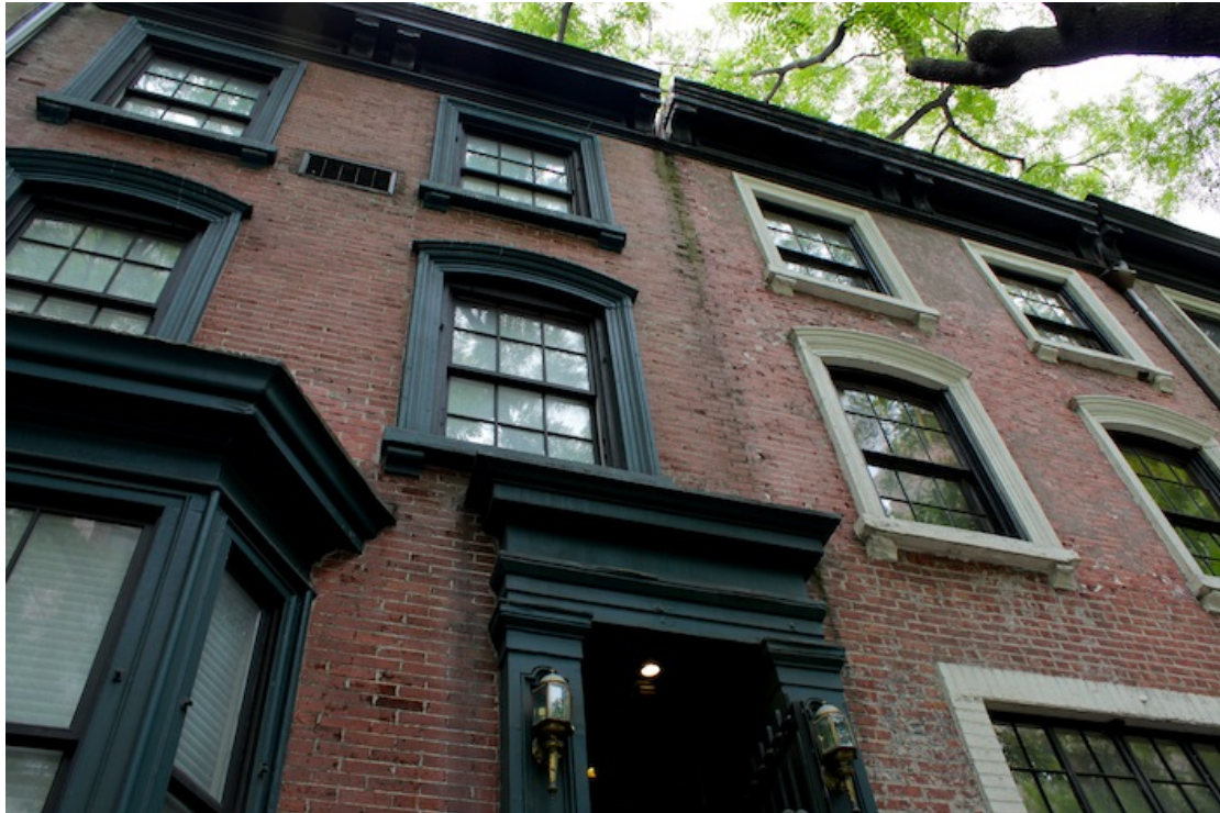
38 – No. 124: A red brick townhouse with green awnings.