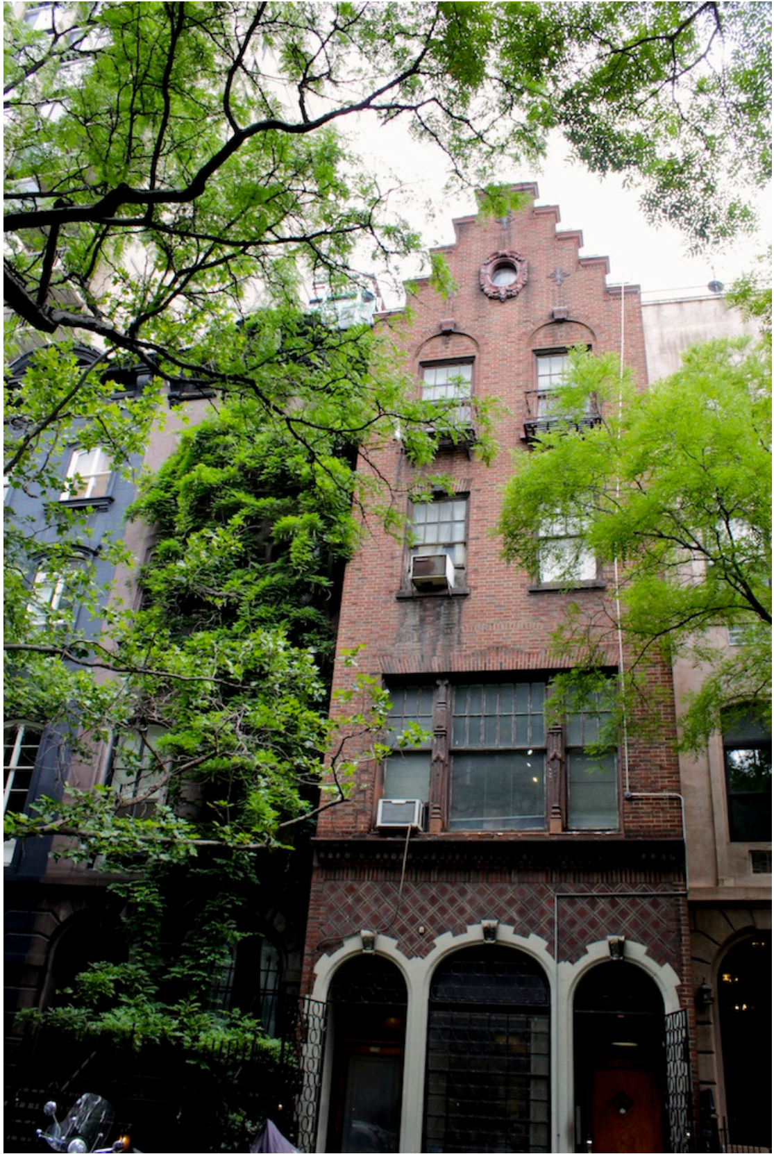
37 – No. 117: Dutch-inspired gabled roof.