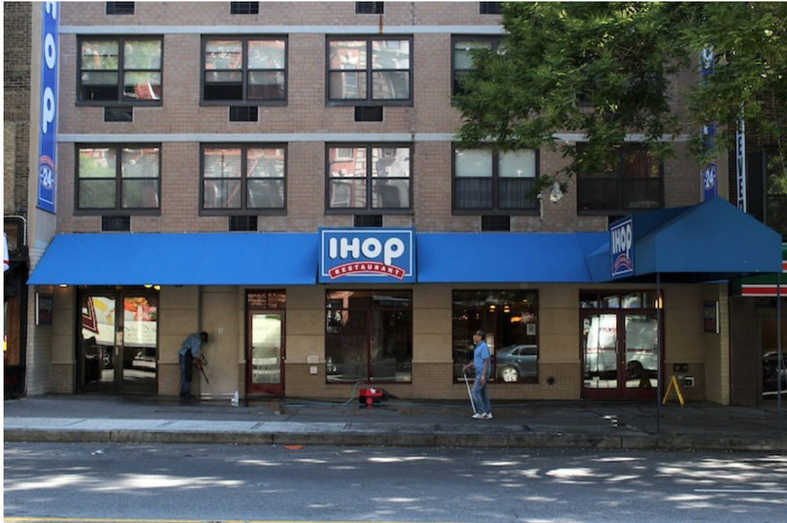
19 – International House of Pancakes.