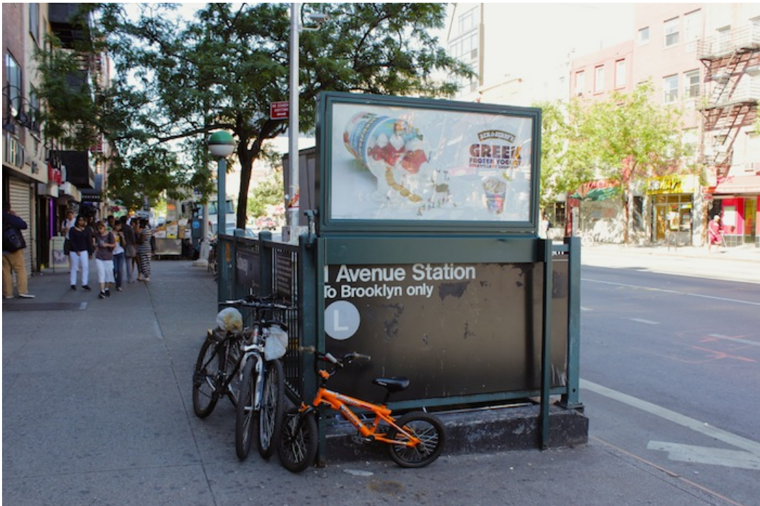
14 – The 1 st Ave Subway Station, the Western-most station on 14 th Street, contributes to the throng of commuters here.