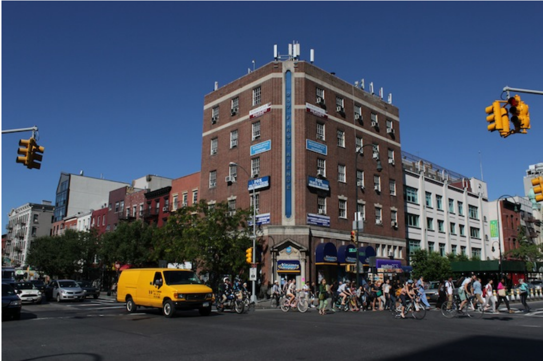
13 – You know you have left Alphabet City when you reach the Junction of 1 st Avenue, thronged with people, cyclists and cars.