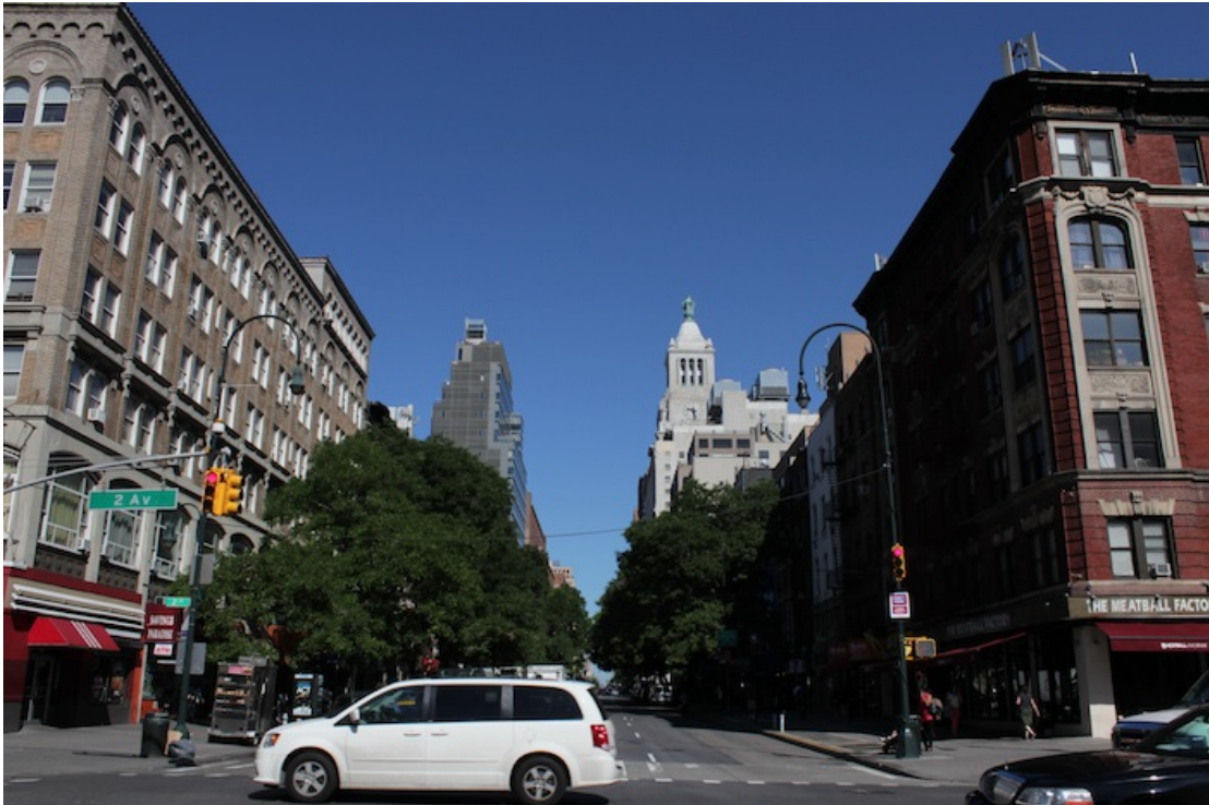
17 – The 2 nd Avenue intersection, beyond which you see the gleaming towers of Big Capital and Big Energy at and beyond 3 rd Avenue.