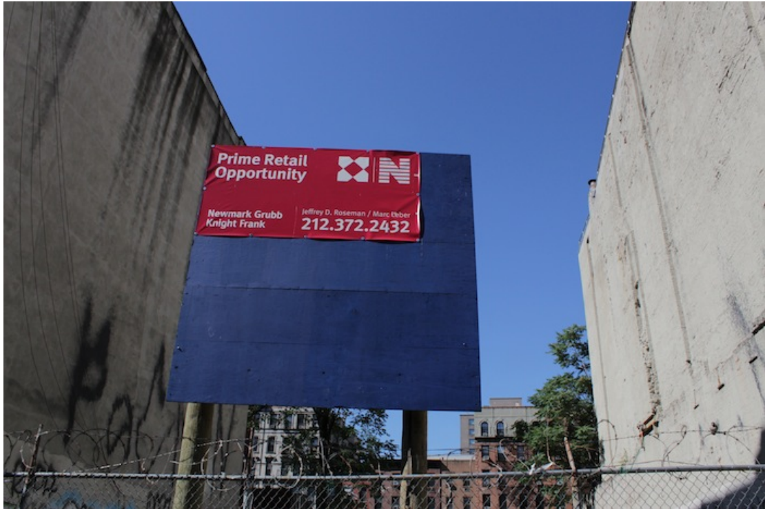
21 – The machinations of Real Estate – a fact of everyday life in New York.