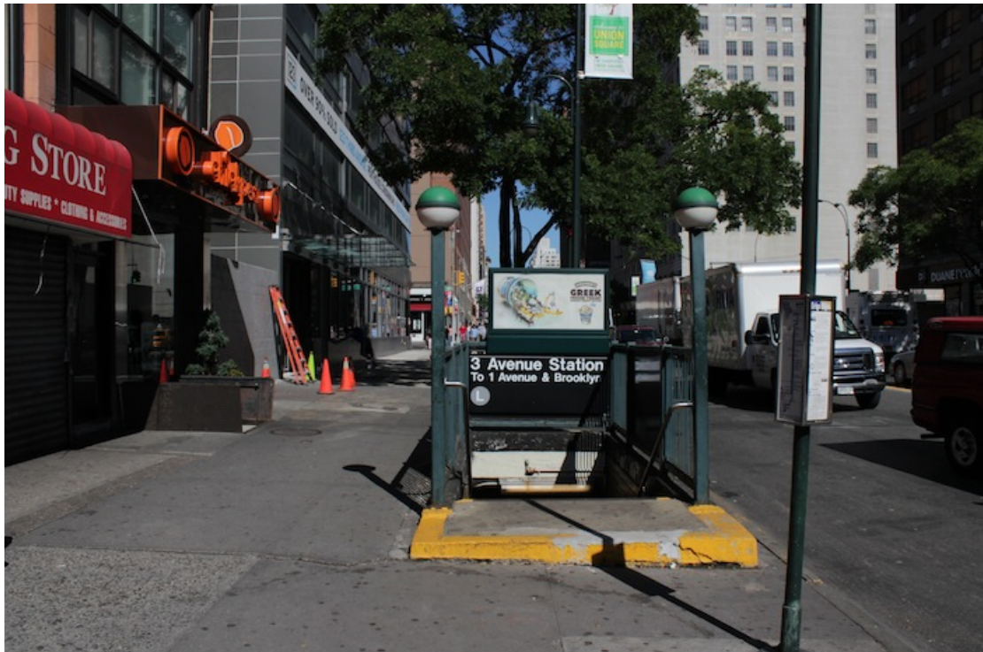
22 – The 3 rd Avenue Subway Station.