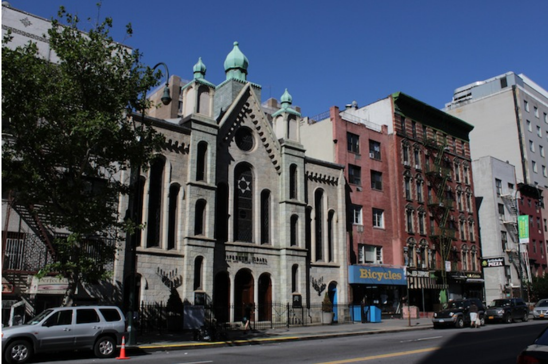
15 – Tifereth Israel Town and Village Conservative Synagogue. It was built to cater to Stuyvesant Town and the adjoining Peter Cooper Village. Built in 1866 as a church, it finally became a synagogue in 1962.