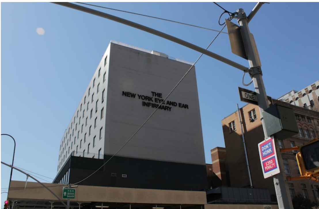
18 – The New York Eye and Ear Infirmary, established 1820 as the oldest specialist medical institution in America.