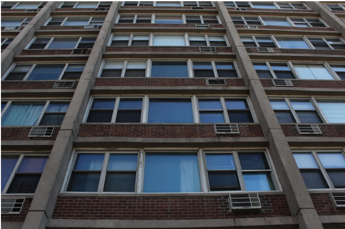
16 – The endlessly replicating façade of the 14 th Street Y (i.e. YMCA and YWHA), known formerly as the Sol Goldman YM – YWHA.