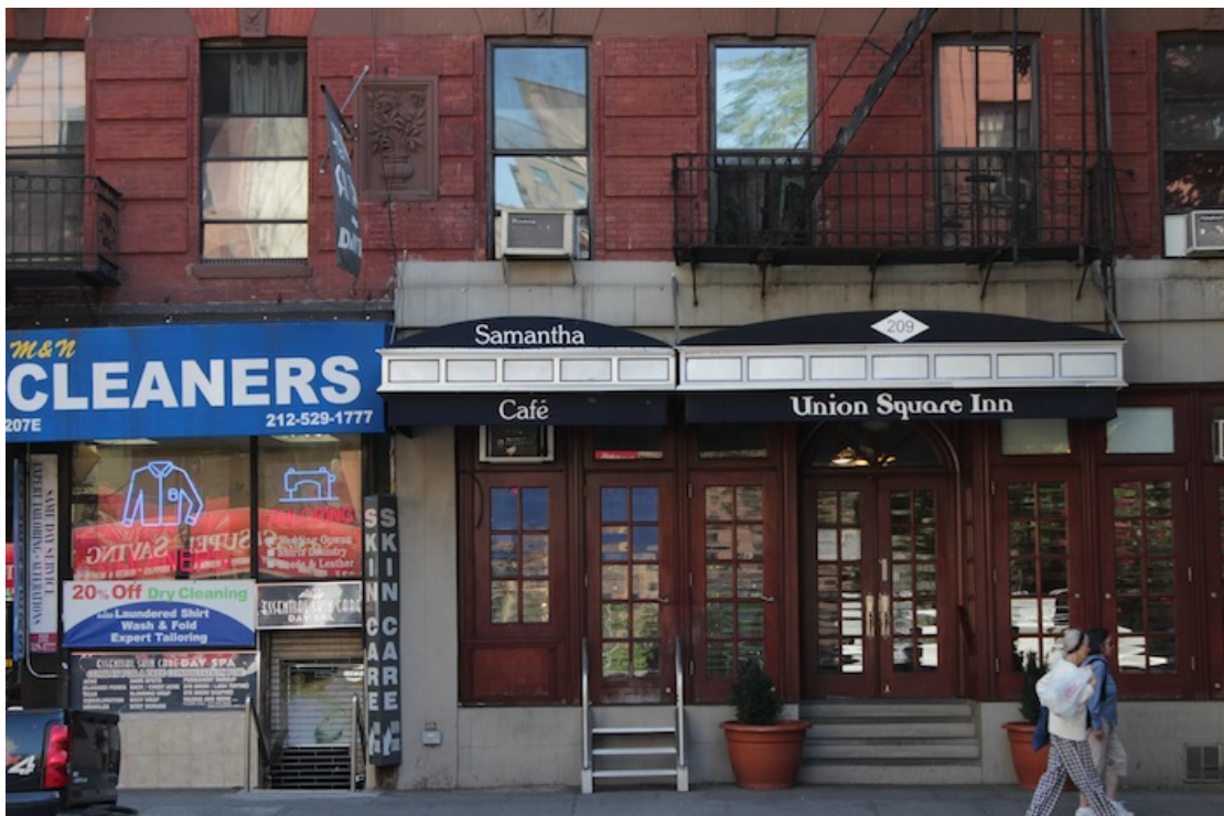
20 – Everyday splendour: places to eat, sleep and wash your clothes in.