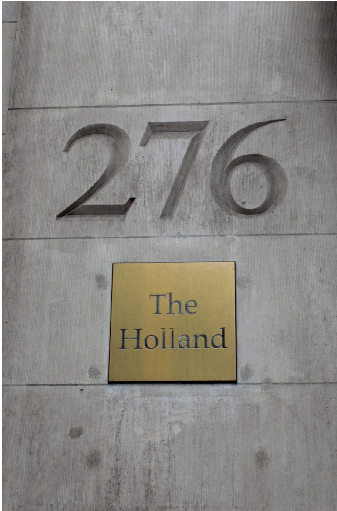
29 – No. 276 5 th Avenue: The Holland Building (1891), one of the most luxurious hotels in the world when it was built.