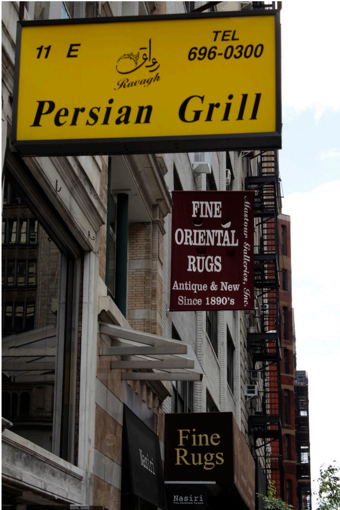
31 – The Persian Village, selling rugs and fine Persian cuisine.