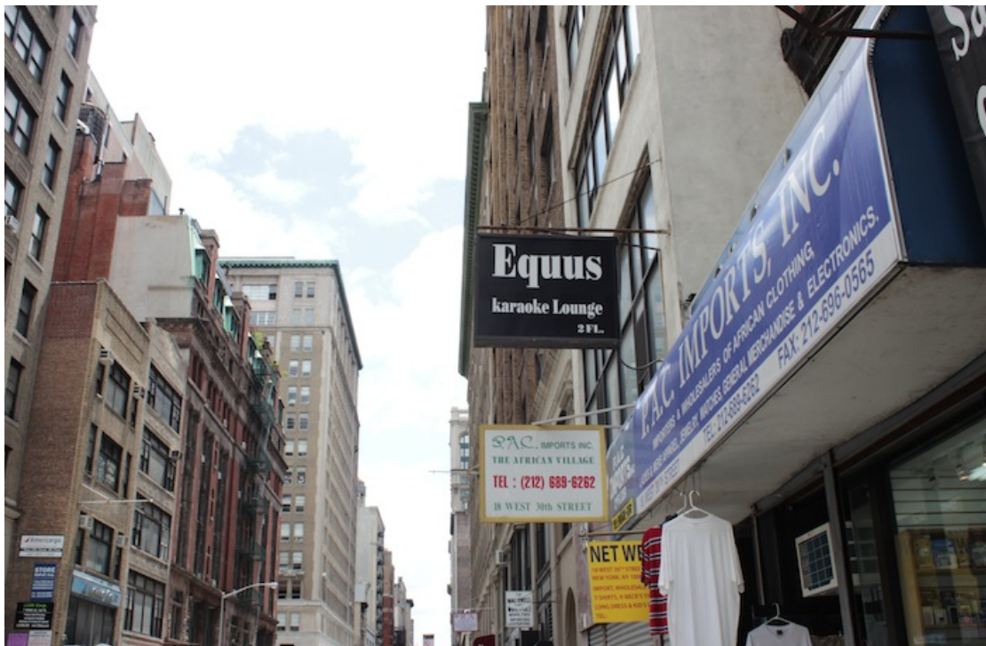
25 – The African Village