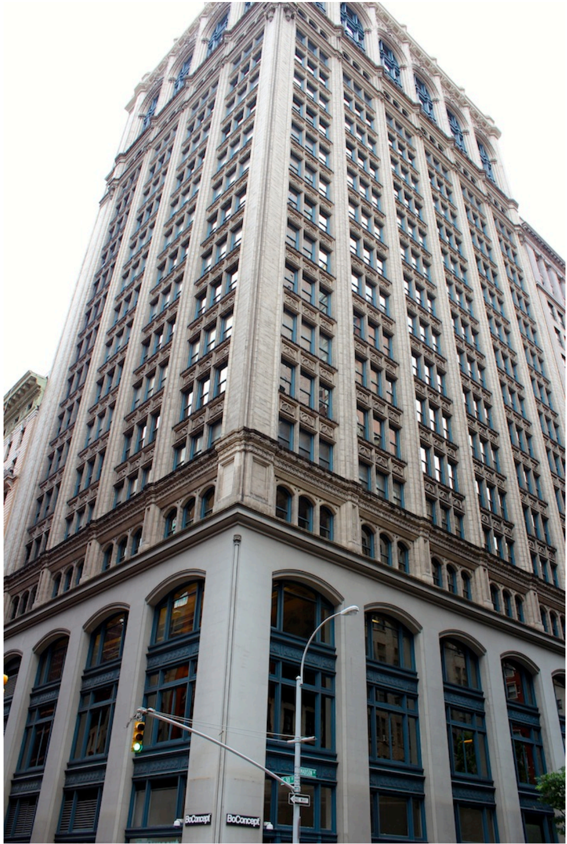
32 – Gorgeous cast-iron clad skyscraper marks the eastern limits of Babel.