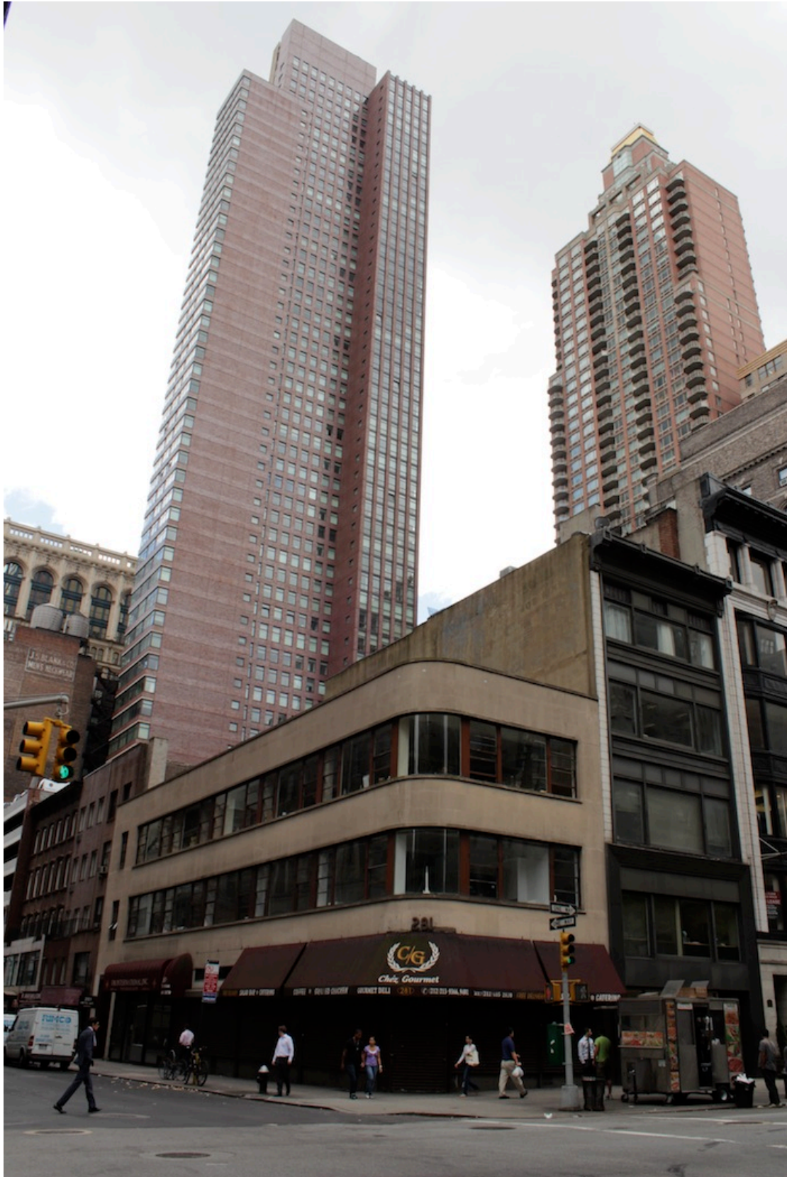
30 – More Babel-like towers towering over a derelict French Gourmet deli.