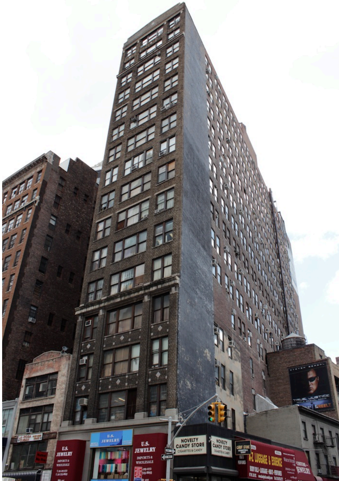
23 – Channeling the Tower of Babel.