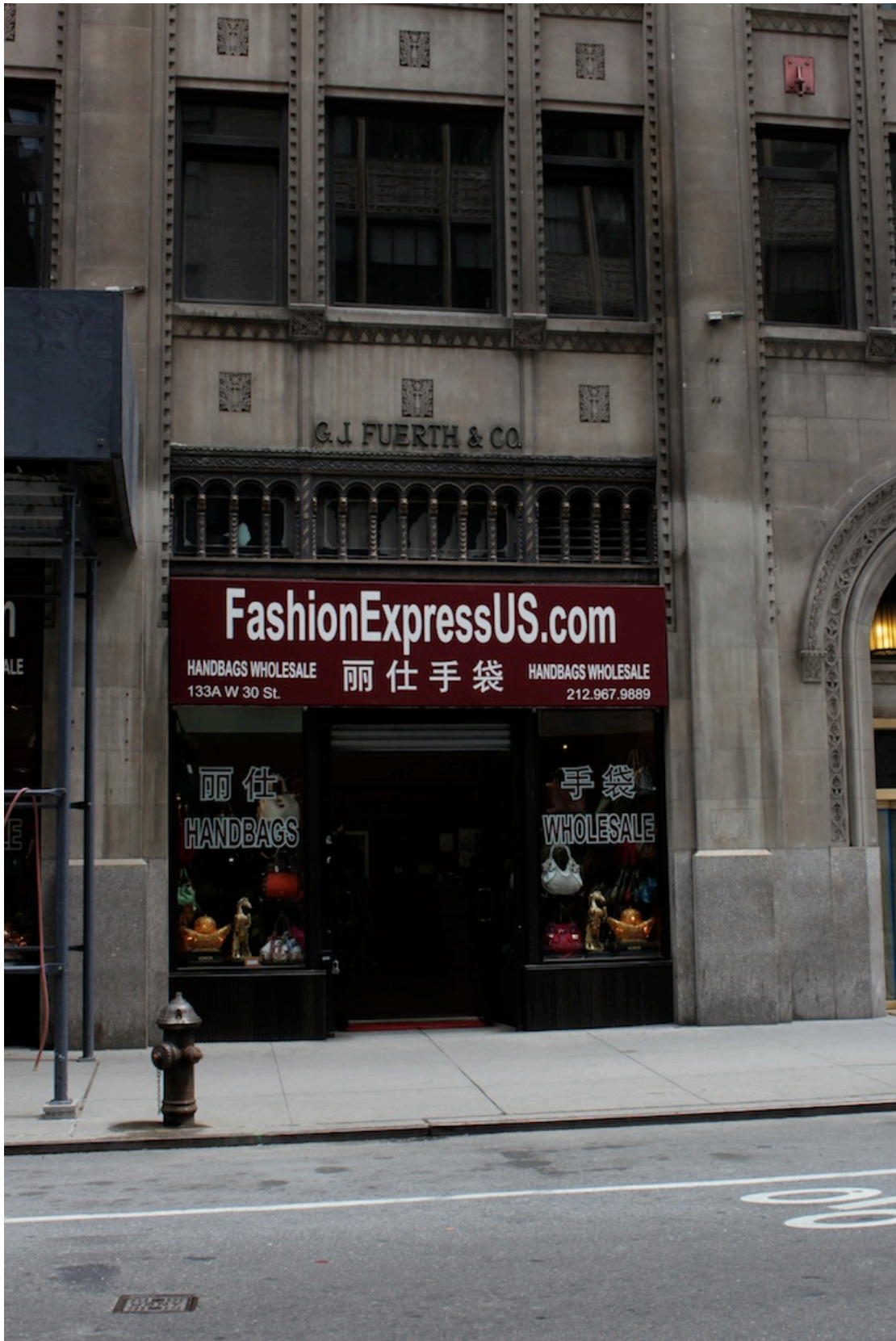
22 – No. 137 W 30 th St: G. J. Fuerth & Co. building, now a Mainland Chinese wholesaler of cheap handbags and accessories.