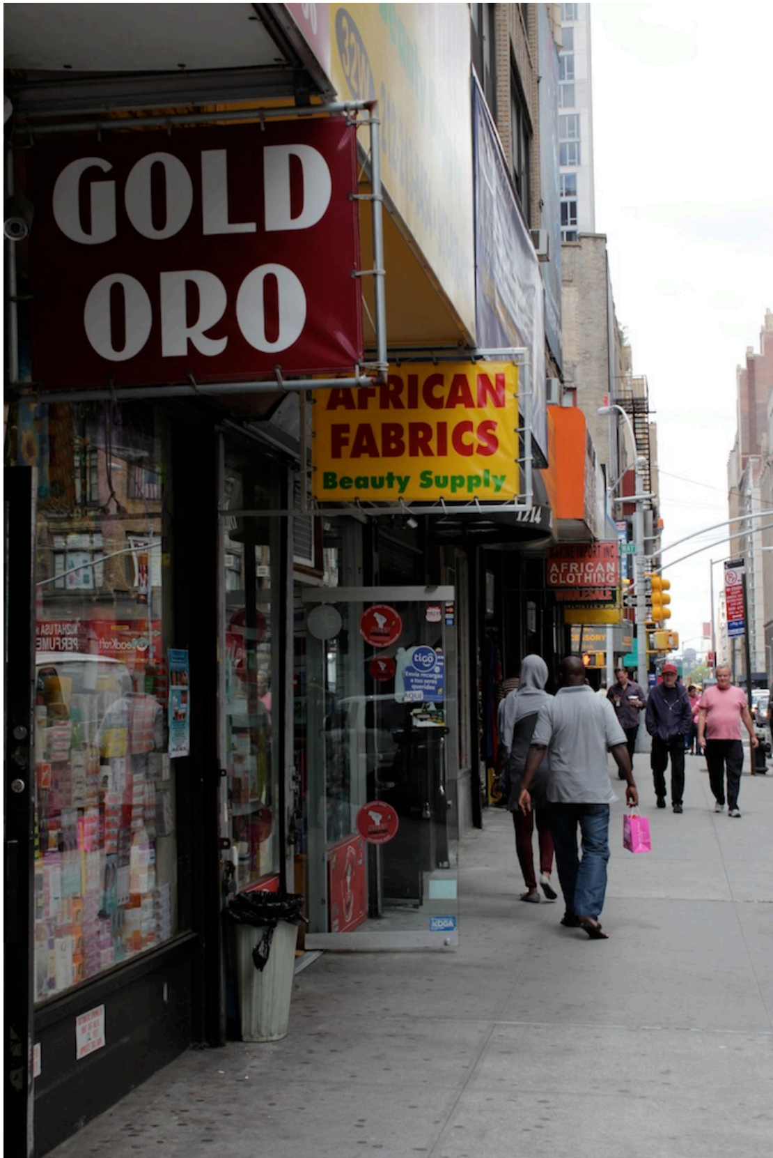
26 – African gold: fabled, possibly Solomonic.