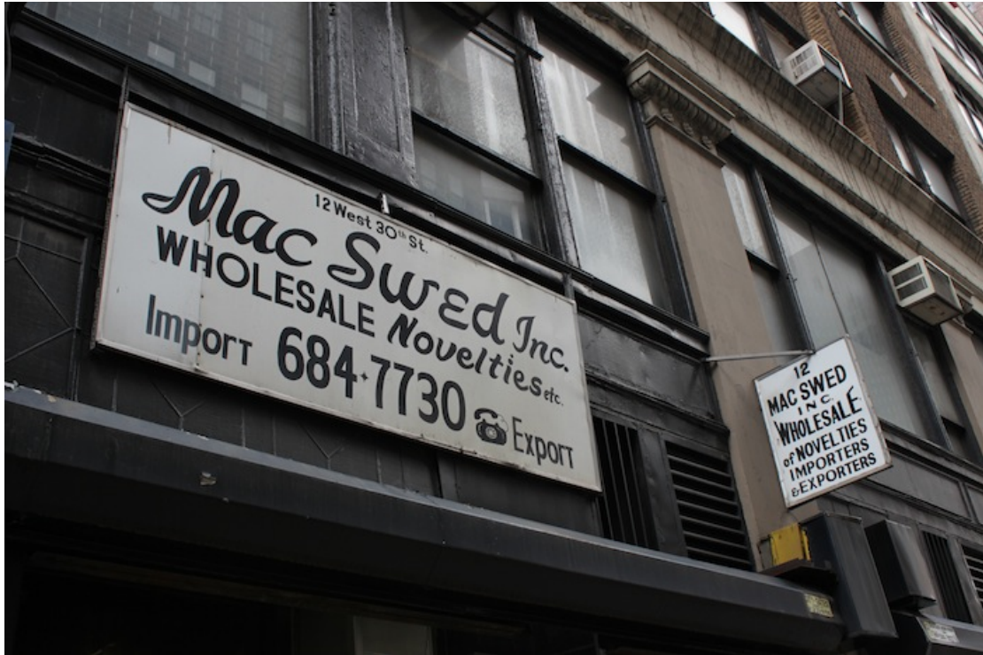
27 – No. 30 E 30 th St: Mac Swed Inc. Wholesale Novelties.