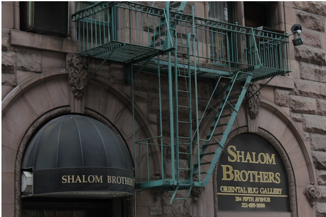
28 – No. 284 5 th Avenue: Shalom Brothers Oriental Rug Gallery.