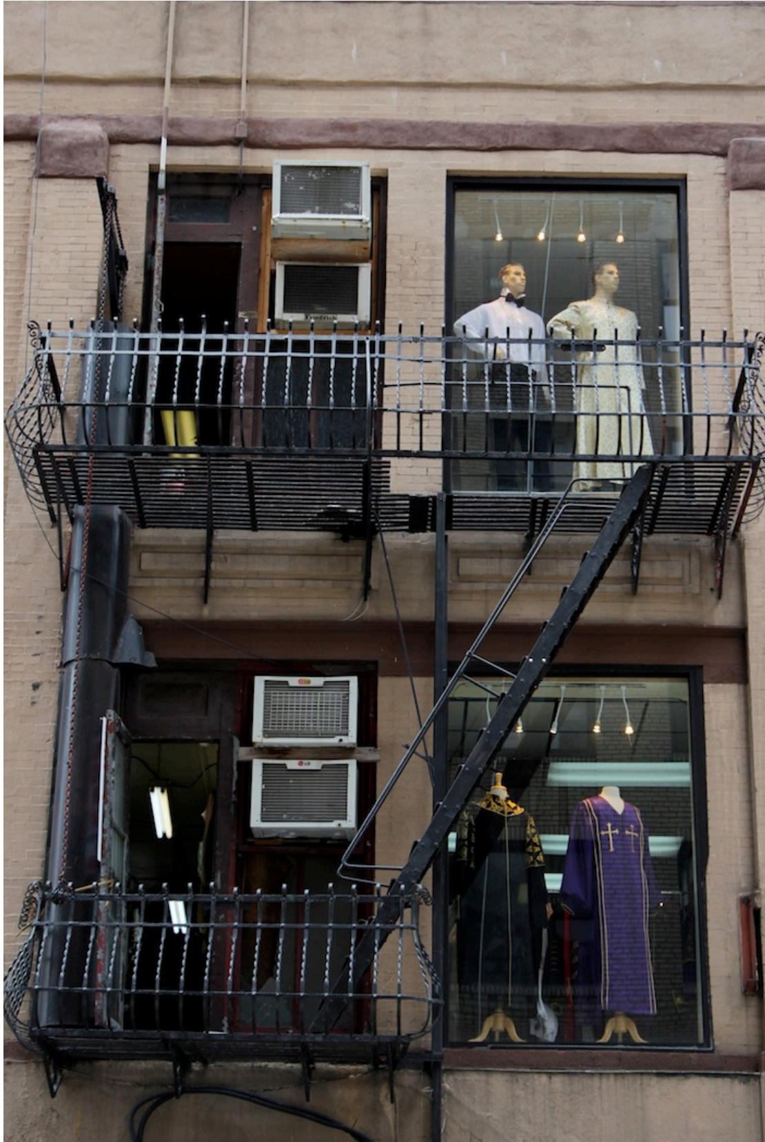
21 – Non-denominational, multi-religious fashion – Black-tie, Indian, Catholic, Jewish.