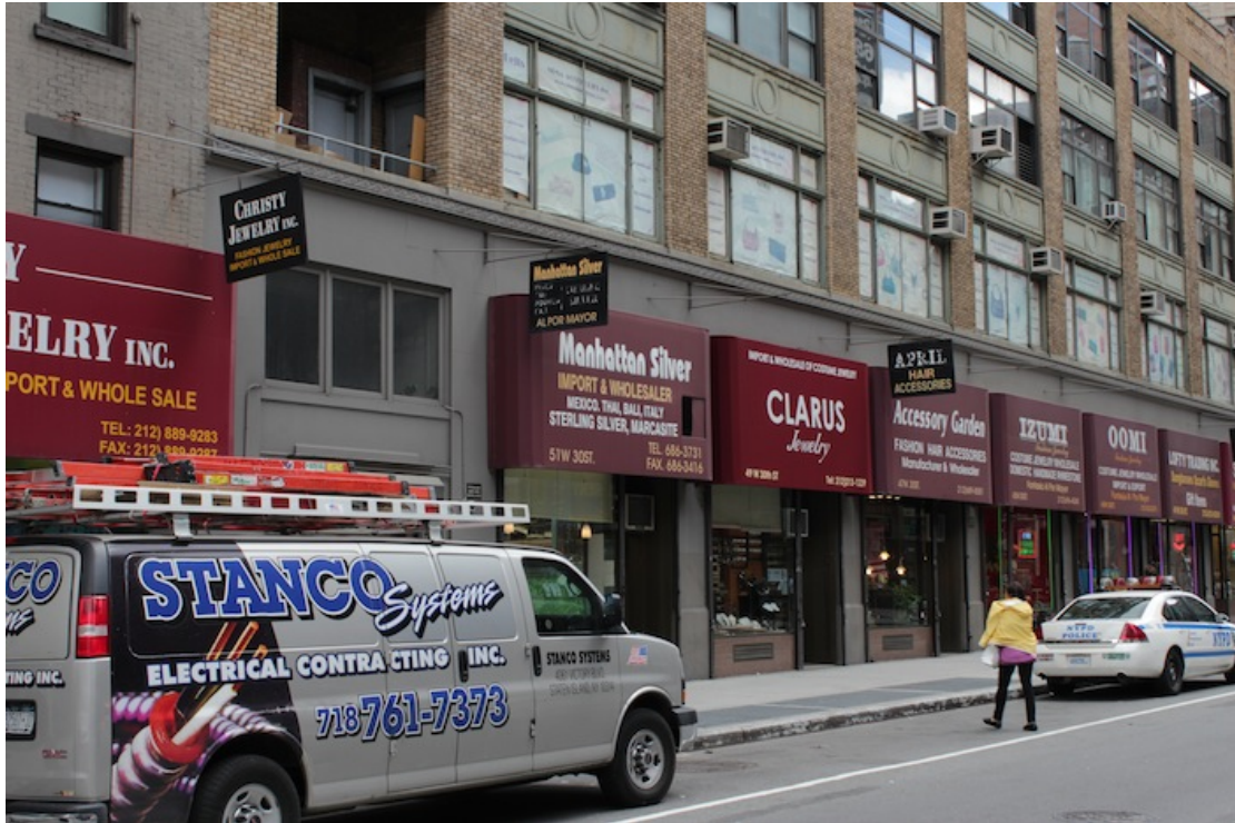
24 – Mexico, Thai, Bali, Italy: the jewellery cluster.