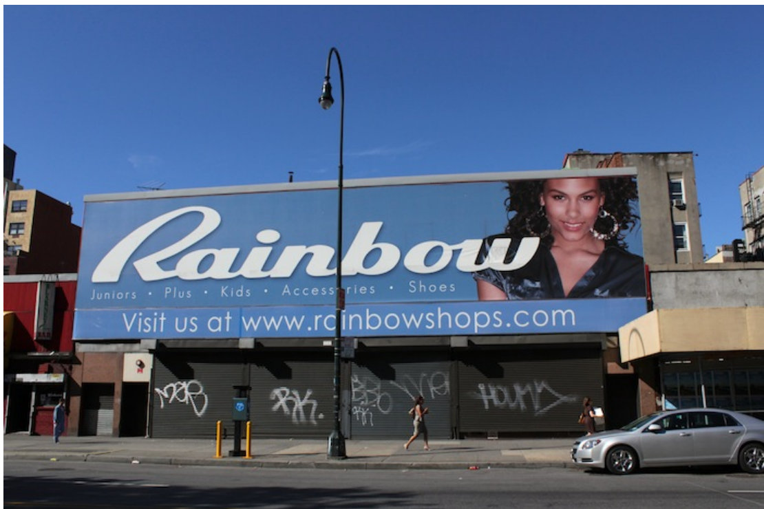
10 – South of the Border: Power-dressing