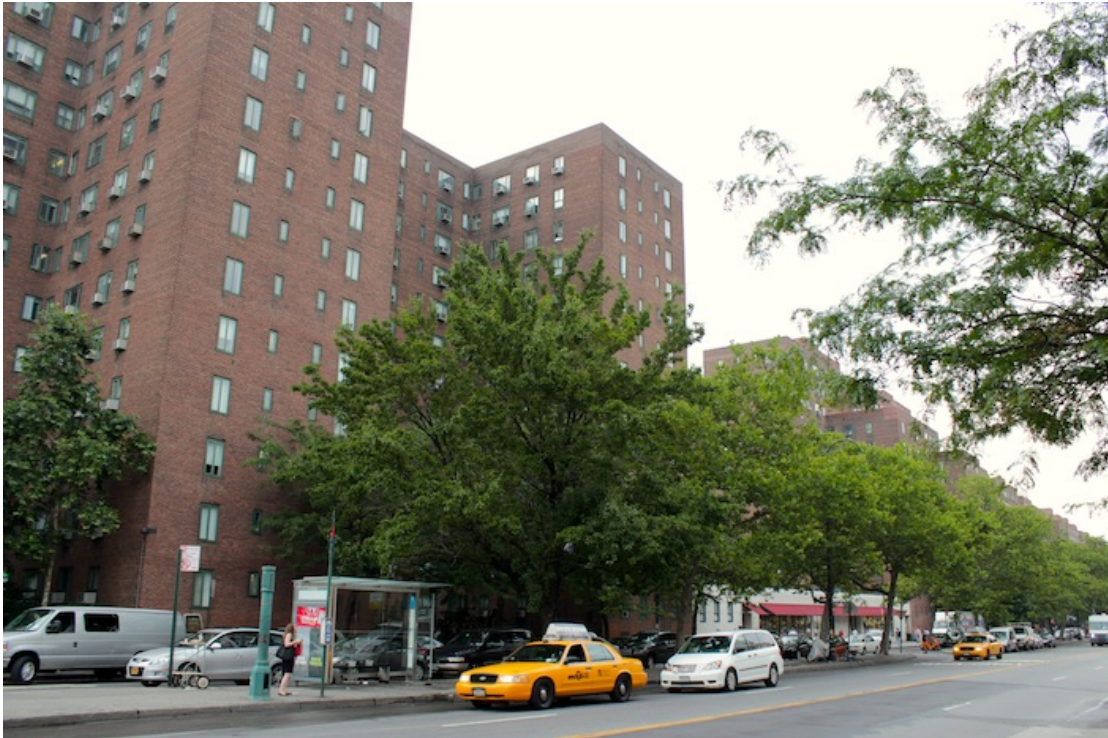
7 – North of the border: Historic post-war apartment blocks, built to house middle-income families and veterans of the World War II.