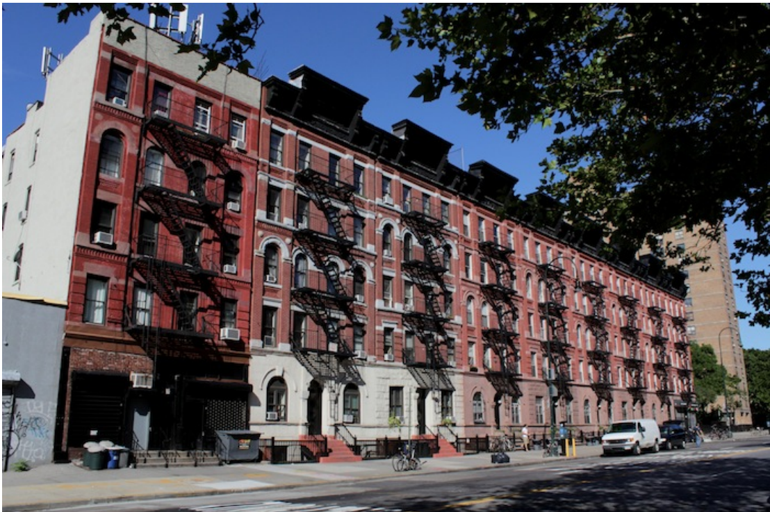
8 – South of the border: Historic Tenements, built in 1890 as one of the first large-scale housing developments for immigrants.