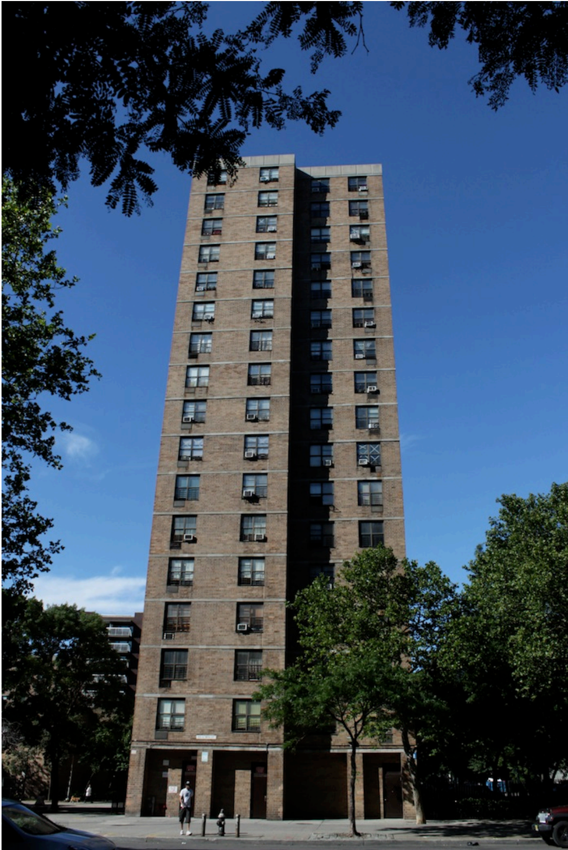
12 – South of the Border: Catholic somnolence.