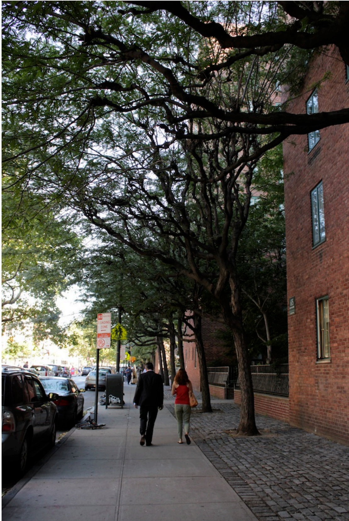
11 – North of the Border: Protestant work ethic.