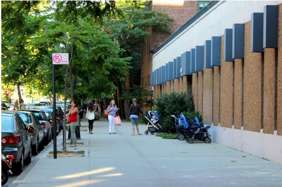
9 – North of the Border: Power-mums.