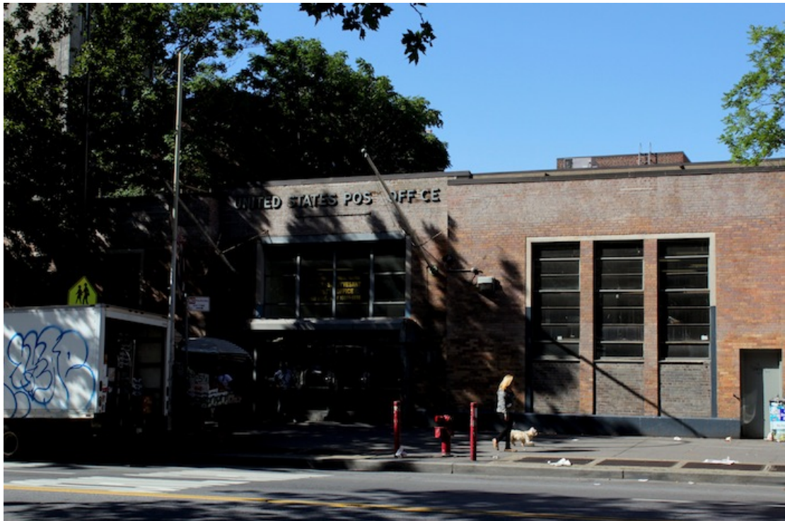
6 – Between Avenue A and 1 st Avenue: Stuyvesant Post Office (1949).