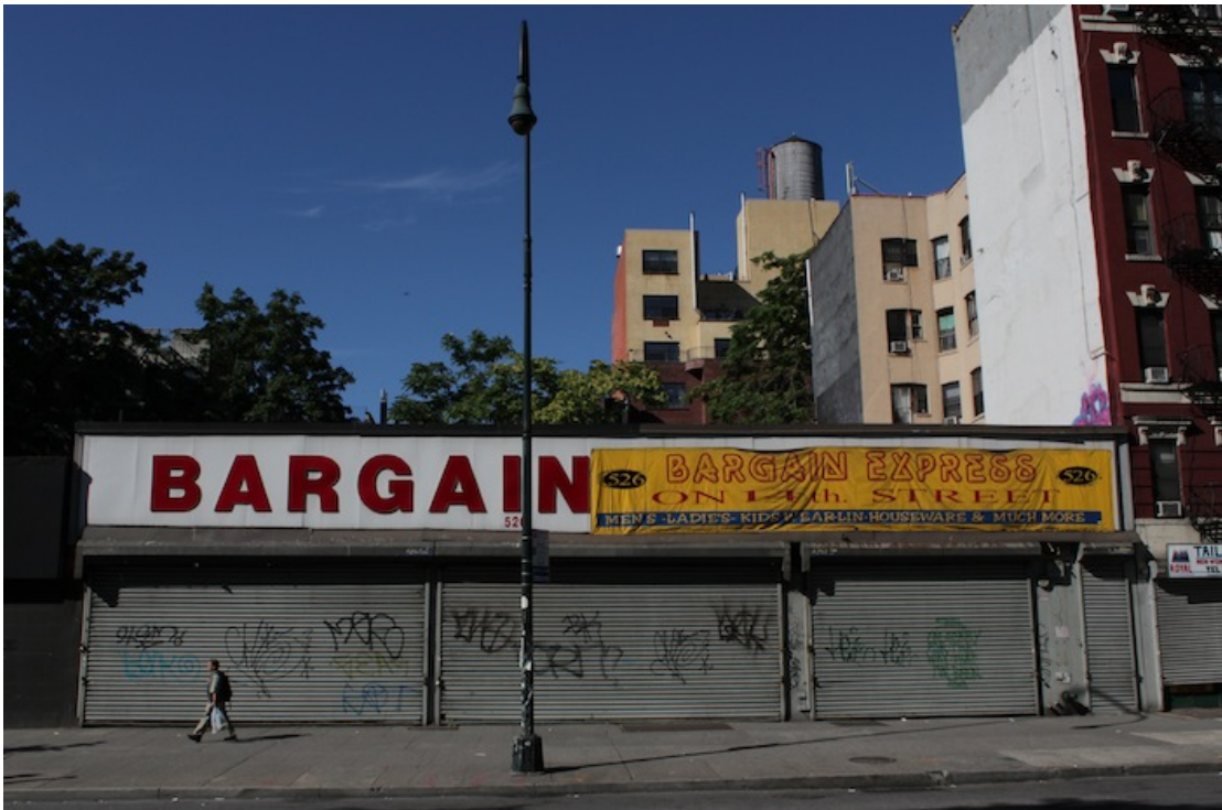
4 – Between Avenues B and A: Bargain Express.