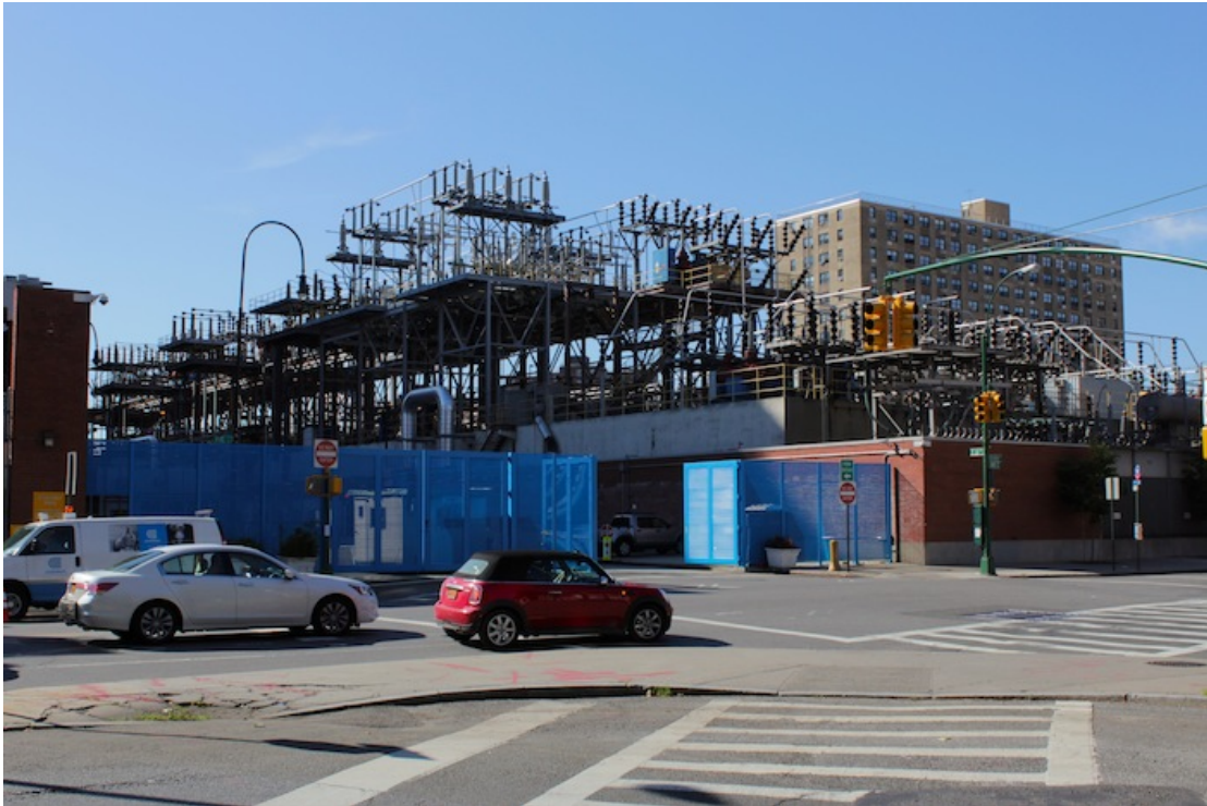
1 – Junction of Avenue C, southside: ConEd's massive East River Generating Plant occupies the whole of the West end of 14 th Street, blocking off access to the waterfront.