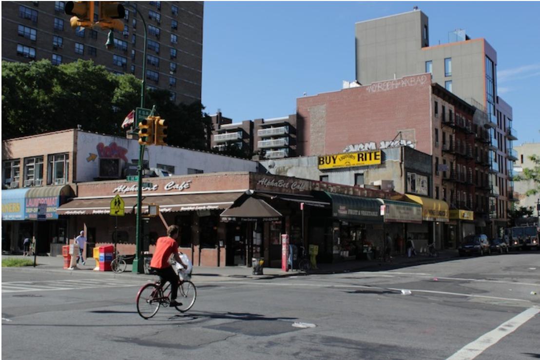
3 – Junction of Avenue B, southside: AlphaBet Café.