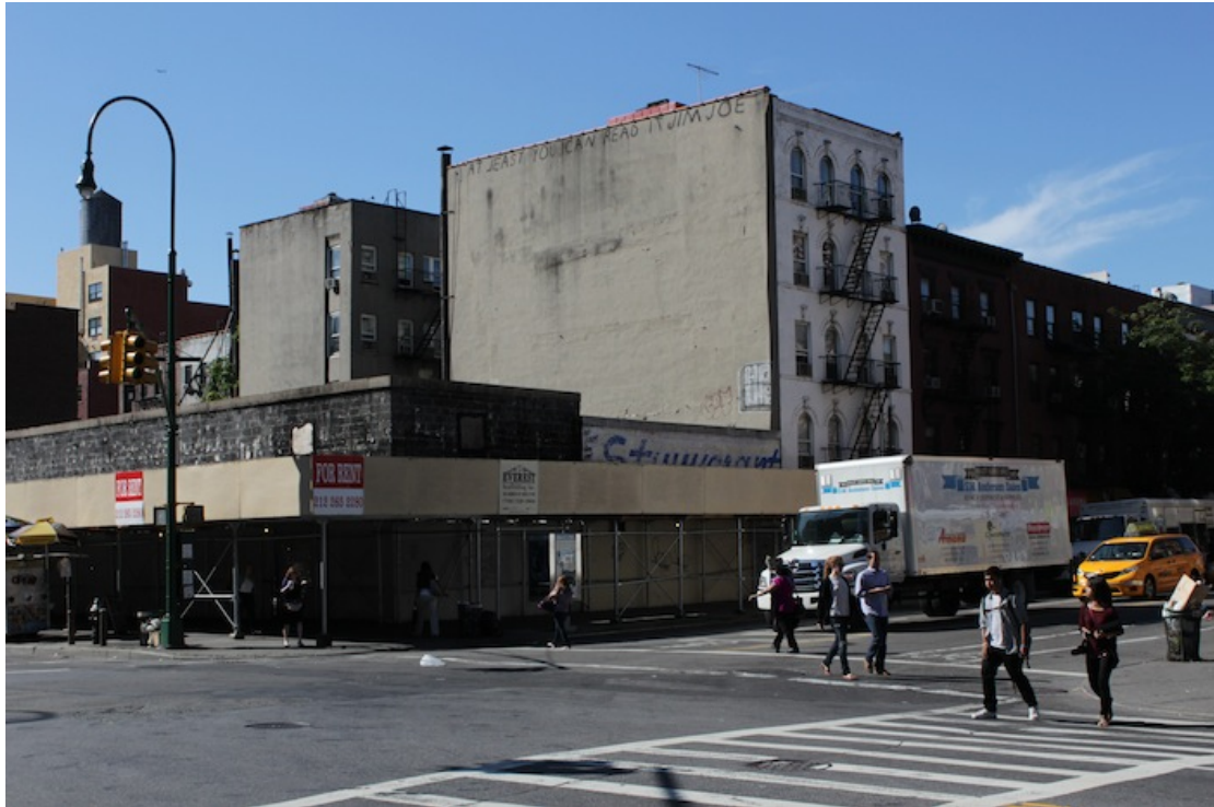
5 – Junction of Avenue A, southside: Ash-blue Stuyvesant and cake-cream scaffolding.