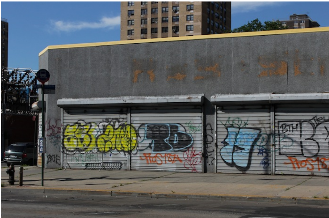
2 – Junction of Avenue C, southside: A view of shuttered storefronts, with colourful graffiti.